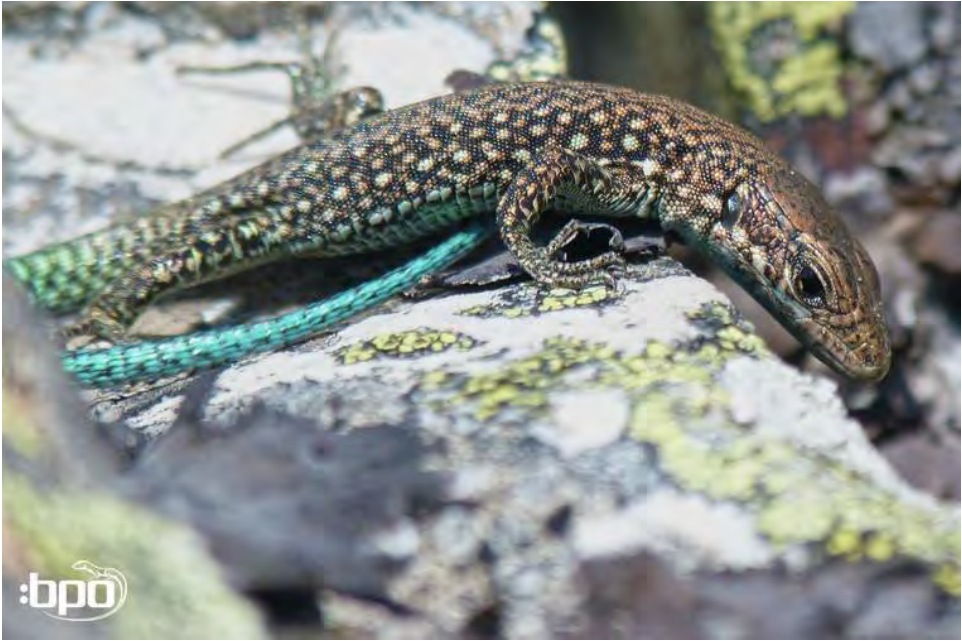
Juvenile Iberolacerta martinezricai with its characteristic blue tail