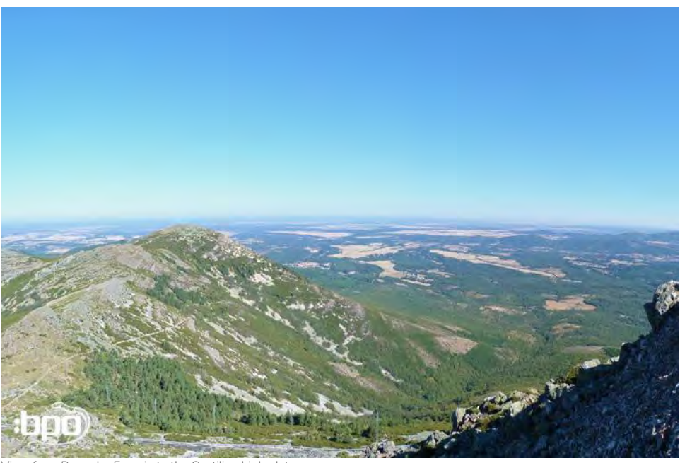
View from Pena der Francia to the Castilian high plateau

On Pena de Francia we watched out for the second rock lizard species in Central Spain – Iberolacerta martinezricai. We had low expectations with regard to that species, as it is rather rare and sometimes tricky to be found. During the three days of our stay we came across several juveniles but didn't find any adult – they simply weren't out at that time!