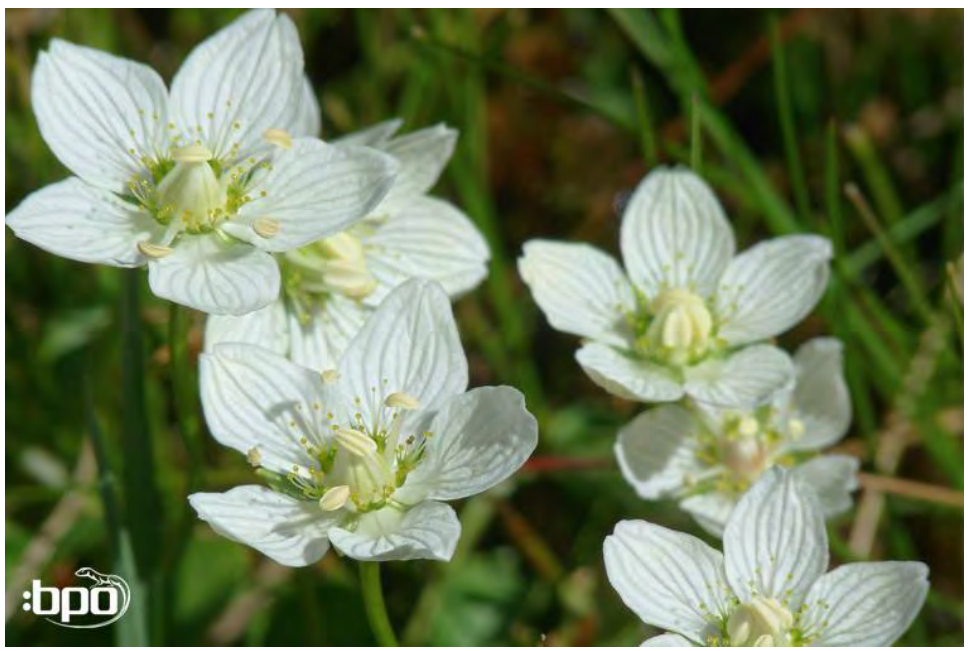
At Laguna Grande Parnassia palustris was flourishing