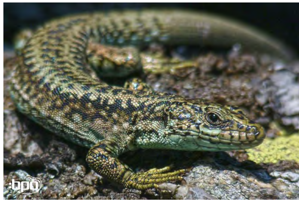
And again – Iberolacerta cyreni: in contrast to the lizards from Gredos the ssp. cyreni doesn't have bright green colours