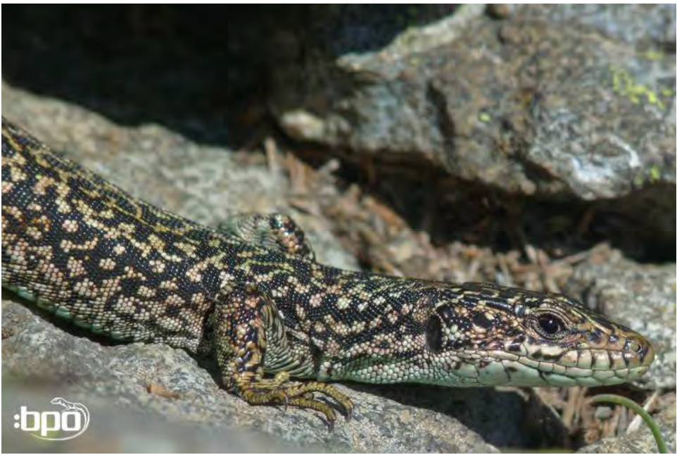
...and a dark coloured specimen – the lizards were active during the whole day, even basking in the bright afternoon sun.