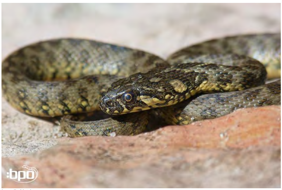
Juvenile Natrix maura