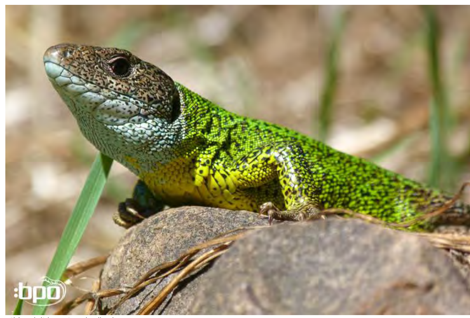
...this adult Lacerta schreiberi