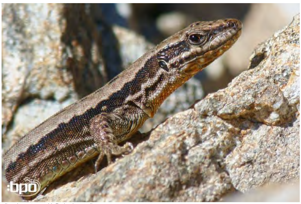
lives in syntopy with Podarcis muralis