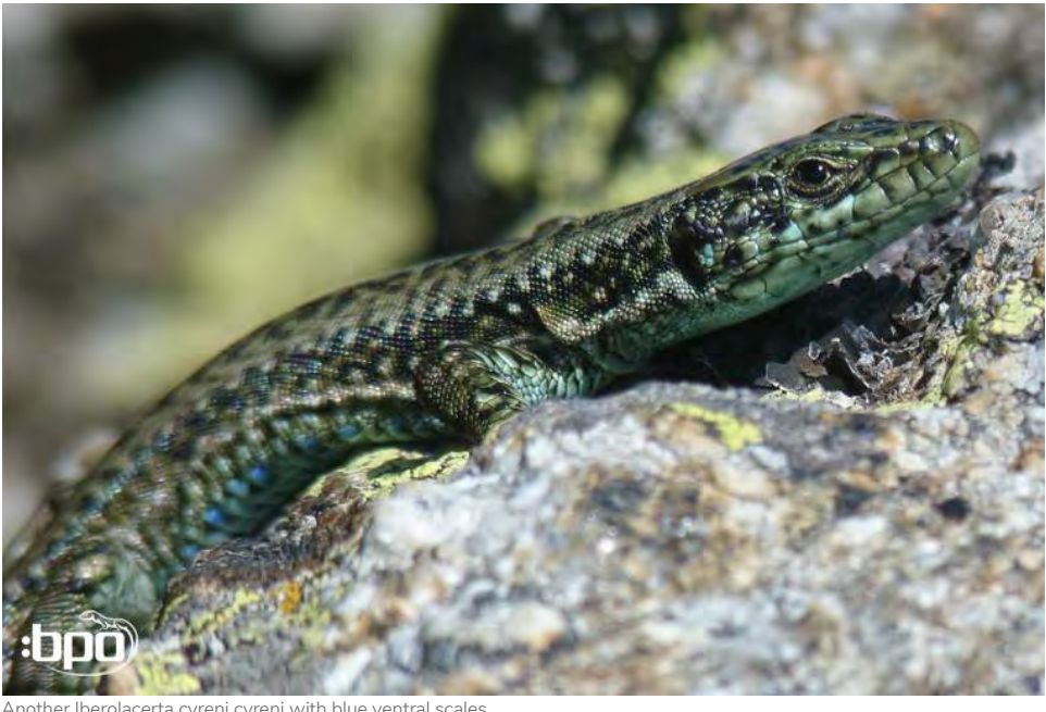
Another Iberolacerta cyreni cyreni with blue ventral scales...