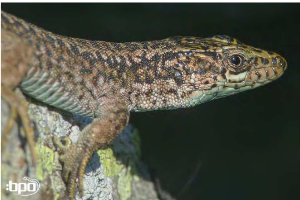
The lizards could be found during the whole day – but as the weather turned windy in the evening, they disappeared in rock crevices