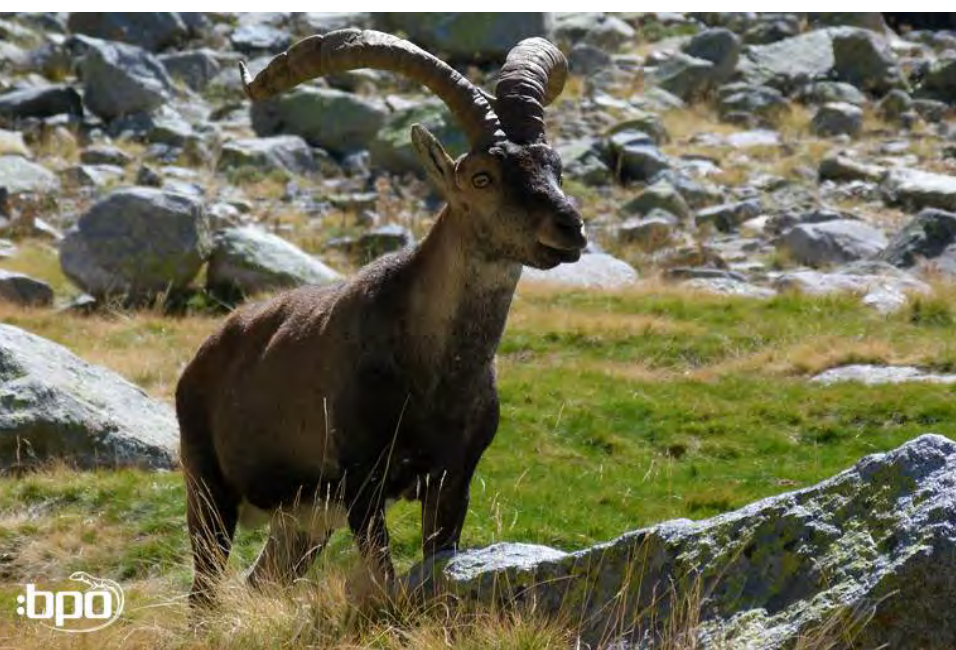
n the Gredos nature reserve, Capra pyrenaica can be seen everythere – the animals aren't shy at all