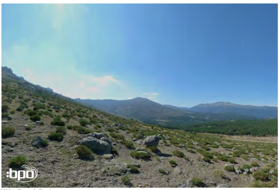
Within Sierra de Guadarrama