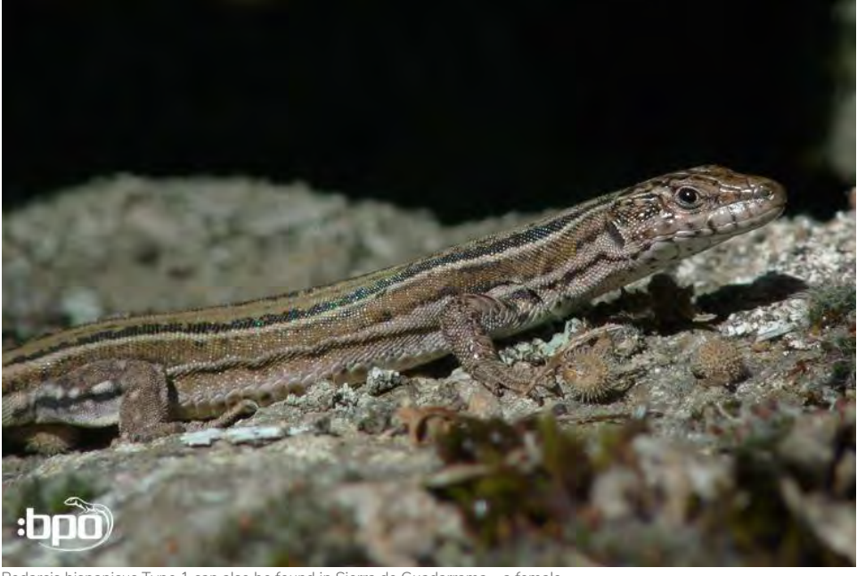
Podarcis hispanicus Type 1 can also be found in Sierra de Guadarrama – a female