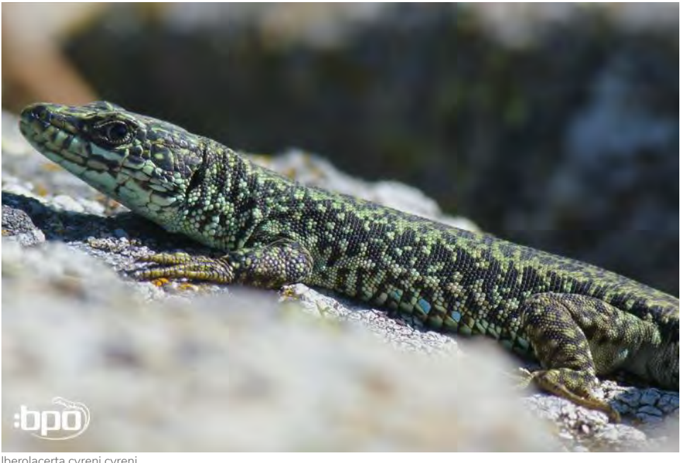
Iberolacerta cyreni cyreni...