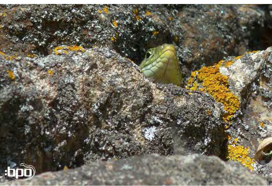
Our only shot of Timon lepidus