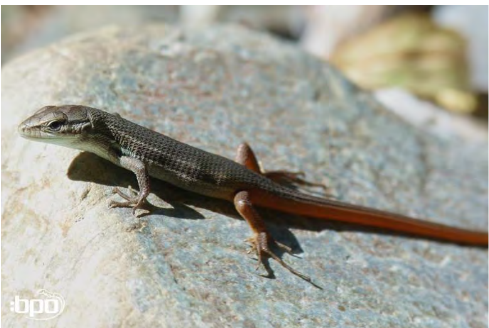
The most widespread lizard in Spain: Psammodromus algirus