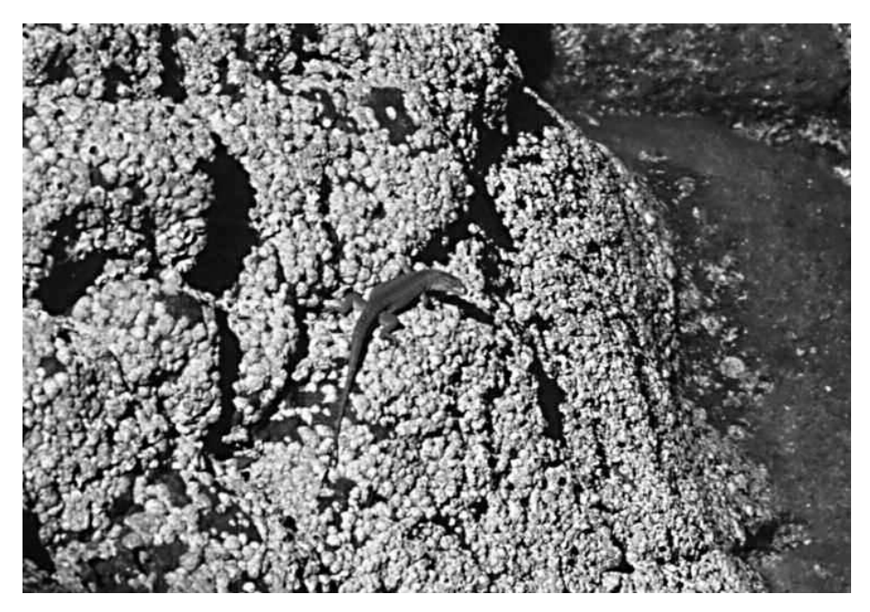
Fig. 4 — A male lizard hunting Lygia italica in the intertidal zone of La Canna (26 June 2005).

for their low profitability and noxiousness. Also vegetal matter seems to play a significant role in the diet of these lizards, with a percentage higher than those found in other populations of P. raffonei (see LUISELLI et al. , 2004; LO CASCIO, 2006). Furthermore, with the only apparent exception of Dactylis glomerata , all the plant species growing on the stack are used as trophic resources by the lizards.