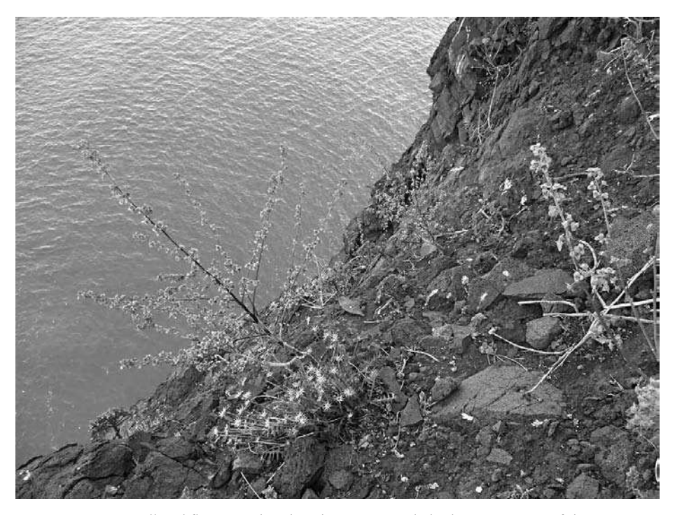
Fig. 2 — A very small and flat area, placed at about 50 m a.s.l., harbors most part of the vegetation occurring on the eastern slope of La Canna.

extinction of the autochthonous species in most part of its native range (see LO CASCIO, 2010).