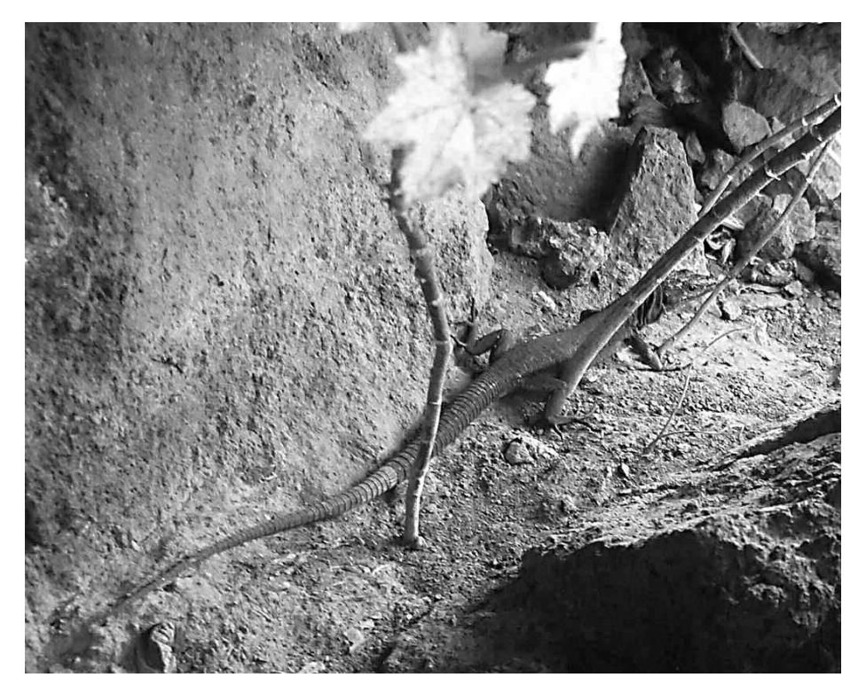
Fig. 3 — A male of Podarcis raffonei in the small flat area of the eastern slope of La Canna.

From 16 examined pellets ( N = 11 sampled the 28 June 2014; N = 5 the 26 June 2005, including 1 obtained from an handled specimen), remains of 115 arthropod prey have been identified (mean = 7.18 \pm \text{s.e.} 3.01 identifiable prey items per pellet). Prey size was determined for 66% (N = 76) of the examined items and ranges from 2 to 7 mm, with a mean of 3.04 \pm 0.06 mm.