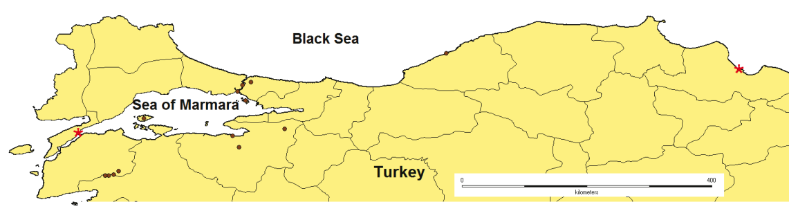
Figure 1. The current distribution of P. siculus in Turkey. Circles show the known records of the literature cited in the text, and squares indicate Gelibolu and Atakum.

Pholidosis: The supraciliary plates are 6/6 (left/right) in 4 specimens (80%) and 6/7 in 1 specimen under examination (20%). In all specimens examined, the supraocular plates and the supralabial plates in the anterior part of the subocular are 4/4, and the postnasal plates are 1/1. The masseteric plates are 2/1 in 2 specimens (40%) and 1/2 (20%), 1/1 (20%), and 2/2 (20%) in the others. The