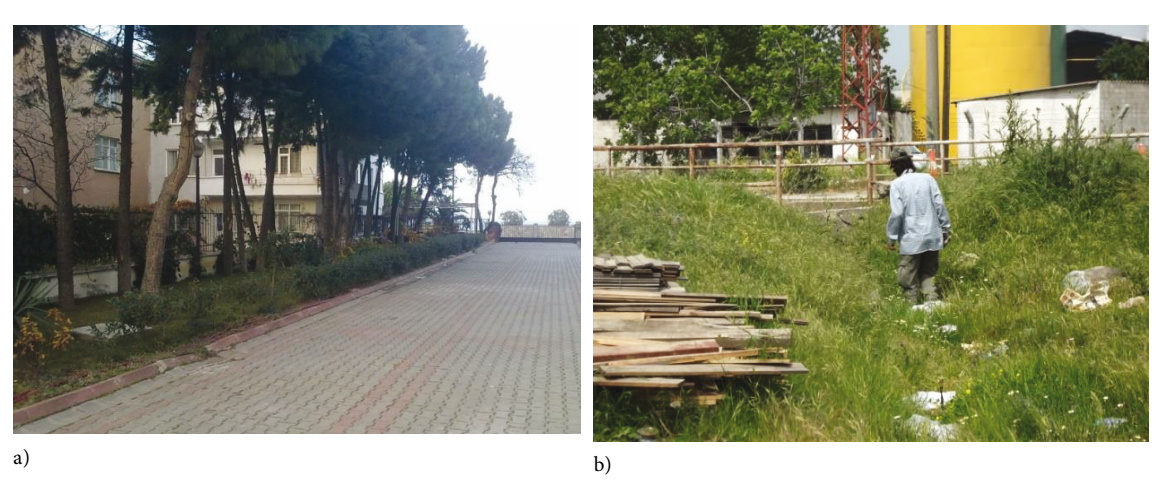
Figure 2. A general view of the habitats from (a) Atakum (Samsun) and (b) Gelibolu (Çanakkale), where the specimens of Podarcis siculus were found.