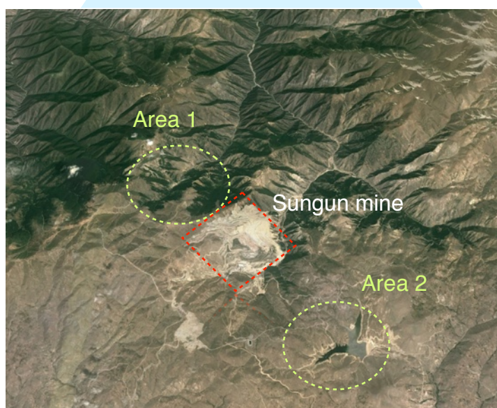
Fig. 2: Study area 1, not affected by the operation of the Sungun open-cast copper mine, and study area 2, heavily affected by the mine through the effects of water pollution..

The habitat of Darevskia raddei is the high steppe and rocky areas close to streams (ANDERSON 1999), and this lizard can also be found in high altitude forests. The flora found in Darevskia raddei habitat consist of about 56 species, among them are: Fragaria vesca L, Cotinus coggygria , Rhus coriaria L, Berberis vulgaris L, Anthemis nobilis , Cornus mas L, Euphorbia helioscopia L, Lamium album L and Salvia sclarea L.(Fig .3).