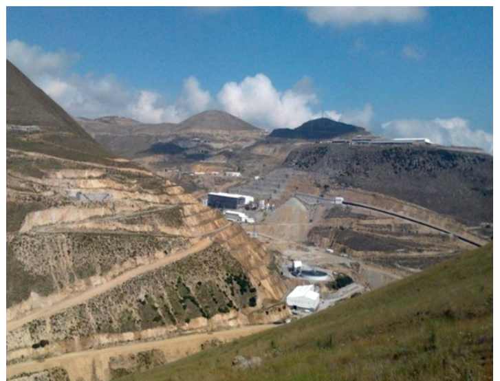
Fig. 5: Sungun open-cast copper mine.