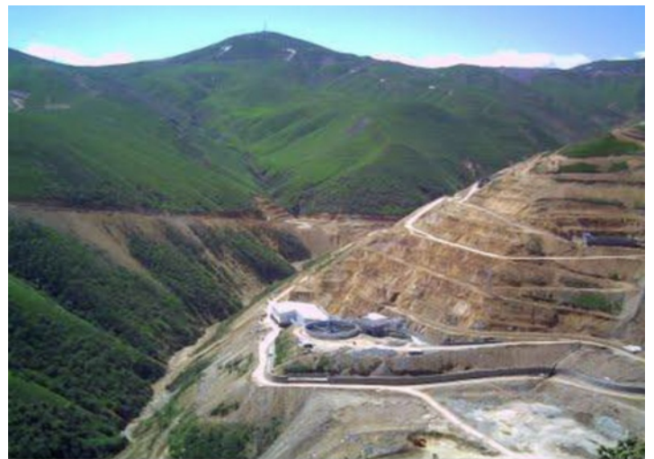
Fig. 4: Sungun open-cast copper mine.