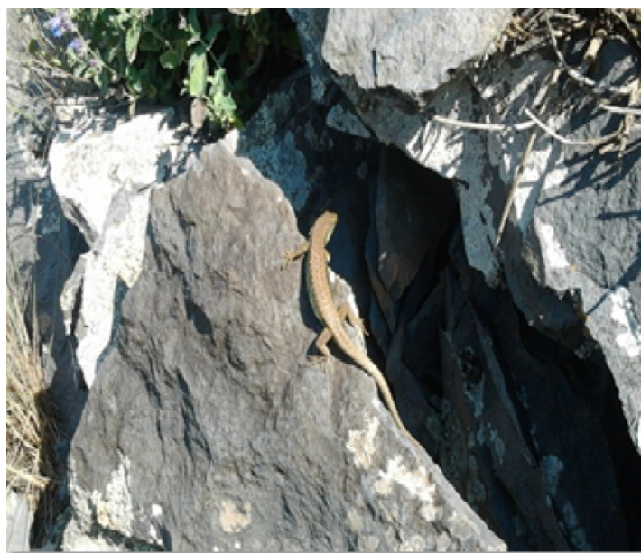
Fig. 6: Darevskia raddei raddei .

subsurface. Weathering of mine waste piles can increase concentrations of toxic elements downstream from the mine site as reduced phases in their host minerals oxidize (LOTTERMOSER et al. 1999 ; MUNROE et al. 1999 ; BANWART & MALMSTRÖM 2001 ; BABA & GUNGOR 2002).