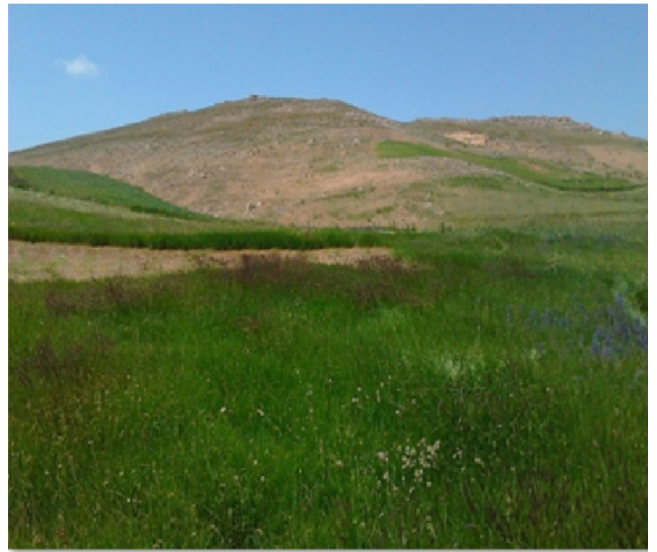
Fig. 3: Unaffected high steppe habitat.

The third factor, with probably the greatest impact on the environment as a whole, is water pollution. The waste of this mine has high concentrations of toxic chemicals, such as arsenic, sulfuric acid, and mercury over a significant area of surface and