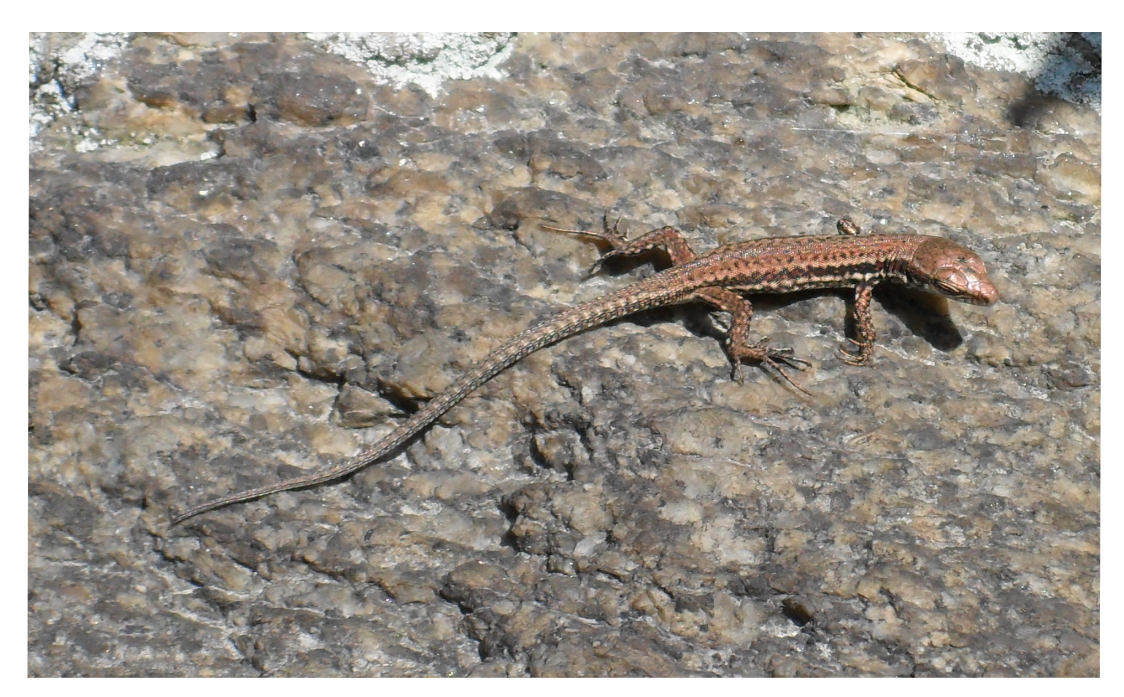
Figure 4. Freshly hatched individual of Podarcis muralis (Laur.) (Strzelin).

2011). Polish populations could be considered as the northernmost limit of the species range (Fig. 3).