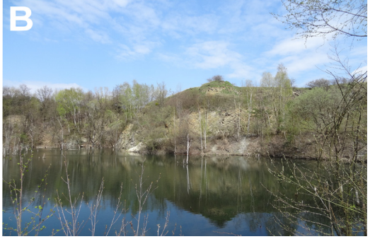
Figure 2. Habitats of common wall lizard, Podarcis muralis (Laur.), in Poland. A – Strzelin, B – Przeworno.

Behaviour was also an important aspect. The common wall lizard is a good climber and some lizards fled onto vertical rock walls, occasionally several meters high.