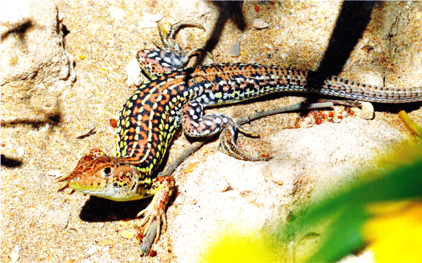
Fig. 475: Acanthodactylus margaritae , male. Oued Massa.