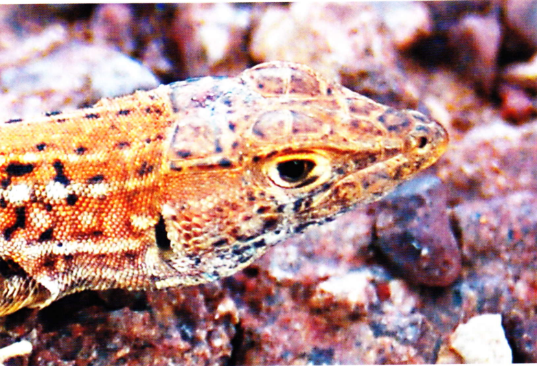
Fig. 474: Portrait of an Acanthodactylus margaritae. Agadir.

Common names: Margarita's Fringe-fingered Lizard (E), Acanthodactyle de Margarita (F), Lagartija de Margarita (S).