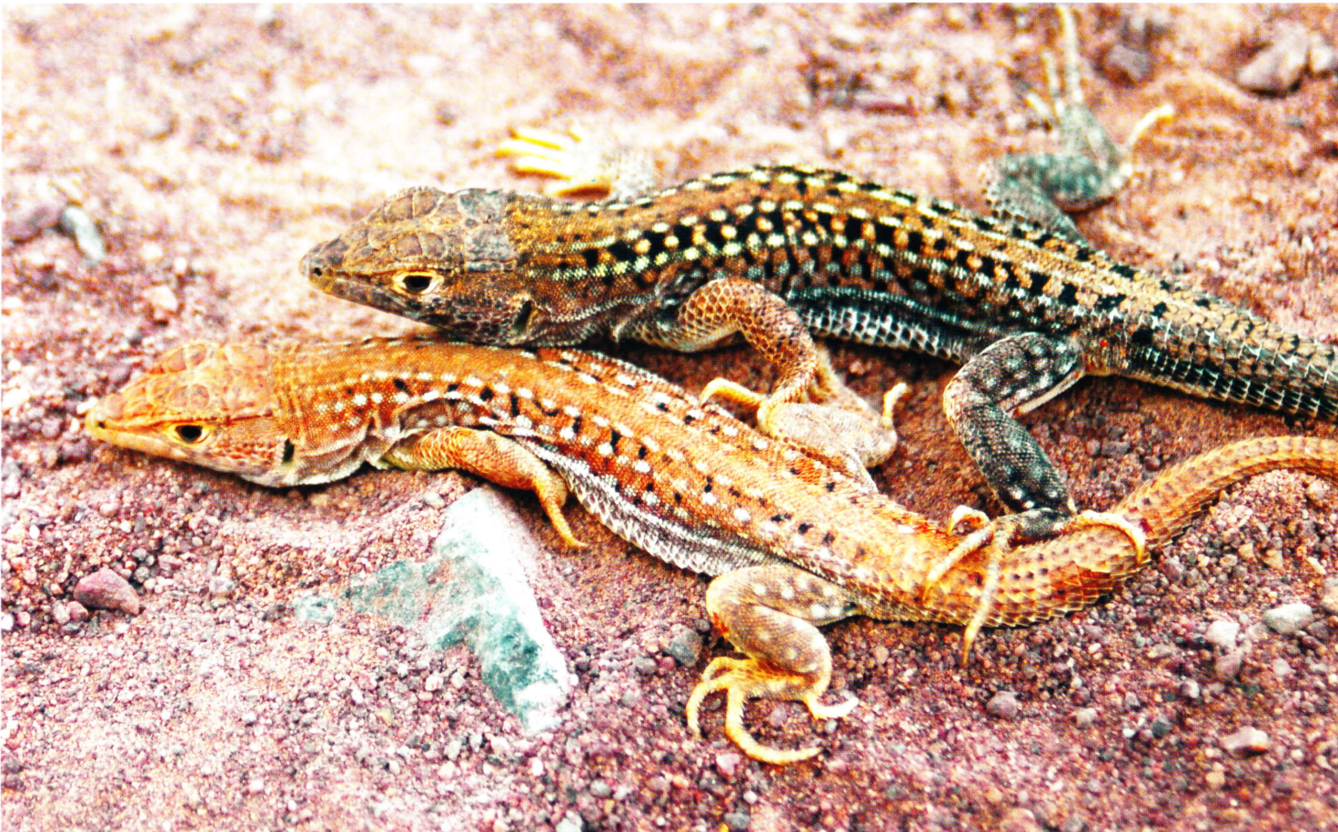
Fig. 476: Acanthodactylus margaritae , male (on top) and female. Agadir.