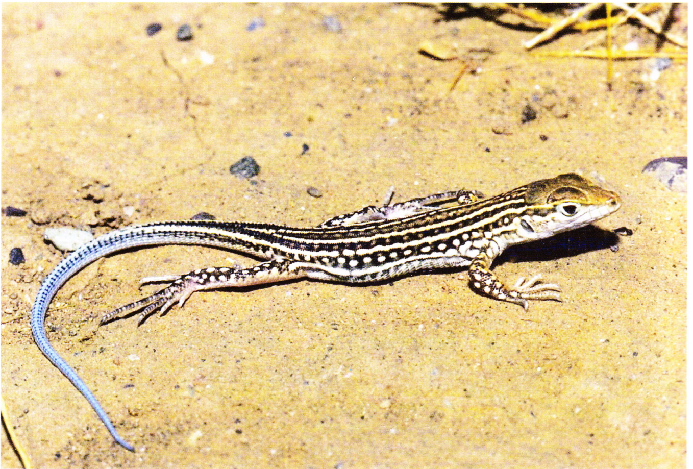
Fig. 477: Acanthodactylus margaritae , juvenile. 24 km east of Taroudant.