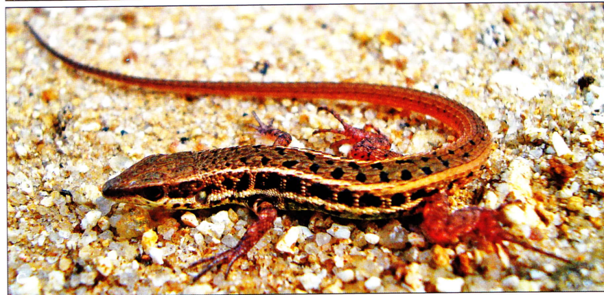
Fig. 208 – Ophisops leschenaultii lankae : A, B: lateral and dorsal aspects of adult male; C: dorsolateral aspects of juvenile (Monaragala).