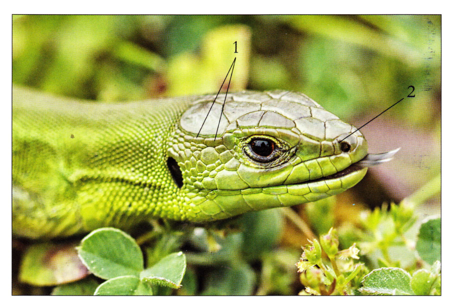
Fig. 216: Head of a green morph male Podarcis tauricus showing small supratemporal (1) and single postnasal (2) scales typical of the species of Podarcis , separating them from Lacerta .

species has a relatively short head but the overall size is about the same as for P. muralis and A. nigropunctatus with a total length of 17–20 cm, females being slightly smaller than males. The tail is 65–70 % of the total length and the body mass is 4–8 grams. It is a very polymorphic species with colour variation not only between but also within populations, ranging from beige and green with dark spots to almost uniformly green, sometimes with blue spots on the sides and shoulders.