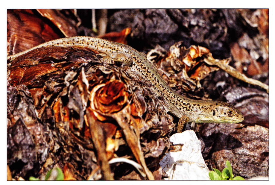
Fig. 210: Spotted Podarcis tauricus ionicus with almost no green colour from the small islets of Lazaretto.