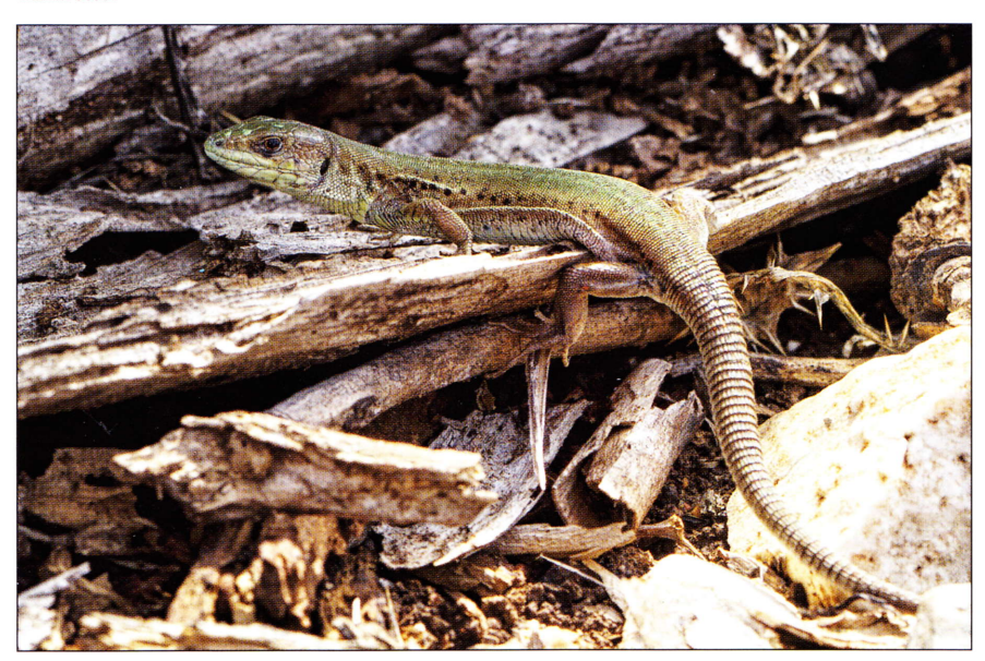
Fig. 211: Podarcis tauricus ionicus from Lazaretto.