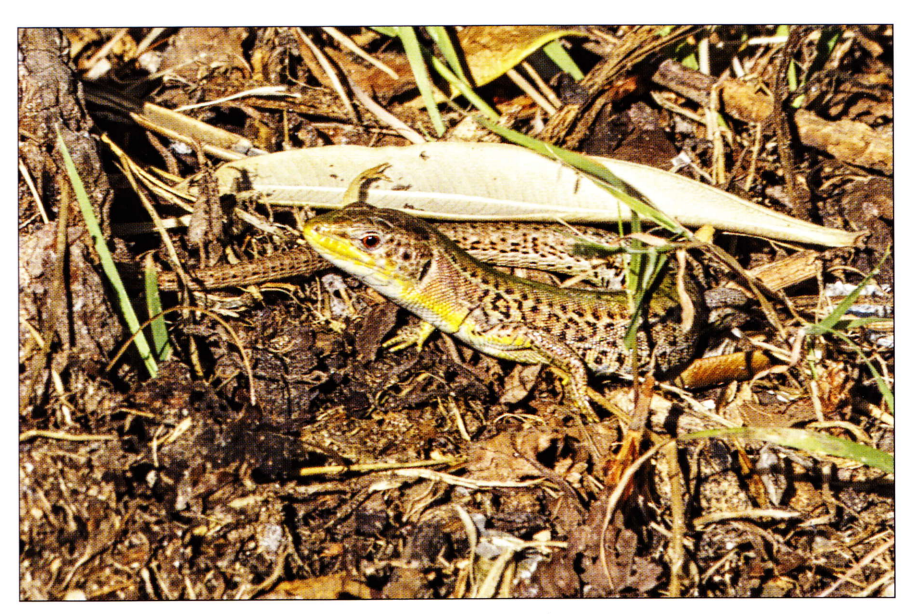
Fig. 214: Podarcis tauricus ionicus from Corfu town in early June.