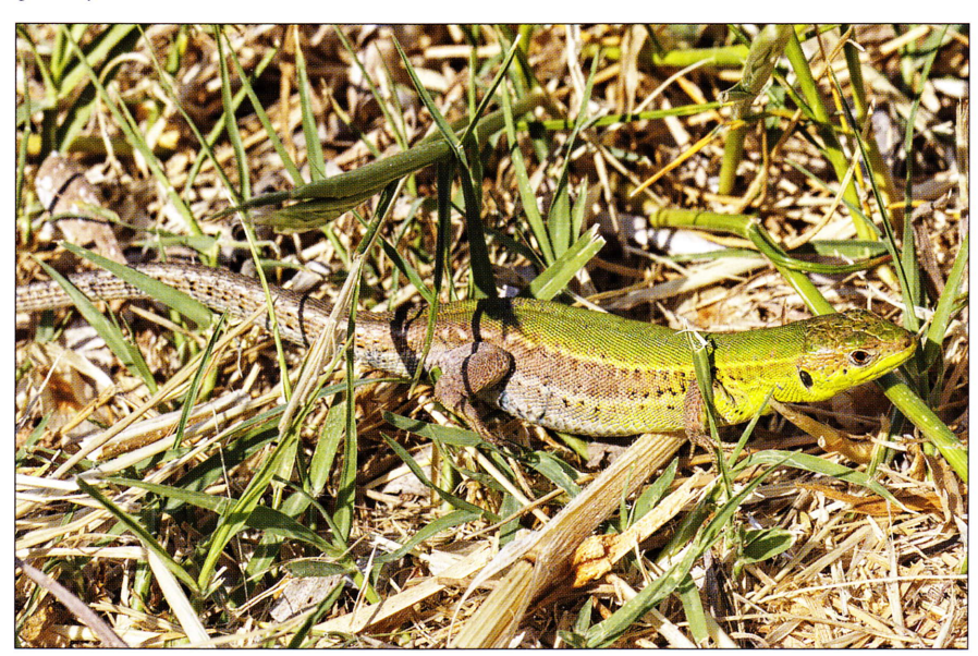
Fig. 213: Female Podarcis tauricus ionicus from northern Corfu.