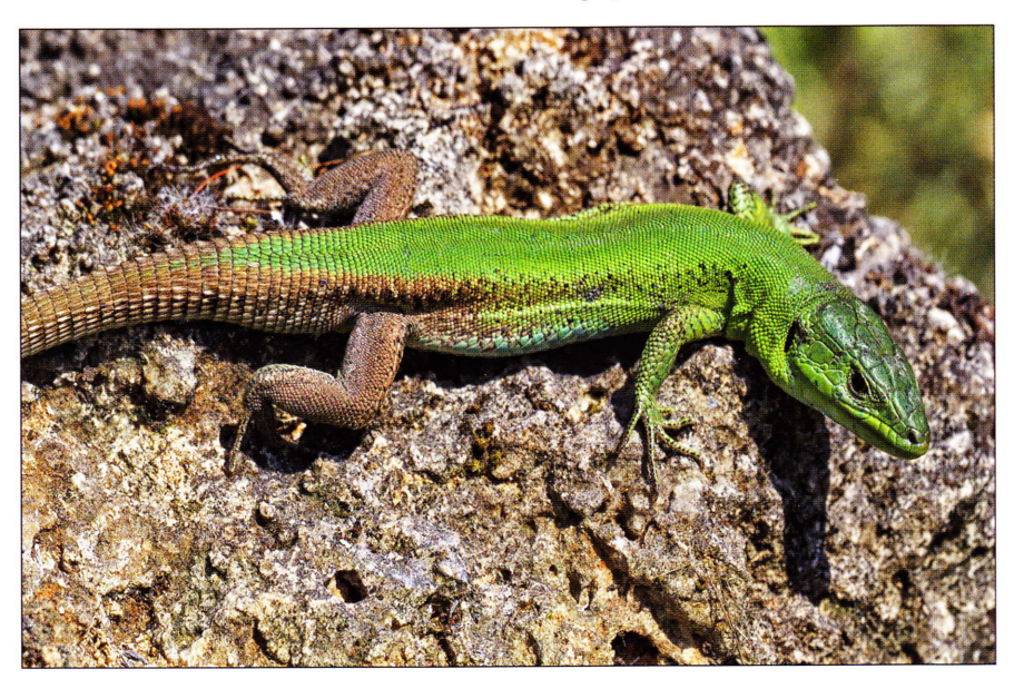
Fig. 209: Male Podarcis tauricus ionicus from southern Corfu.

P. tauricus is a typical terrestrial species found in open areas and as most lacertids it is very fast. It also has a very peculiar way of running, making 90 degree turns in order to avoid predators such as Dolichophis caspius with which it often co-occurs. In contrast to Lacerta viridis, Podarcis muralis and A. nigropunctatus it is not a climber. The