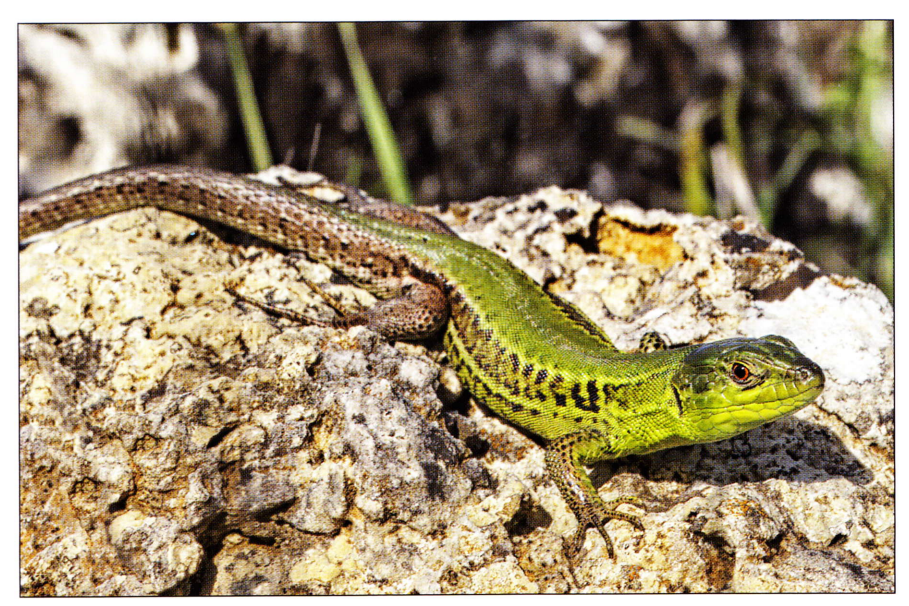
Fig. 215: Male Podarcis tauricus ionicus from central Corfu.