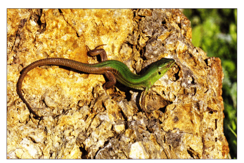
Fig. 212: A striking green morph of Podarcis tauricus ionicus from southern Corfu that could possibly be mistaken for Lacerta viridis .