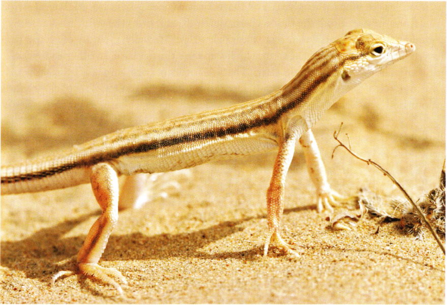
Fig. 215: Acanthodactylus gongrorhynchatus on hot sand near Dubai, UAE.