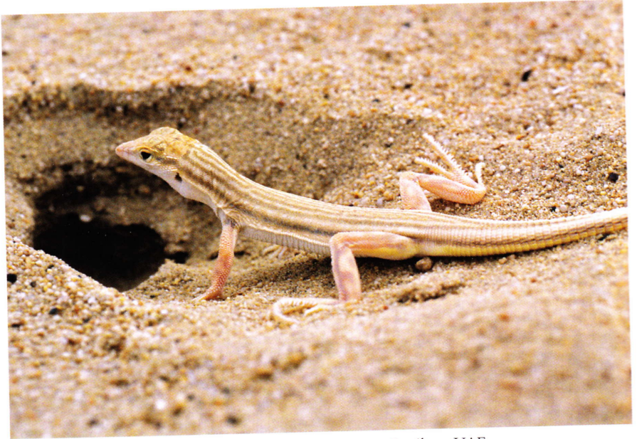
Fig. 213: Acanthodactylus gongrorhynchatus at burrow near Sweihan, UAE.