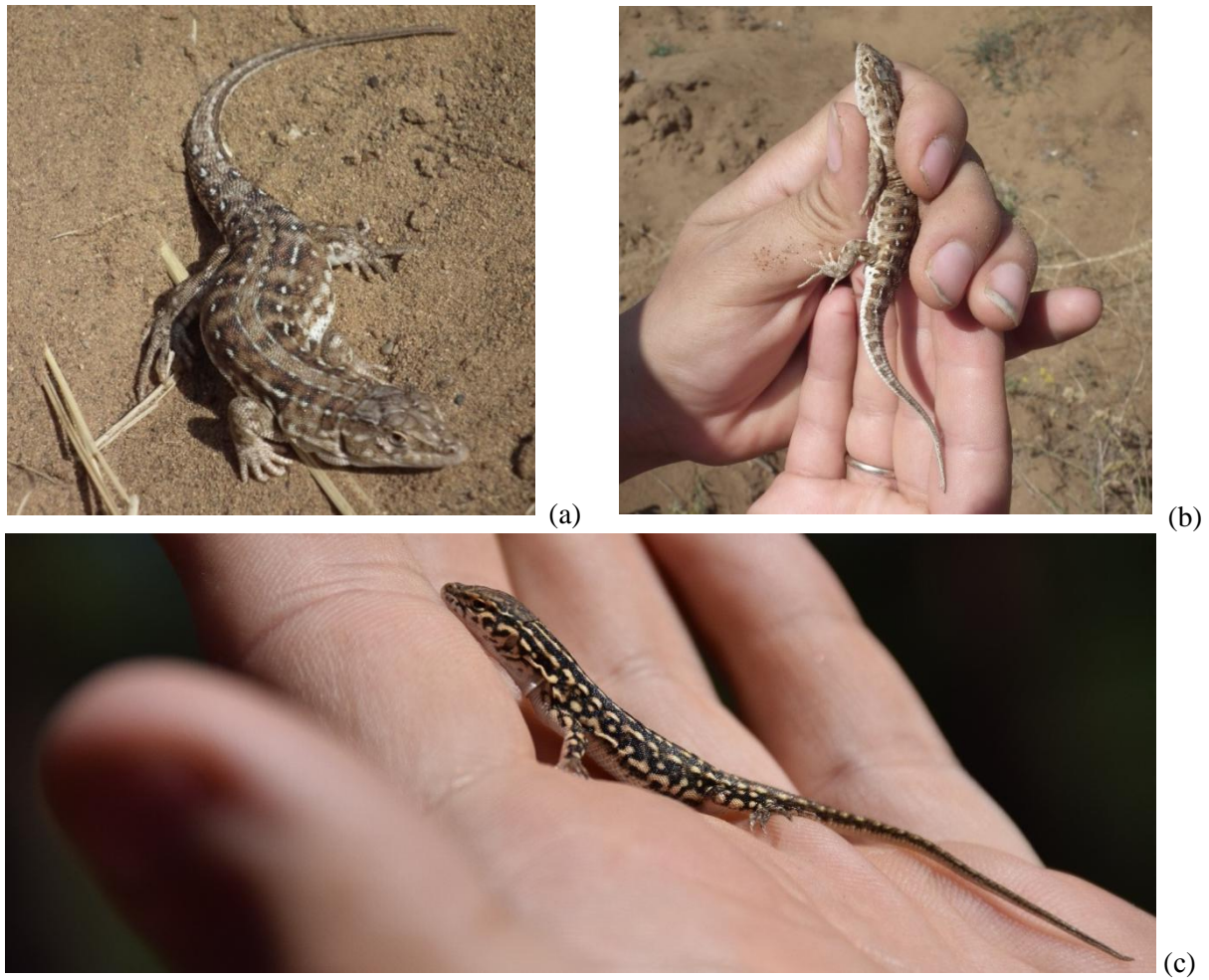
Figure 2. Steppe-runners Eremias arguta from sites 5 (a), 6 (b) and 11 (c).