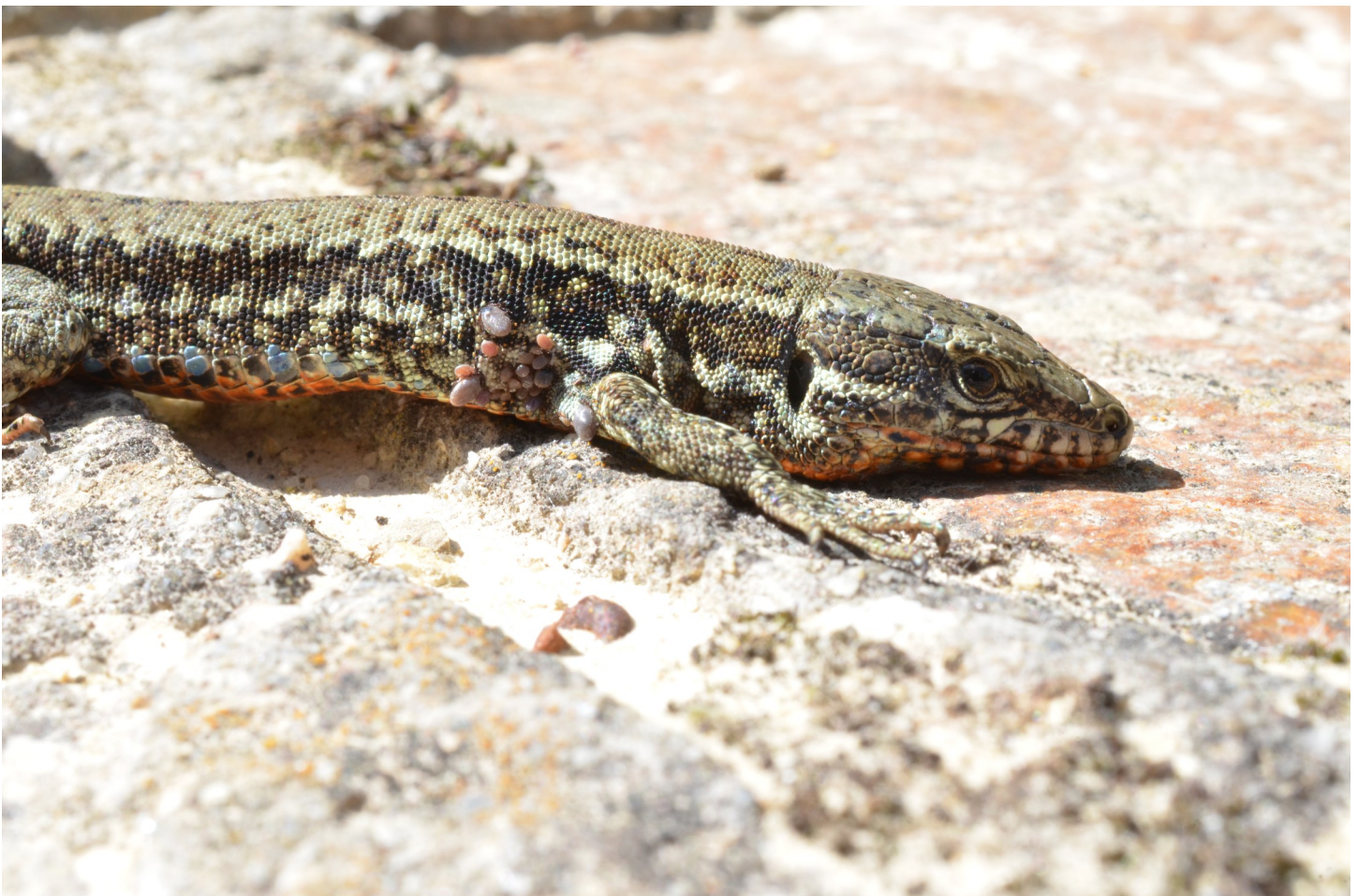
Fig 1. Ixodes ricinus larvae and nymphs in the axillary region of adult Podarcis muralis .

Of the snakes (n = 4; 2 Elaphe quatuorlineata , 1 Hierophis carbonarius , 1 Natrix natrix ) and lizards (n = 128; 5 Lacerta viridis , 15 Podarcis muralis , 106 Podarcis siculus , 2 Tarentola mauritanica ) captured in site 1, 94.7% (125/132) were infested with mites and ticks. In particular, 123 (93.2%) (1 E. quatuorlineata , 5 L. viridis , 15 P. muralis , 102 P. siculus ) reptiles were infested with I. ricinus (Fig 1) and/or N. autumnalis (Fig 2). Only lizards (n = 40; 1 P. muralis , 29 P. siculus , 10 T. mauritanica ) were captured in site 2, with 37 (92.6%) (1 P. muralis , 29 P. siculus , 9 T. mauritanica ) of them being infested with mites and, particularly, 10 P. siculus (25%) by N. autumnalis . The mean intensity (5.5, 95% CI: 5.4–6.2%) and abundance (5, 95% CI: 4.45–5.6%) were calculated on a total of 120 reptiles from site 1, which were infested with I. ricinus .