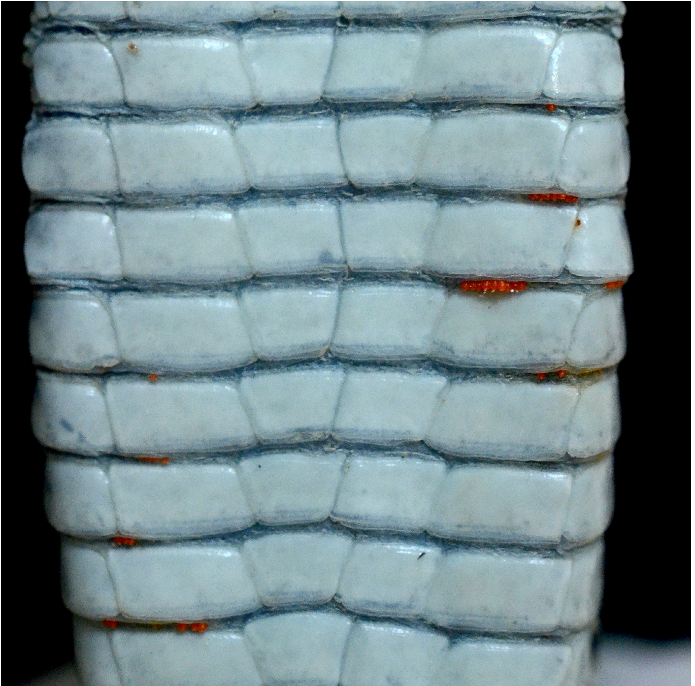
Fig 2. Neotrombicula autumnalis larvae in the ventral region of adult Podarcis siculus .

https://doi.org/10.1371/journal.pntd.0009090.g002