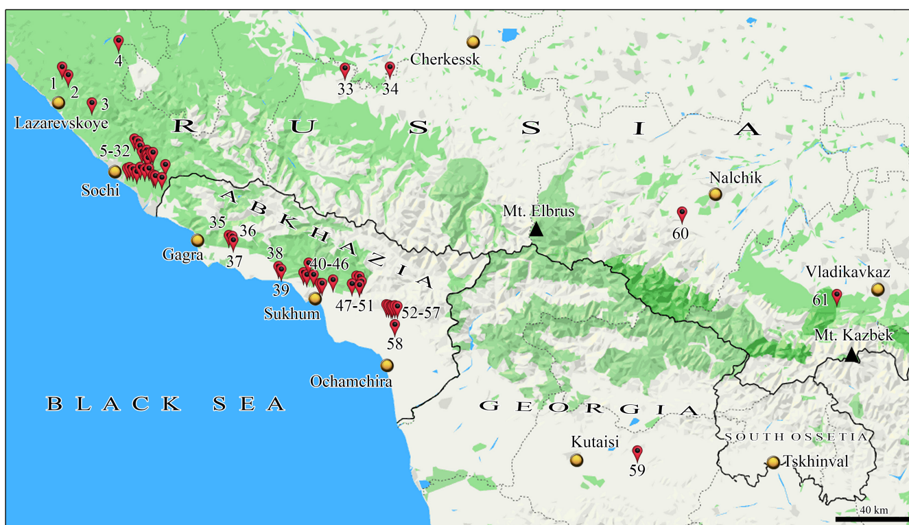
Fig. 1. The map of the study area with marked caves. Designations of the caves: 1 – Krasnoaleksandrovskaya, 2 – Kirovskaya, 3 – Lyagushachya, 4 – Kanyon, 5 – Atsinskaya, 6 – Gigantov, 7 – Osennaya, 8 – Nazarovskaya, 9 – Partizanskaya, 10 – Pauchka, 11 – Ametist, 12 – Eksperimentalnaya, 13 – Fyodorovskaya, 14 – Yurskaya, 15 – K-16, 16 – Vorontsovskaya, 17 – Labirintovaya, 18 – Kabanya, 19 – Dolgaya, 20 – Chyortova Nora, 21 – Akhunsкая, 22 – AKHN-6, 23 – Beloskalskaya, 24 – Bochka, 25 – Oblomnaya, 26 – Shirokopokosskaya, 27 – Kolokolnaya, 28 – Kievlyanka, 29 – Malaya Kazachebrodskaya, 30 – Bolshaya Kazachebrodskaya, 31 – Berezhnogo, 32 – Pechalnaya, 33 – nameless cave, 34 – Malaya Grina, 35 – Akshasha, 36 – Abshdza, 37 – Otkharskaya, 38 – Maanikvarskaya, 39 – Abkhazskikh Speleologov, 40 – Verkhneesherskaya, 41 – Adzaba, 42 – Andreevskaya, 43 – Mikhaylovskaya, 44 – Besletskaya I, 45 – Besletskaya II, 46 – Kelasurskaya, 47 – Tsebildinskaya, 48 – Verkhnyaya Shakuranskaya, 49 – Vodopadnaya, 50 – Kholodnaya, 51 – Dzhpalskaya I, 52 – Kotsha, 53 – Dzykhayskaya, 54 – Golova Otapa, 55 – Nad Golovoy Otapa, 56 – Samshitovaya, 57 – Marshania Verkhnyaya, 58 – Dzhalskaya I, 59 – Samchikiya, 60 – Omega-15 (= NSS-53), 61 – Nyvdzhin Lagat.

For each record, the horizontal distance and the vertical depth from the entrance of the cave are given. The condition of the animals and the peculiarities of their coloring were assessed. Animals were photographed. Some specimens were fixed in 96% ethanol and stored in Sochi National Park (SNP) collection.