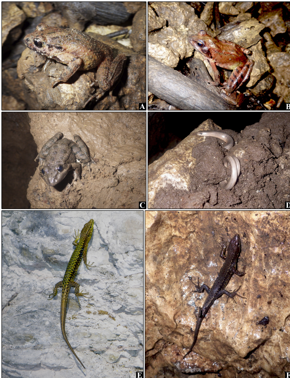
Fig. 3. Amphibians and reptiles in the Caucasian caves. Designations: A – Pelodytes caucasicus (Abkhazia, Marshania Verkhnyaya Cave) ; B – Rana macrocnemis (Abkhazia, Marshania Verkhnyaya Cave) ; C – Pelophylax ridibundus (Sochi National Park, Bochka Cave) ; D – Anguis colchica (Abkhazia, Abkhazskikh Speleologov Cave) ; E – Darevskia brauneri (Sochi National Park, Kolokolnaya Cave) ; F – Darevskia derjugini (Abkhazia, Marshania Verkhnyaya Cave).