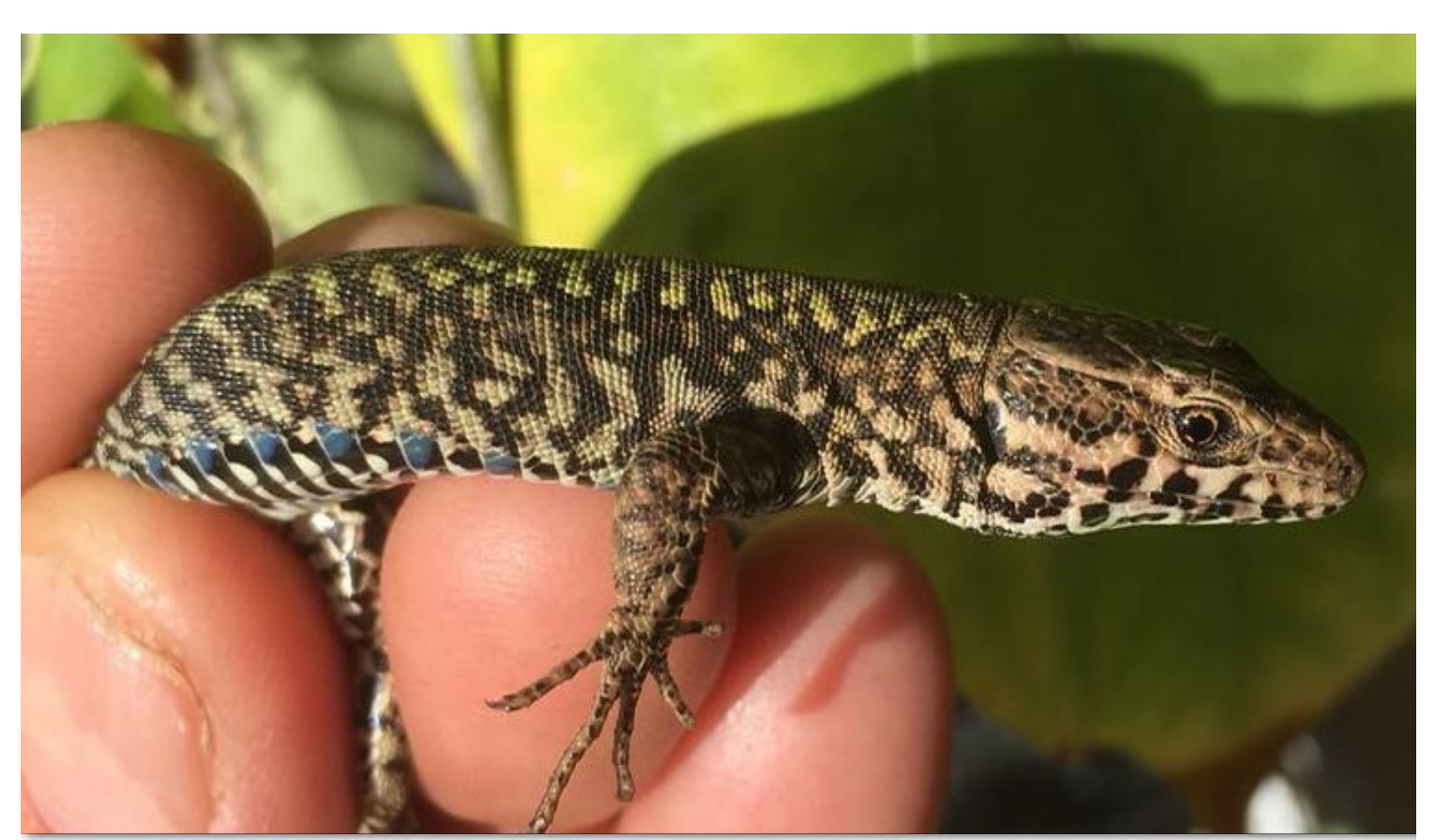
An adult common wall lizard captured in Victoria in 2018.

The wall lizard population is now far denser than that of the northern alligator lizard, which is native to Vancouver Island. HANKE indicates that where the two species live together, there is "one alligator lizard for every 30 or 40 wall lizards." When HANKE estimated 500,000 wall lizards in the region, he assumed 20 lizards, on the low end, in every garden