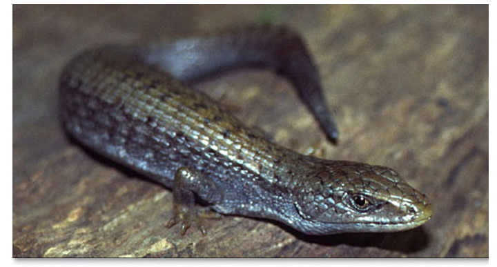
Northern alligator lizard Elgaria coerulea principis recorded at the Department of Biology / University of Victoria.

in Saanich and Victoria. As some citizen reports in central Saanich indicate thousands of lizards in their backyards, the actual number could be much higher.