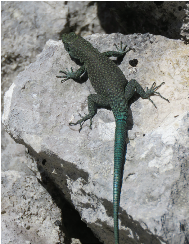
Figure 2. Sharp-snouted rock lizard ( Dalmatolacerta oxycephala ) from the Komarnica canyon.

characterized this species as highly specialized regarding habitat choice (Bejaković et al. 1996b). This suggests a lower potential for survival in non-optimal environmental conditions.