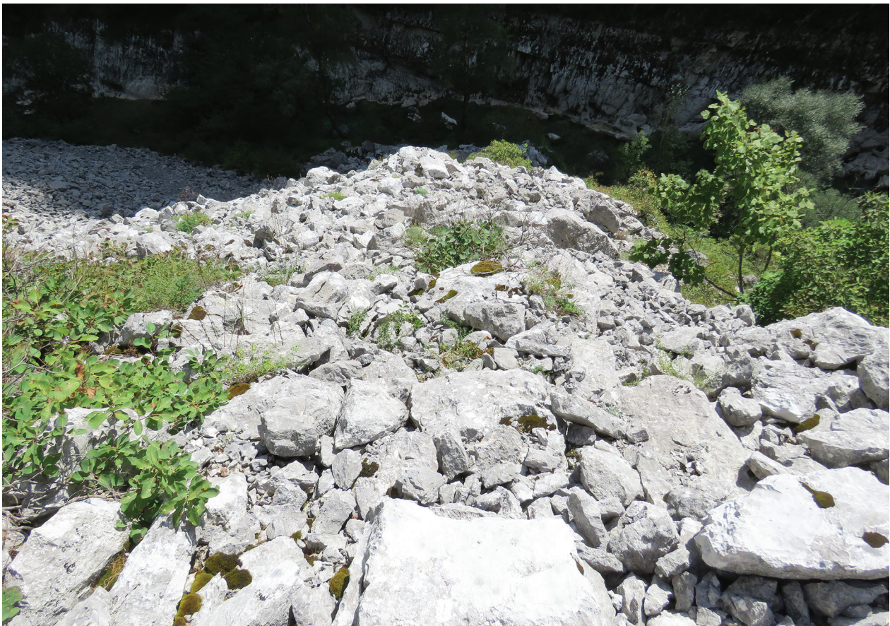
Figure 3. Microhabitat of the Sharp-snouted rock lizard ( Dalmatolacerta oxycephala ) in the middle part of the Komarnica canyon.

Ljubisavljević et al. (2018) mentioned that the rapid urbanization and the increase of touristic infrastructure is a general threat for local coastal populations of endemic lizard species in Montenegro, which includes D. oxycephala . We would add that there are similar challenges for the mainland populations of this species as well, particularly for refugial ones scattered in canyons, as it could be the case with this new recorded one in the mid-part of the Komarnica Canyon. An increase in anthropogenic activities that inevitably alter or destroy natural habitats in this part of the Eastern Mediterranean region would jeopardize the stability of local Sharp-snouted rock lizard populations, as well as other endemic, threatened, Natura 2000, or in some other aspect important wild species. According to Böhm et al. (2013), human-induced habitat loss is one of the predominant threats to reptiles, and the distribution and severity of those threats will shape the future fortune of reptiles. Careful and responsible planning of economic development in Northern Montenegro should support ecological tourism as an adequate solution for the increase of living standards, without harming the local wildlife populations by severe anthropogenic alterations of the landscape.