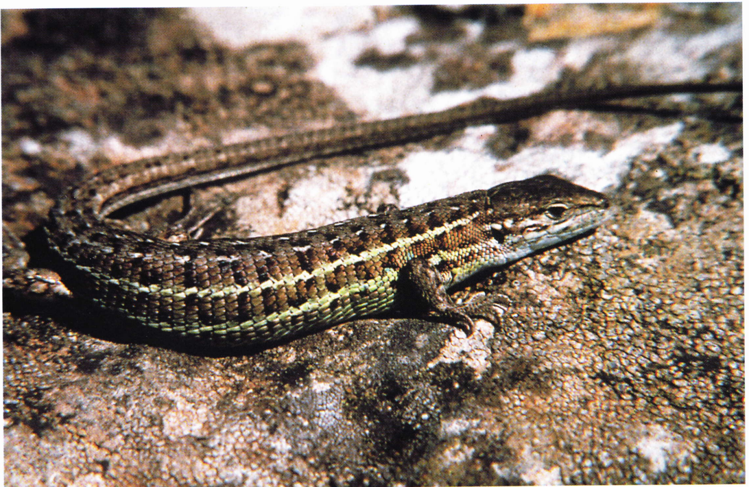
Fig. 206: Algarve. Photograph by P. NIEBERGALL.

Psammodromus hispanicus is by far more rare than P. algirus . This is not only obvious in the form of lower dispersal and population densities, but also by its comparatively very limited distribution pattern. The species is entirely absent from large parts of the Alentejo and northwest of a line, Leiria - Fátima karst - Rio Tejo, Rio Ocreza - Serra da Estrela - Serra da Lapa - Rio Tua. From the whole of the northwestern Portuguese region only unconfirmed and questionable historical records exist that could not be substantiated ever since, examples being 'Chaves' (FERREIRA 1895a), 'Serra de Mourela - Pitões (Montalegre)' (NOBRE 1903), 'Coimbra' (VIEIRA 1887). Populations with larger numbers of individuals occur in karst areas (e.g. central Algarve Barrocal, Sagres and Arrábida Peninsulas, Serra de Santo António, Serra de Aire), granitic rock castle landscapes (e.g. Gavião - Serra de São Mamede; eastern and central Beira Baixa; northwest of Almeida between Rio Côa and Rio Tourões), and on dune sands.