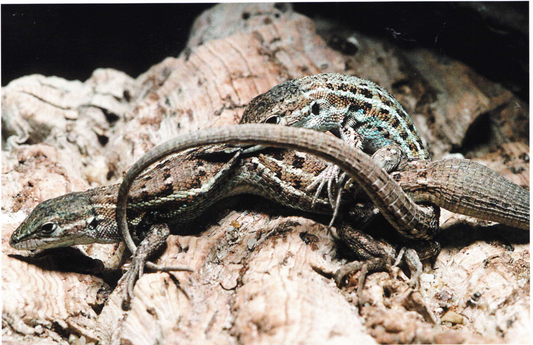
Fig. 207: Copulation; near Comporta, west of Alcácer do Sal.

Psammodromus hispanicus lives in open, plain or weakly to moderately inclined country with scattered bush and dwarf shrub vegetation (vegetation cover usually < 60%), a high degree of sun-exposure, with a variety of substrates: sand (coastal and inland dunes), firm ground (partly covered with rock debris, and partly a scant overgrowth of grasses and stunted forms of Mediterranean shrubs like those commonly found on the shallow skeleton soils of karst regions), as well as rocky areas (especially granite lapas) with a sparse vegetation in grooves within meadows speckled with Genista-Halimium-Lavandula heaths. Habitats of these types are found in the littoral on dunes, beside trails through Pinus woods, on the slopes of gorges, on plain levels of graduated cliff rises, and in garrigues behind the upper edge of cliffs, and show a scattered vegetation cover dis-