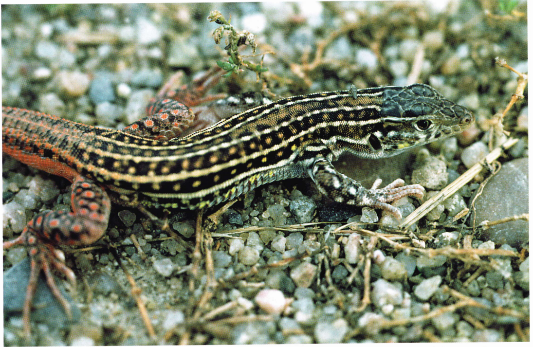
Fig. 165: Rib. de Cordeira valley, near Figueira de Castelo Rodrigo.