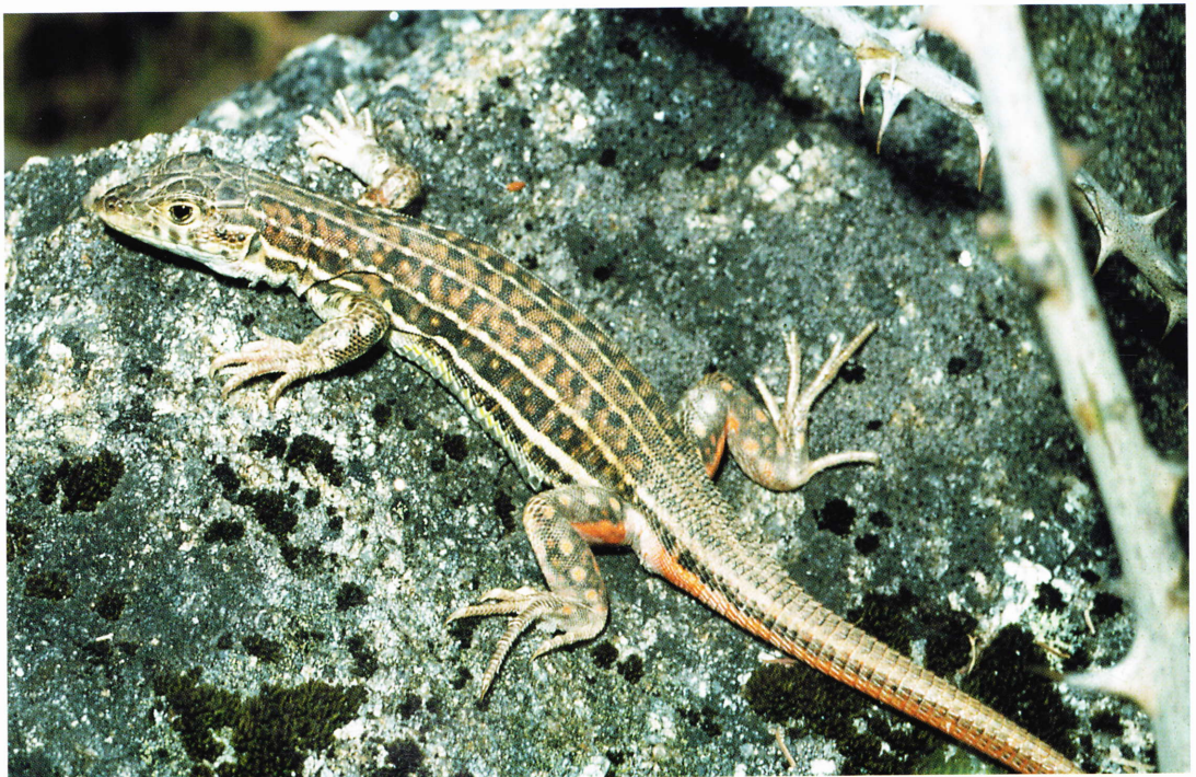
Fig. 164: Near Campelhos, Carrezeda de Ansiães region. Photograph by M. SCHROTH.

- A large area with partly dense populations extends as a band of 20 to 30 km in width along the Portuguese-Spanish border from Idanha-a-Velha to Torre de Moncorvo, including the surrounds of Carrezeda de Ansiães and reaching Rebordelo via Valpaços (here particularly on the western slopes of the Rio Rabaçal valley at Barreiros). Possibly