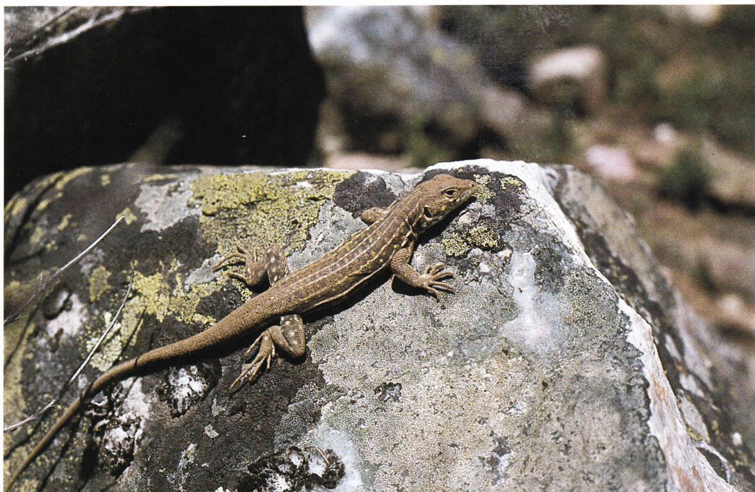
Fig. 166 a: southern slopes of Marvão (PN de Serra de São Mamede).