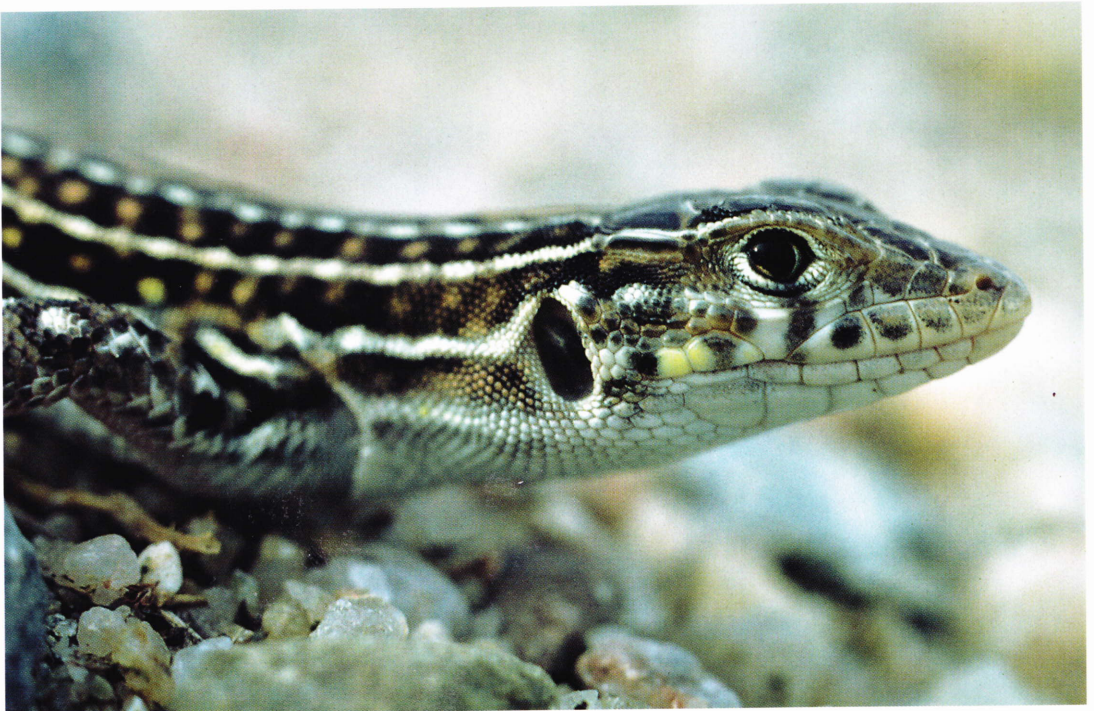
Fig. 166: Portrait; Cordeira valley.