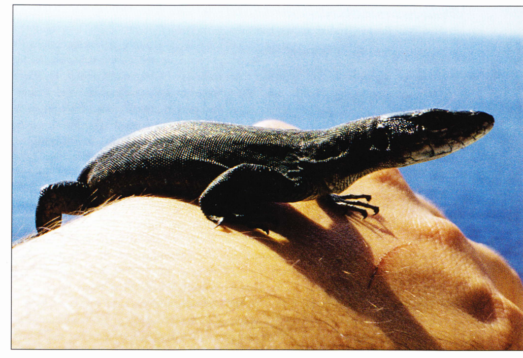
Fig. 68: Podarcis raffonei, 3, from Strombolicchio Islet.