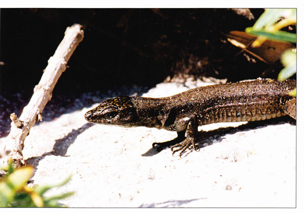
Fig. 67: Podarcis raffonei, &, from Strombolicchio Islet.