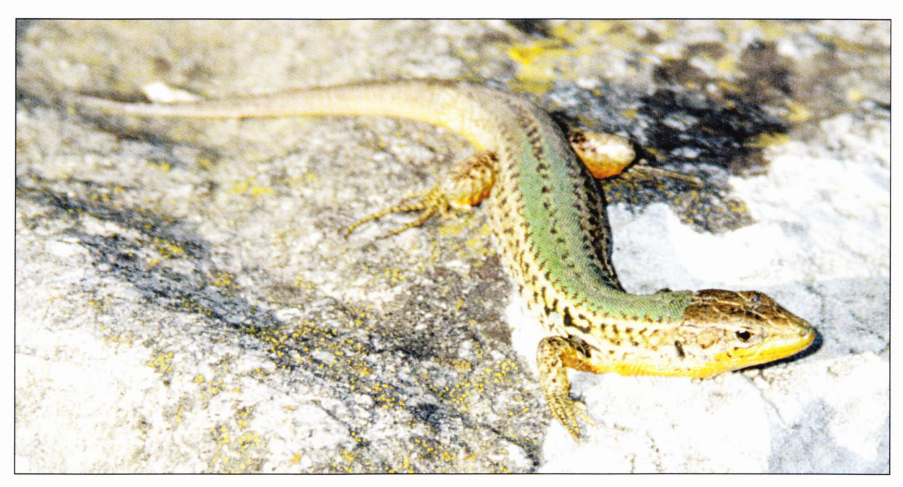
Fig. 59: Podarcis melisellensis, Cres Island, Croatia.