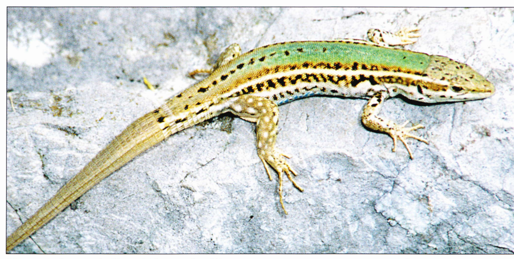
Fig. 58: Podarcis melisellensis, Val Rosandra, Trieste.