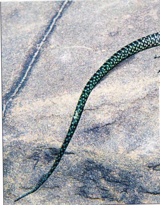
Fig. 39 (top): Archaeolacerta bedriagae , juvenile, Limbara Mountains, Sardinia.