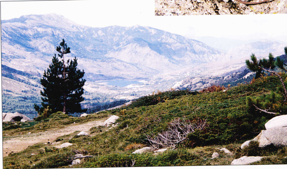
Fig. 41: Montane habitat of A. bedriagae + P. tiliguerta , Col de Verghiu, Corsica, France. C. CORTI