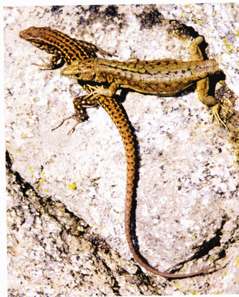
Fig. 40 (middle): A. bedriagae in syntopy with Podarcis tiliguerta , Col de Verghiu, Corsica, France. C. CORTI