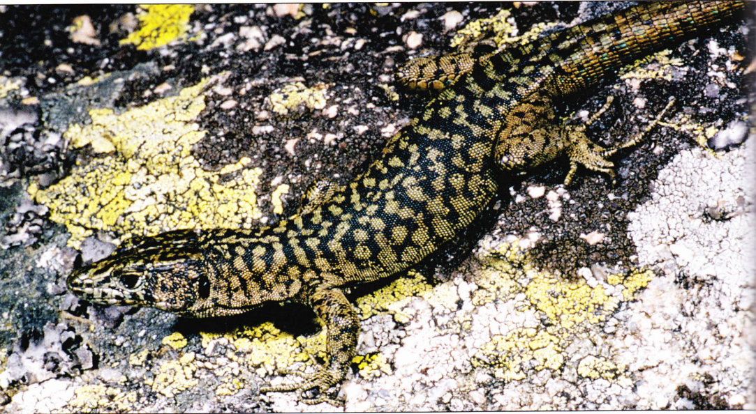
Fig. 37: Archaeolacerta bedriagae , Bocca d'Illarata, Corsica, France.