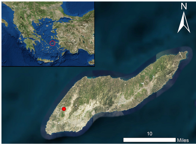
Fig. 1. Google Earth® map of Ikaria showing the location of the study site (red dot).

( Mauremys caspica ) is listed as the only protected reptile species. This is particularly perplexing as M. rivulata is the only terrapin species found on the island and the two species are generally considered to be parapatric (Broggi 2012).