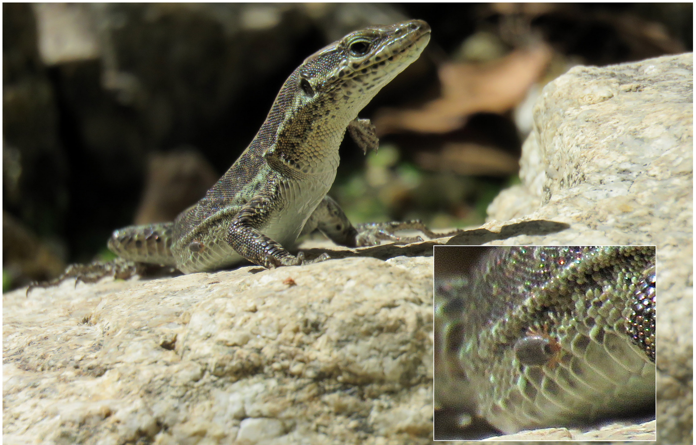
Fig. 3. A tick on an Oertzen's Rock Lizard's ( Anatololacerta oertzeni ) flank clearly shows four pairs of legs, indicating that the tick is either a nymph or an adult.

ity of a number of species (Estrada-Peña et al. 2018). The ticks probably are in the genus Dermacentor , Hyalomma , or Ixodes and might represent more than one species or life stage. Ruminants (goats and sheep) are abundant in the area and might facilitate dispersal (e.g., Chaligiannis et al. 2016; Dimanopoulou et al. 2017).