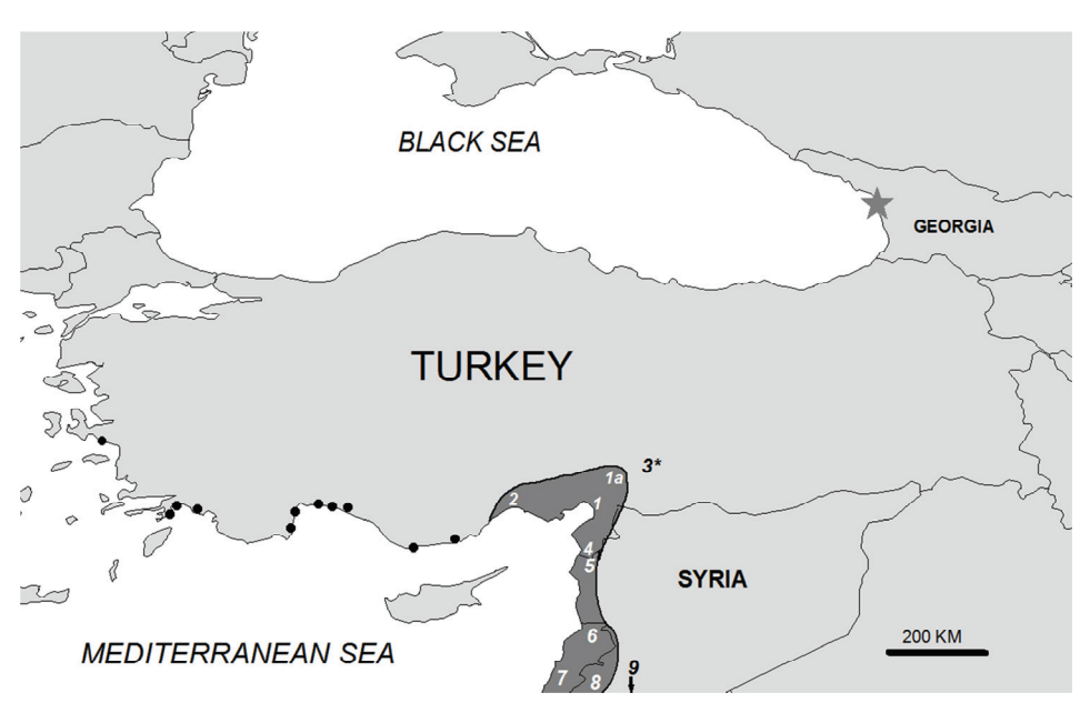
Figure 1. Distribution map of P. laevis (after Crochet et al., 2009; Karış & Göçmen, 2014; Ilgaz et al., 2016; this paper). Numbers on the map indicate locations of the specimens whose sequences deposited to GenBank were used in this paper (see Figure 2). 3* - location of P. cyanisparsa whose sequence was used in the analysis. The star shows new location of P. laevis in Anaklia, Georgian Black Sea coast.

according to the manufacturer's instructions (Qiagen, 2007). A cyt b fragment (693 bp) was amplified using primer pairs H15915-L15369 and H15488-L15153 (Fu, Murphy, & Darevsky, 1997; Murphy et al., 2000). PCR conditions are described in Gabelaia, Tarkhnishvili, and Murtskhvaladze (2015). The amplicons were sequenced on an ABI 3130 capillary sequencer. Single-stranded sequencing was performed with PCR primers, using Big-Dye v3.1. PCR fragments were sequenced in both directions to assure sequence accuracy. mtDNA sequences were edited using SEQSCAPE 2.5 (Applied Biosystems Inc., Foster City, CA, USA) and compared with the extant sequences using BLAST (Altschul, Gish, Miller, Myers, & Lipman, 1990). After finding the closest sequences from Genbank ( Phoenicolacerta laevis ), the sequences were aligned along with this and the other sequences of Phoenicolacerta spp . The latter were downloaded from the Gen-Bank (Table 1). The Neighbor-Joining tree was built using MEGA v7 (Kumar, Stecher & Tamura, 2016). Because all three novel sequences were identical, only one has been deposited to Gen-Bank (Accession Number MF438266).