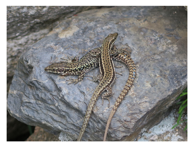
Fig. 2 An adult male ( below ) and an adult female ( above ) of Podarcis muralis sharing time and space in the field

To avoid pseudoreplication, counts were made in independent line transects covering several localities (i.e. a single