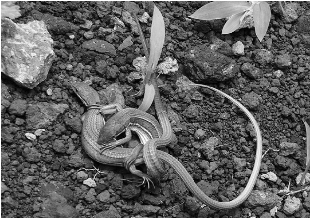
Figure 2. A photograph of the male Takydromus wolteri biting the flank of the female during the mating (Chang, 2011)

TL was generally found in SSD of lacertid lizards, and it was also the case with three of lacertid lizards of Korea. In Phrynocephalus vlangalii , males showed a tail growth rate higher than females, which is partly related with fecundity selection acting on female (Zhang et al. , 2005). The role of tail of male is very important because male widely move to meet superior female and constantly seek for prey owing to strong, and therefore tail of male is getting longer than female through an evolutionary process.