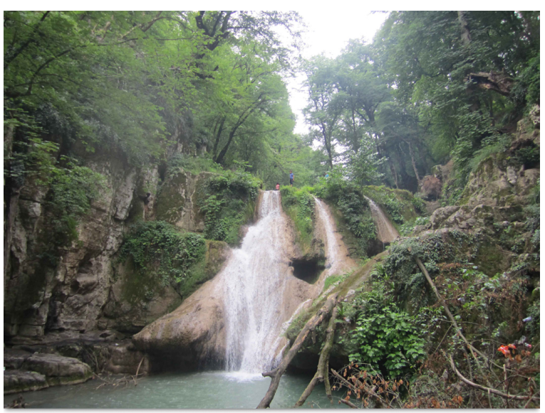
Figure 1. Type locality of Darevskia steineri at Loveh waterfall, near Minoudasht, Golestan province, Iran. The locality is one of the tourism regions in the north of Iran.

During extensive field work in Golestan province, on 15 August 2011, four specimens of Darevskia steineri were observed at the type locality (N 37° 20' 53"; E 55° 40' 28"; 655 m), Loveh Waterfall, which is located among dense forests in Minoudasht and Golestan Natural Park in the east of Golestan province (RASTEGAR-POUYANI et al. in print ). In addition we surveyed the area from the Golestan Natural Park to the vicinity of the city of Gorgan but no further specimens of D. steineri were detected. According to ANDERSON (1999) two other species of the genus Darevskia are distributed in this area: Darevskia chlorogaster and Darevskia defilippii. But we were only able to observe Darevskia chlorogaster. The Crotalidae Gloydius halys was found sympatric with Darevskia steineri and inhabited the forest floor while the lizards lived in the vicinity of the waterfall.