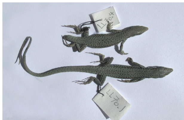
Figure 2 Dorsal view of male holotype (RUZM- LL70.1) and female paratype (RUZMLL70.4) of Darevskia raddei chaldoranensis ssp. nov.

number: RUZM- LL70.1) collected by the authors on 07 June 2007 from the Chaldoran area (39° 03' N, 44° 22' E) in the northern regions of west Azerbaijan Province, Iran.