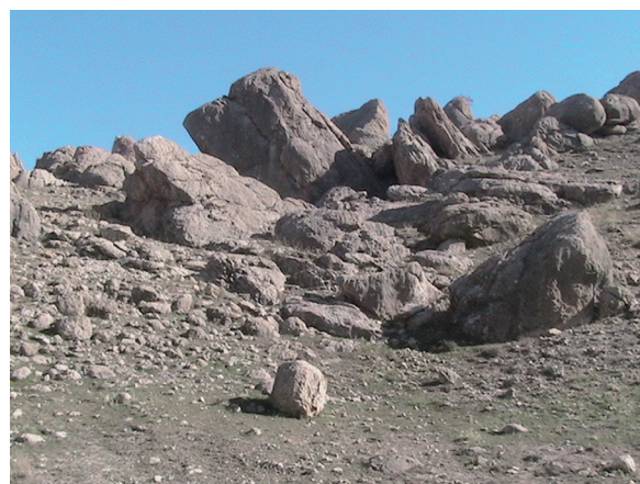
Figure 4 Habitat and type locality of Darevskia raddei chaldoranensis ssp. nov.

Etymology: Darevskia r. chaldoranensis is so named as it was collected for the first time from vicinity of Chaldoran in the west Azerbaijan Province, Iran.