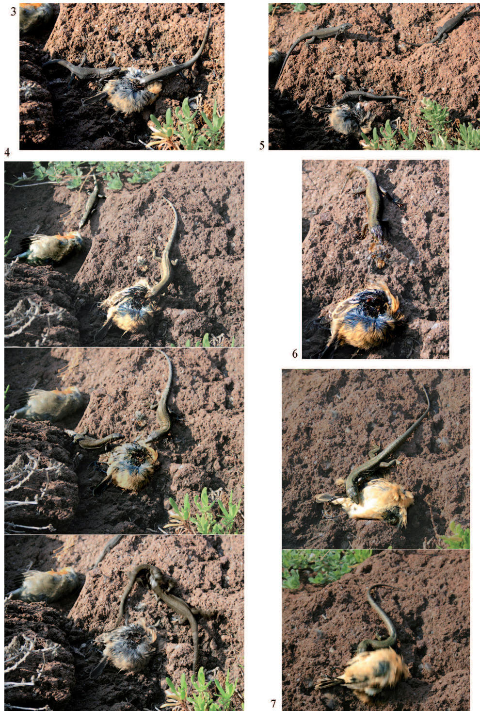
Figure 3. Two Podarcis raffonei on the carcass of a Common Stonechat preyed by Eleonora's Falcon; Scoglio Faraglione Islet, Aeolian Archipelago, October 2011 (photo P. Lo Cascio). Figure 4. Intraspecific interactions between two specimens of Podarcis raffonei : above, the first lizard feeds on the carcass of a stonechat while the second (top left) approaching that of a robin; in the middle, the second has neglected the robin and approaches the other one, even if already occupied by the first lizard; below, the first attacks the second, showing a territorial behaviour. Figure 5. Another territorial behaviour: a male (top left) and a female basking near the stonechat's remains while another female is feeding on the carcass. Figure 6. A male eats a feather; to better perform the swallowing, the lizard repeatedly rubs its snout on the rocky soil. Figure 7. During the consumption, the prey is dragged from its original location by a lizard.