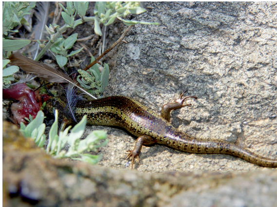
Figure 2. Chalcides ocellatus feeds on remains of passerine in a falcon's nest; Gallo Islet, Galita Archipelago, September 2001 (photo R. Ouni).

This foraging activity took place exclusively on ripped preys; only in one case, not directly related to interactions with falcons and observed at La Fauchelle, a skink has attempted to extract a dead but intact nestling from a nest of warblers.