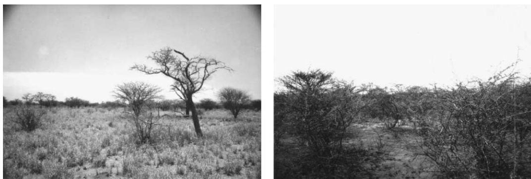
Fig. 1. Representative photographs of savanna (Plot 2; left) and bush-encroached (Plot 5; right) habitats demonstrating differences in vegetation in our study. In the savanna photograph, the largest tree in the foreground is Acacia erioloba , the two smaller trees behind, and to either side of it, are A. mellifera . The trees in the bush-encroached plot are predominantly Dichrostachys cinerea .

Compared to open savanna plots, bush-encroached plots were visually different (Fig. 1; Table 1). Bush-encroached plots were characterized by having a different assemblage of woody plant species (Table 2), greater density of woody plants ( x = 309/\text{ha} vs. 217/\text{ha} ), greater degree of canopy cover, greater amount of downed wood, and lesser amount of perennial grass cover. Bush-encroached plots also differed strikingly from open savanna plots in that there was increased homogeneity in the spatial extent of woody plant cover.