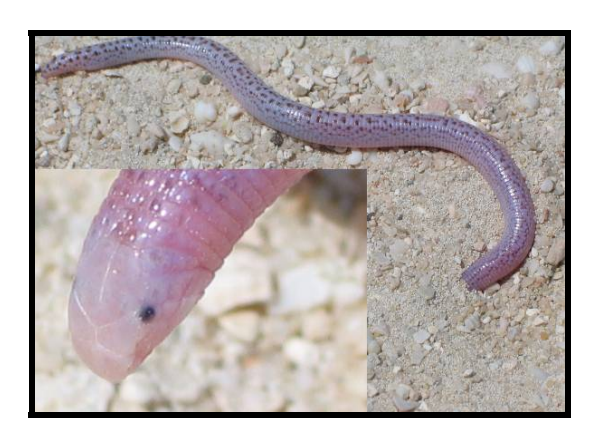
FIGURE 2. Zarudny's Worm Lizard, Diplometon zarudnyi showing a close-up of the head.

Nine sea snake species in the family Hydrophiidae are known to occur in the waters of the Arabian Gulf and the Gulf of Oman (Baldwin and Gardner 2005; Al Abdessalaam 2007). In Abu Dhabi Emirate, an opportunistic survey conducted between 2002 and 2006 recorded three main species; the Arabian Gulf Sea Snake (Hydrophis lapemoides), the Short Sea Snake (Lapemis curtus), and the Yellow-bellied Sea Snake (Pelamis platurus; Soorae et al. 2006).