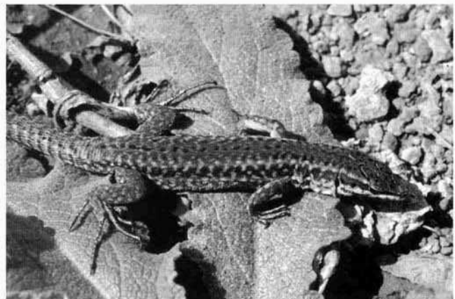
Fig. 1 - Podarcis raffonei antonnoi from Vulcano Island.

The conservation status of the Aeolian wall lizard, Podarcis raffonei (Mertens, 1952), has recently received attention because it is likely threatened with extinction (Capula et al. , 2002). P. raffonei is an endangered lacertid lizard, endemic to the Aeolian Islands (north-east of Sicily, Tyrrhenian Sea) (Fig. 1). The Aeolian Islands constitute a case of volcanism produced by rifting. This archipelago is made up of seven large islands ( \geq 338 ha) and several islets (each < 29 ha) and is separated from the closest coast of Sicily by a distance of 22 km ( \pm 500 m) and by a sea channel 500-600 m deep. Podarcis raffonei is genetically and morphologically related to P. wagleriana Gistel (1868) - a lizard endemic to Sicily, the Egadi Islands and the Stagnone Islands - and its full specific status has only recently been recognised (Capula, 1994a). The Aeolian Islands are also inhabited by the Italian wall lizard, P. sicula (Rafinesque, 1810). The Italian wall lizard occurs on all large islands as well as on some islets of the Aeolian Archipelago (Capula, 1992, 1993, 1994a; Corti et al. , 1997; Corti & Lo Cascio, 1999), while P. raffonei is currently confined to one large island (Vulcano, 2120 ha), where it occurs sympatrically with P. sicula , and to three small islands (Scoglio Faraglione, 0.5 ha, 0.3 km west of Salina; La Canna, 1 ha, 1.5 km west of Filicudi; Strombolicchio, 0.19 ha, 1.6 km north-east of Stromboli), where it is the only extant