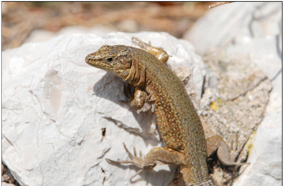
Lilford's Wall Lizards Podarcis lilfordi giglioli