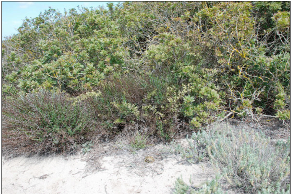
Hermann's Tortoise Testudo hermanni