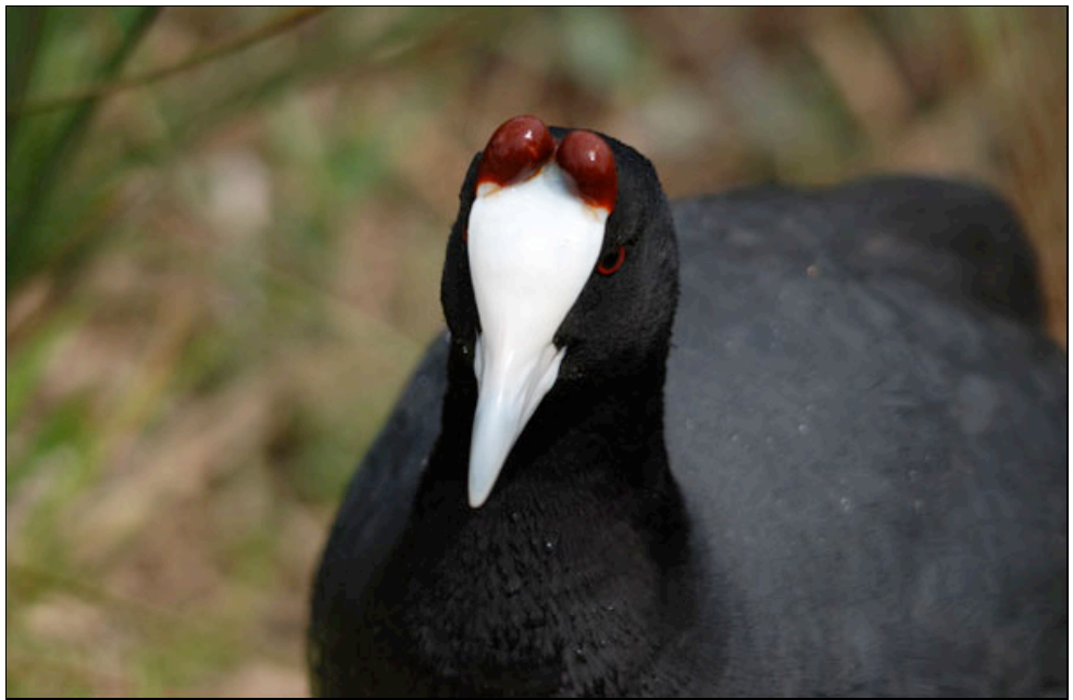
Red Knobbed Coot Red Knobbed Coot Fulica cristata