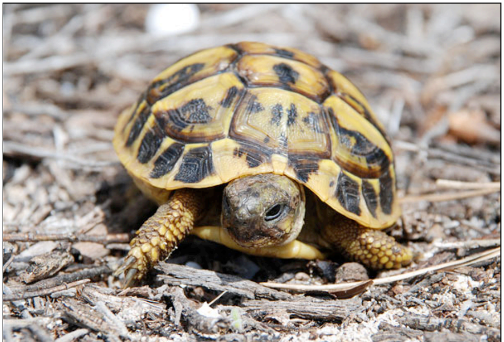
Hermann's Tortoise Testudo hermanni