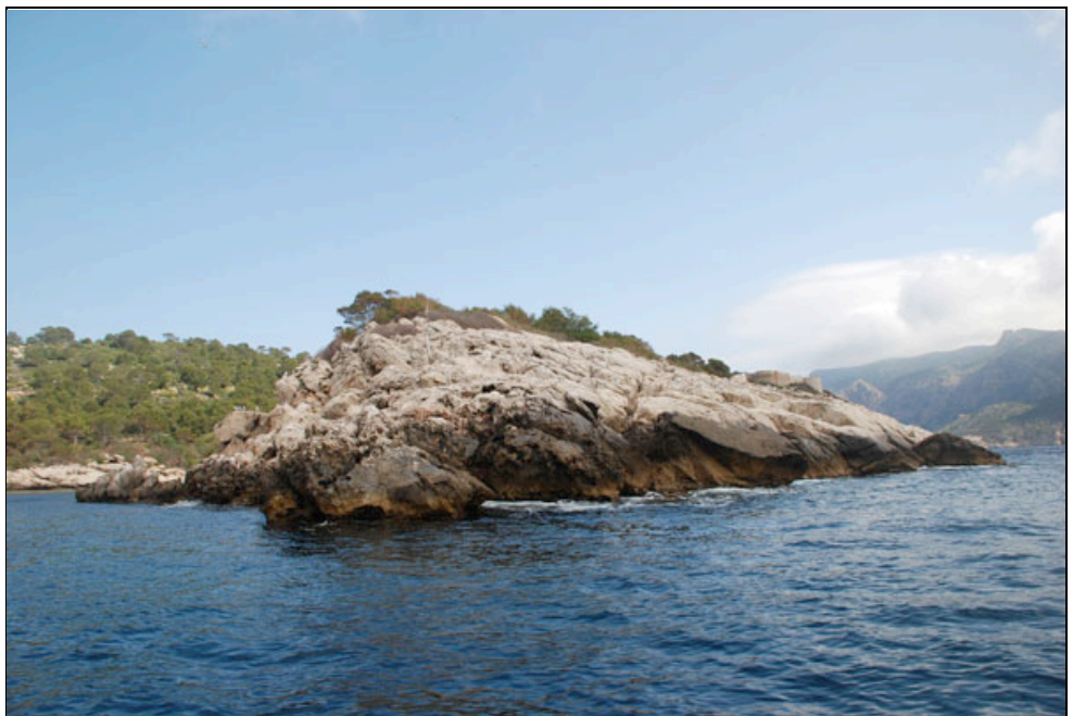
Photo11 Approach to Dragonera