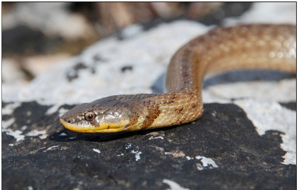
False Smooth Snake Macroprotodon cucullatus