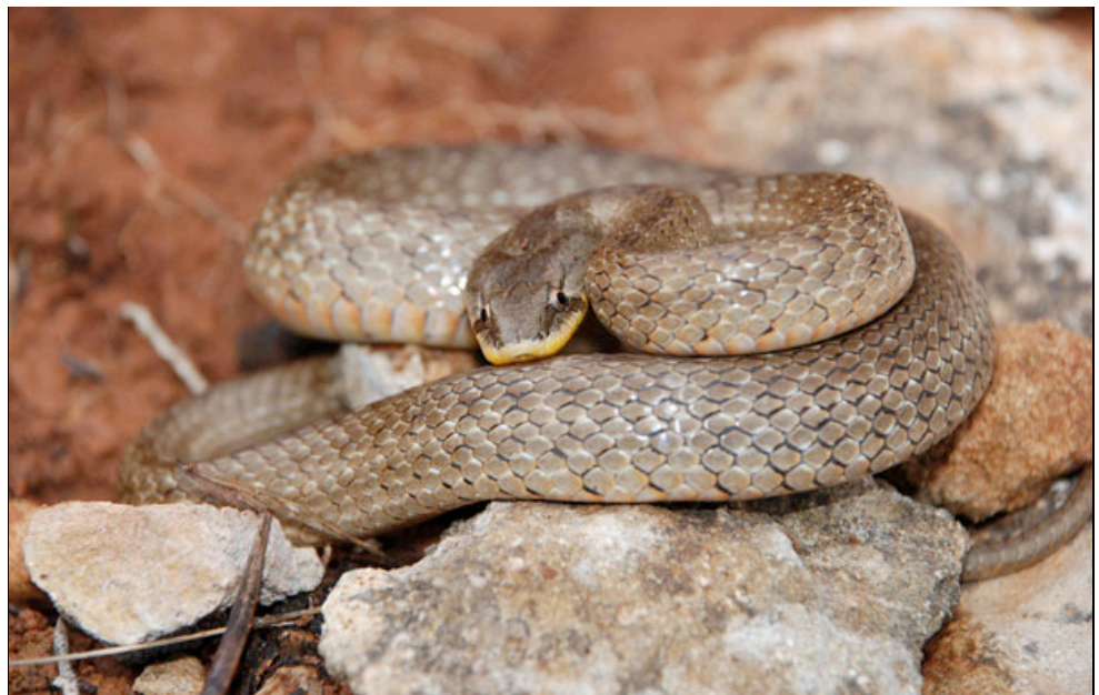
False Smooth Snake Macroprotodon cucullatus