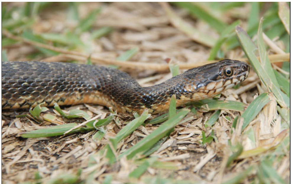
Viperine Snake Natrix maura