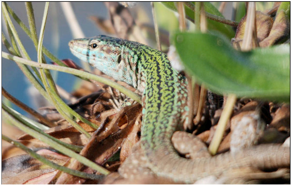
Ibiza Wall Lizard Podarcis pityusensis