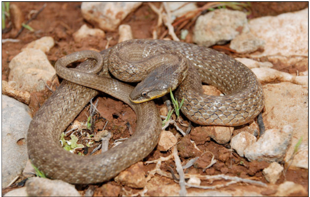
False Smooth Snake Macroprotodon cucullatus