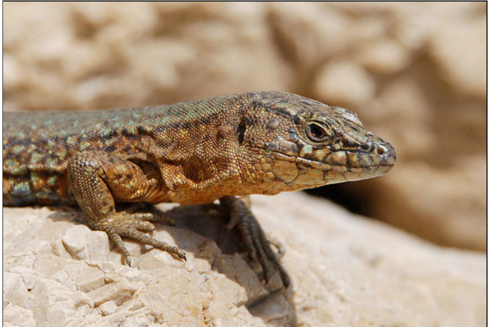
Lilford's Wall Lizards Podarcis lilfordi giglioli