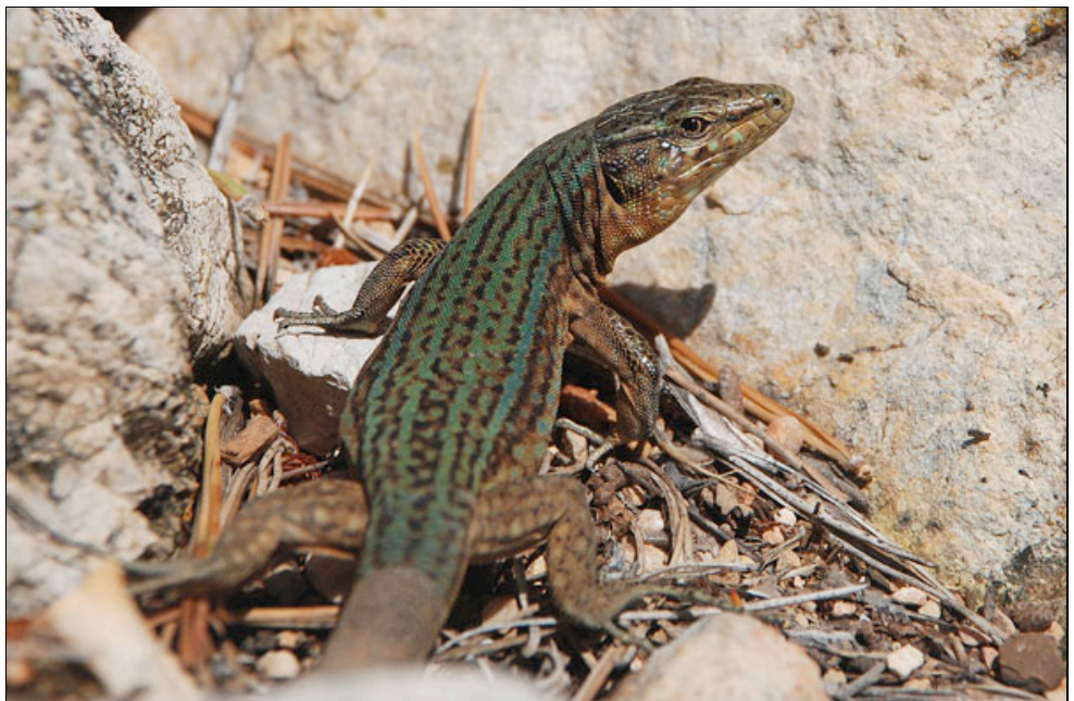
Lilford's Wall Lizards Podarcis lilfordi giglioli