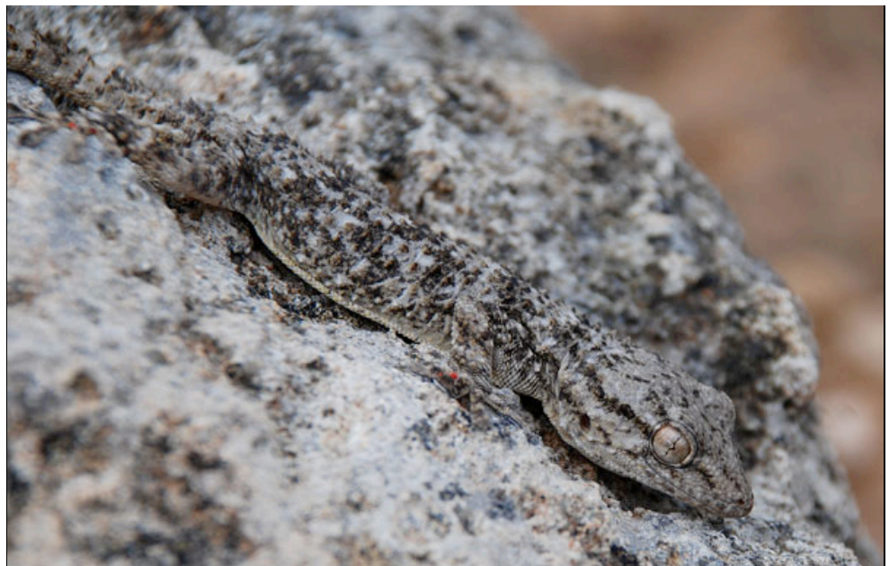
Moorish Gecko Tarentola mauritanica