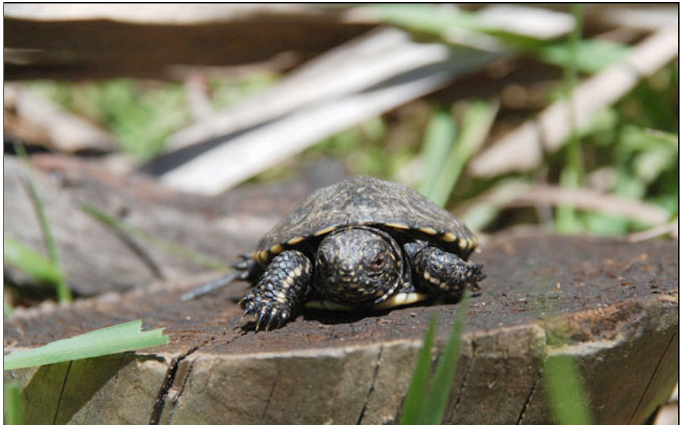
European Pond Terrapin Emys orbicularis