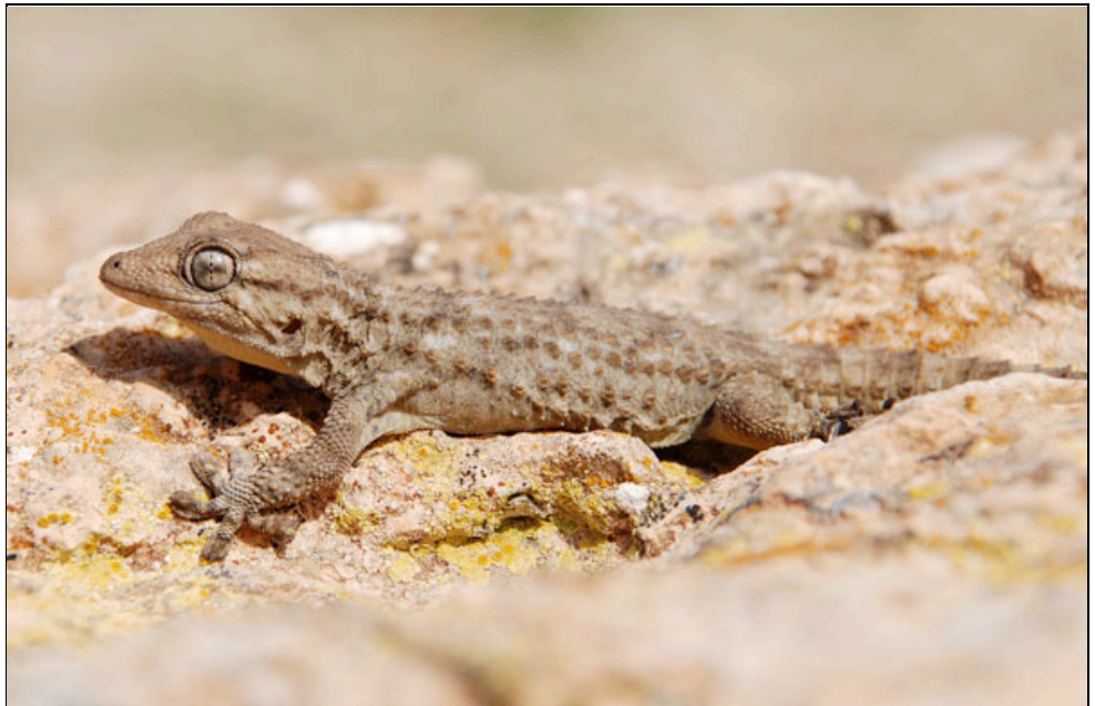
Moorish Gecko Tarentola mauritanica