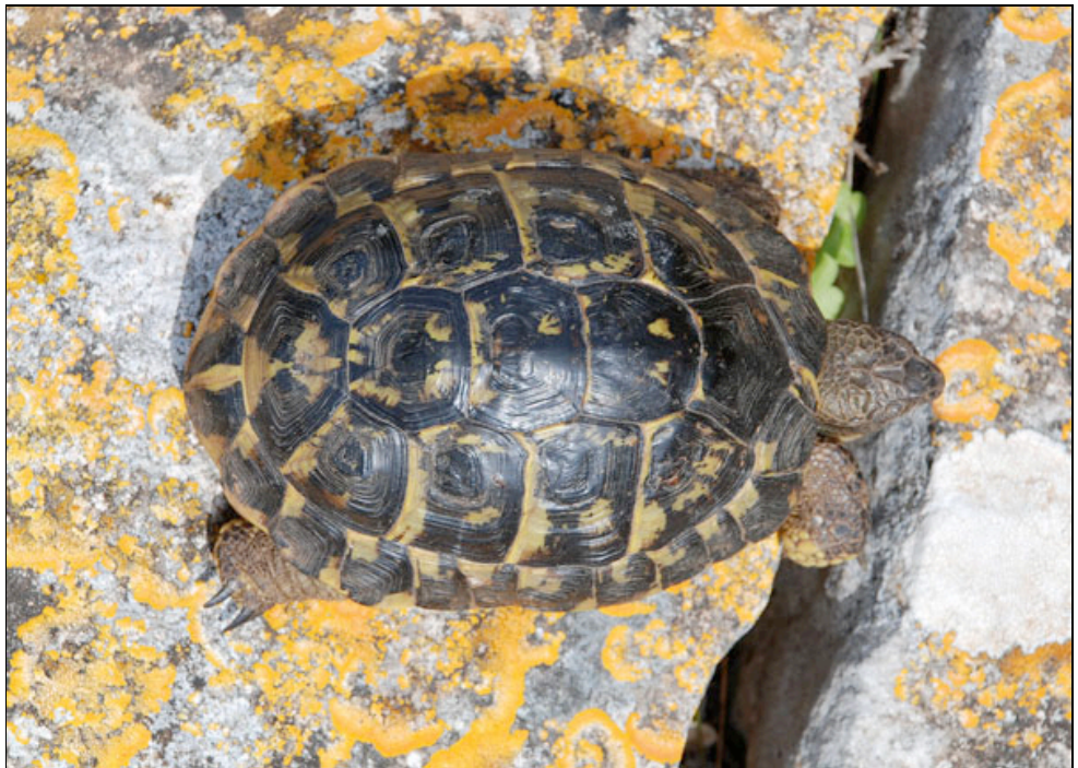
Hermann's Tortoise Testudo hermanni 2nd individual