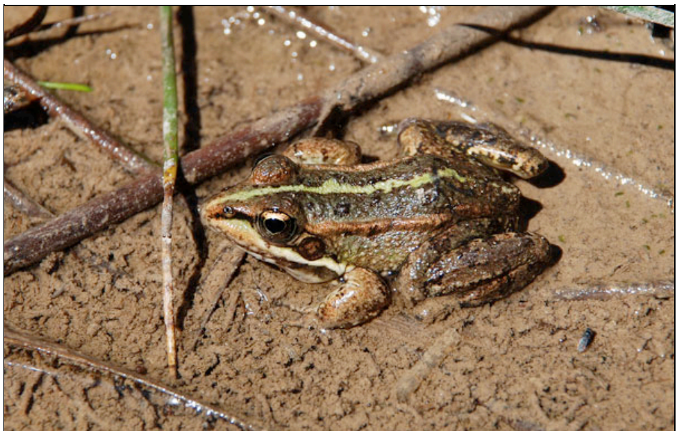
Iberian water frogs Rana perezi