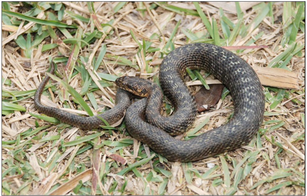
Viperine Snake Natrix maura