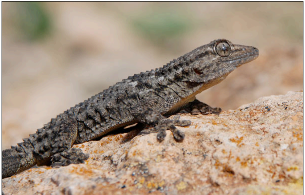
Moorish Gecko Tarentola mauritanica