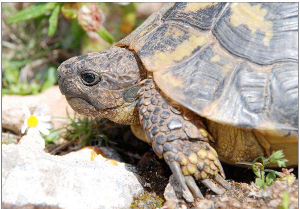
Hermann's Tortoise Testudo hermanni