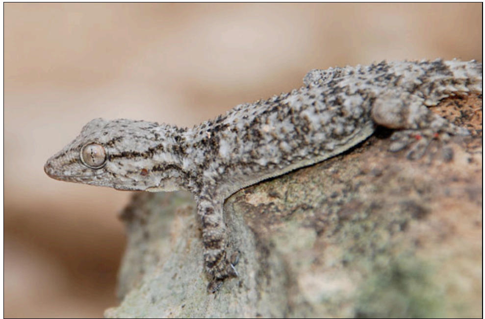
Moorish Gecko Tarentola mauritanica