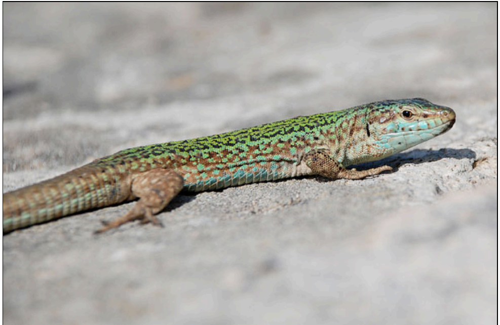
Ibiza Wall Lizard Podarcis pityusensis