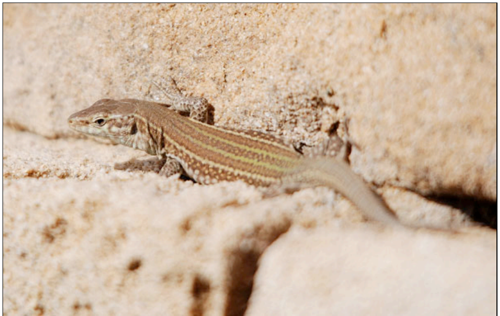
Ibiza Wall Lizard Podarcis pityusensis