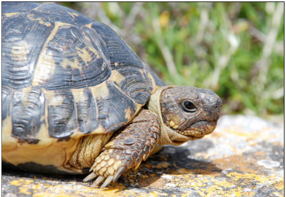
Hermann's Tortoise Testudo hermanni 2nd individual