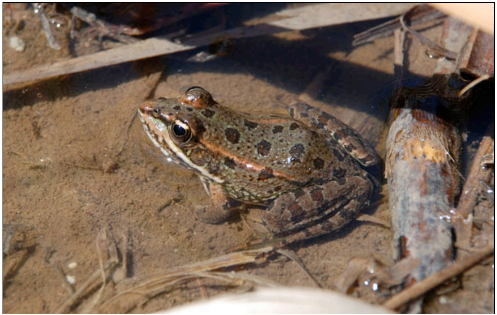
Iberian water frogs Rana perezi