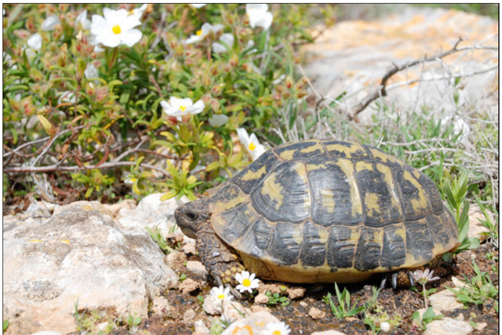
Hermann's Tortoise Testudo hermanni