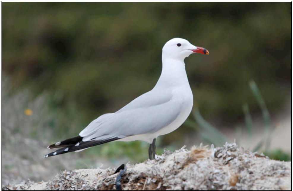
Audouin's Gull Larus audouinii

We took it steady for the next couple of days going down to the beach. No new herps were added. I did see Audouin's Gull Larus audouinii which is apparently one of the world's rarest gulls and a Majorcan specialty.