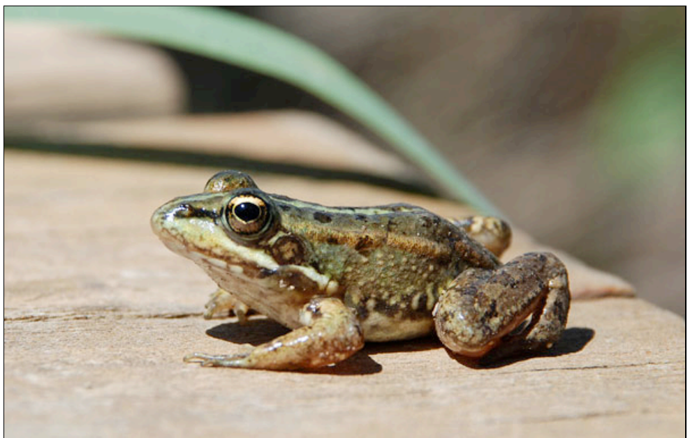
Iberian water frogs Rana perezi