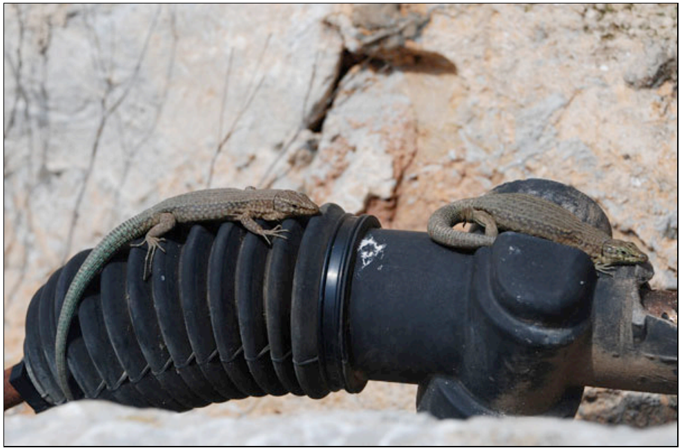
Lilford's Wall Lizards Podarcis lilfordi giglioli