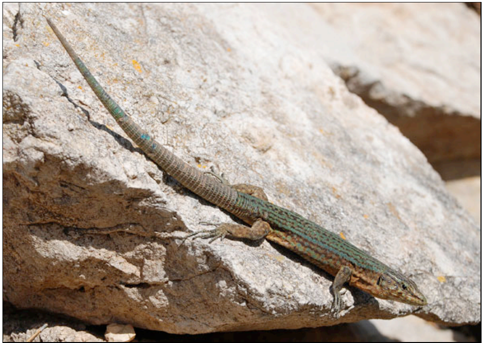
Lilford's Wall Lizards Podarcis lilfordi giglioli