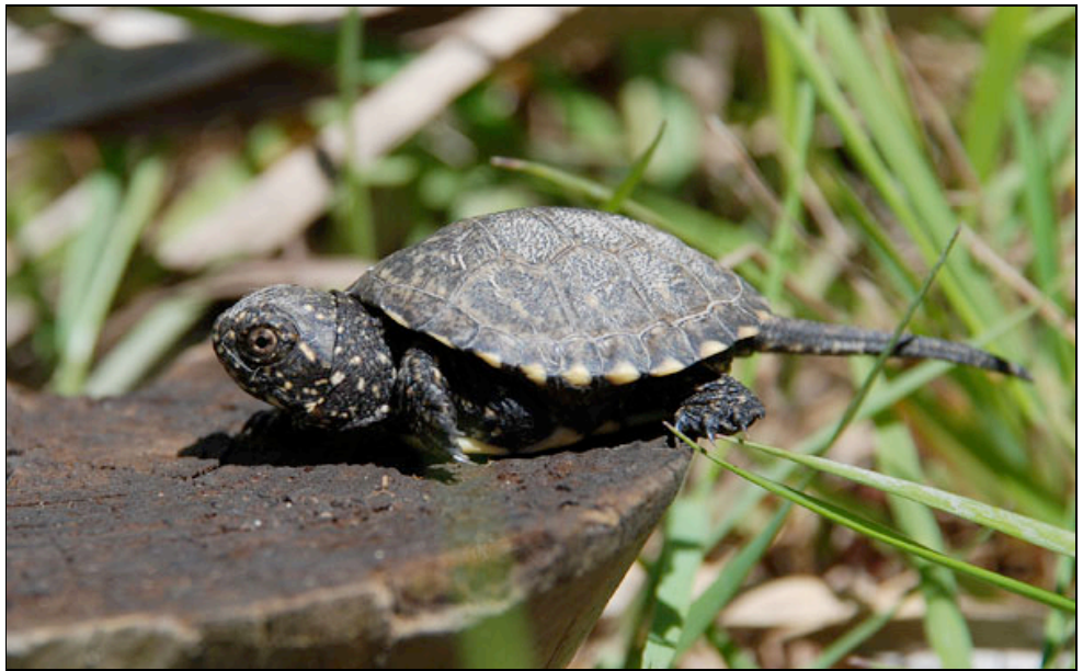
European Pond Terrapin Emys orbicularis