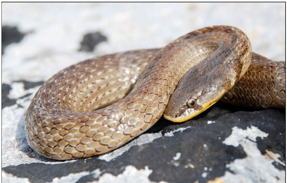
False Smooth Snake Macroprotodon cucullatus