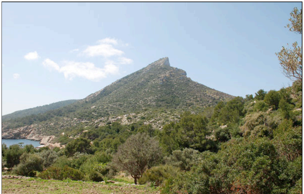
Habitat on Dragonera