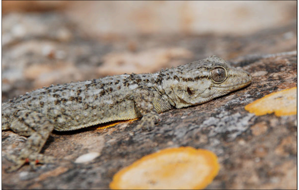
Moorish Gecko Tarentola mauritanica

We set off around the coast towards Cala dor. It was another sunny day with a little cloud. Having looked on Google Earth I had identified an area en-route where there might be some Hermann's Tortoise Testudo hermanni . We started by turning a few stones and found lots of Moorish Gecko Tarentola mauritanica of various shades and patterns. I then found the first of two tortoises close to the bottom of scrub. Driving to the hotel via the Mondrago national park, lots of birds were seen and were in song, including Sardinian Warblers, Serins and lots of Larks (Thekla?).