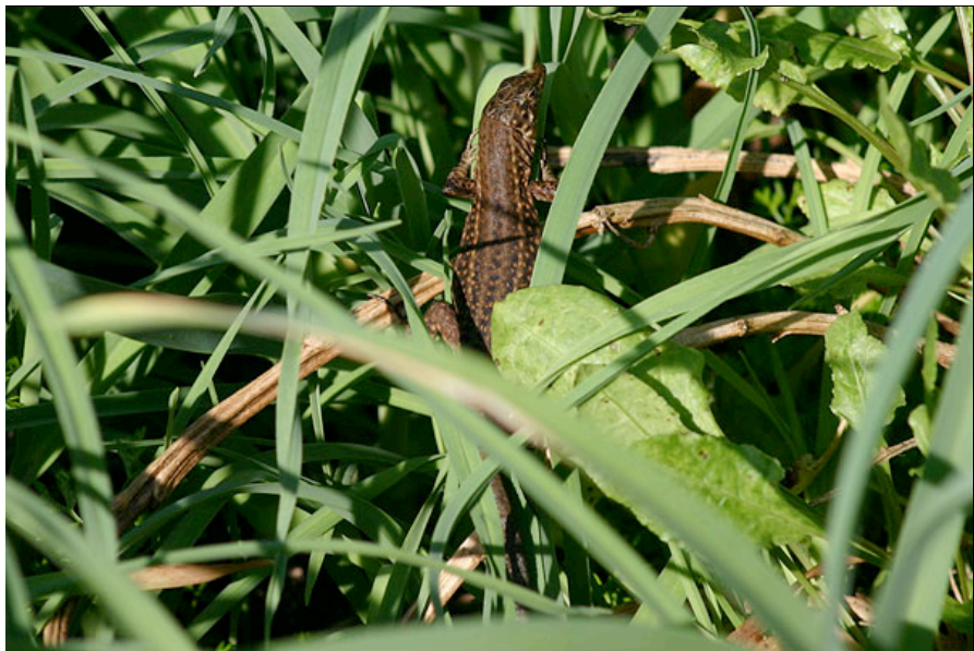
Female Podarcis lilfordi codrellensis (Escull de Binicodrell Gros 24-10-2008)