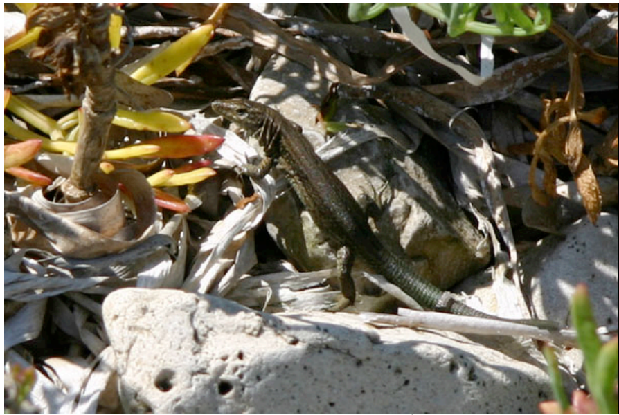
Juvenile Podarcis lilfordi carbonerae (Illot d'en Carbó 24-04-2008)