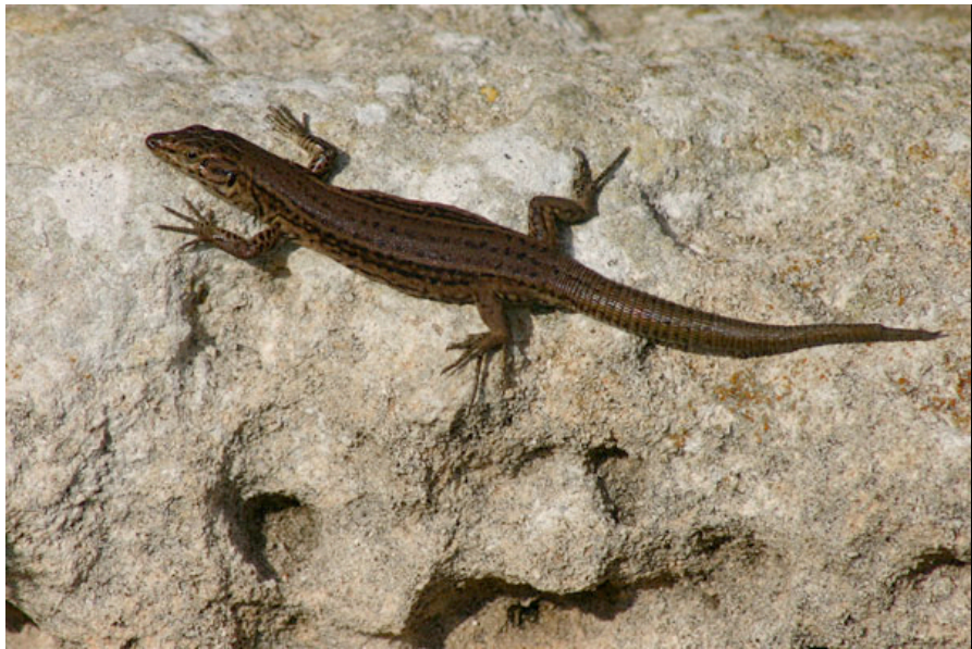
Female Podarcis lilfordi sargentanae (Illa Sargantana 21-10-2008)