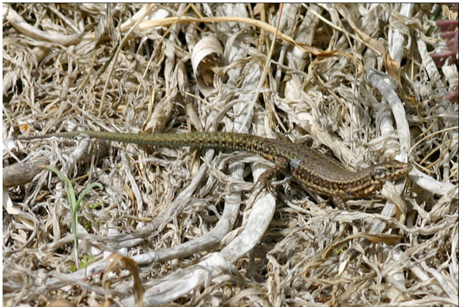
Female Podarcis lilfordi codrellensis (Escull de Binicodrell Gros 21-04-2008)