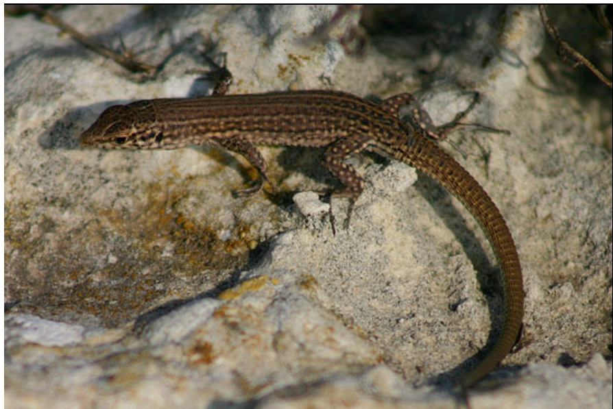
Juvenile Podarcis lilfordi codrellensis (Escull de Binicodrell Petit 24-10-2008)