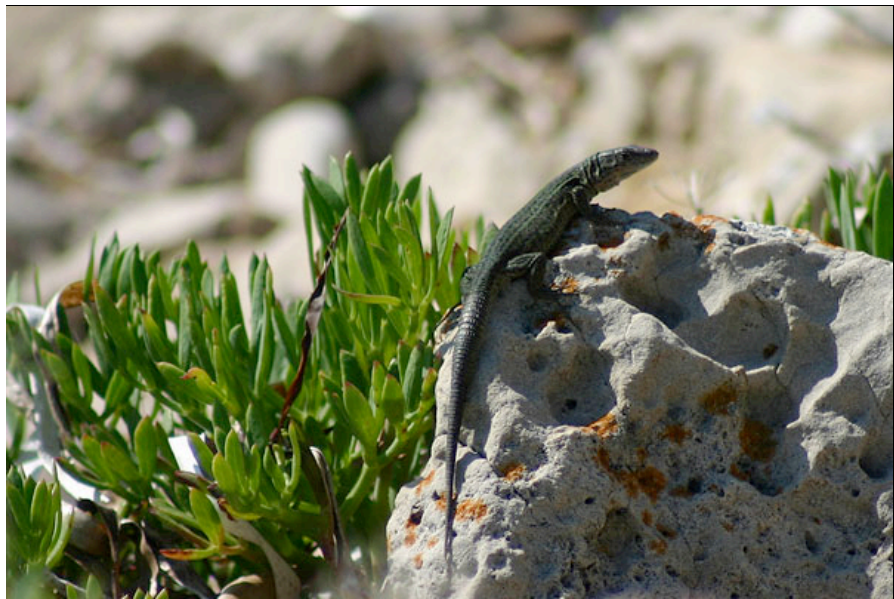
Adult Podarcis lilfordi carbonerae (Illot d'en Carbó 24-04-2008)