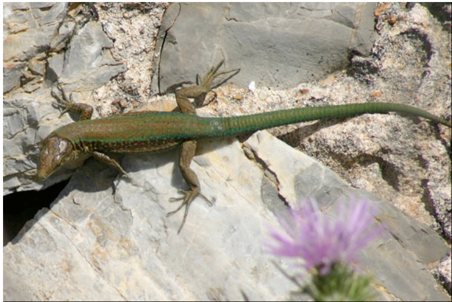
Female Podarcis lilfordi sargentanae (Illa Sargantana 22-04-2008)