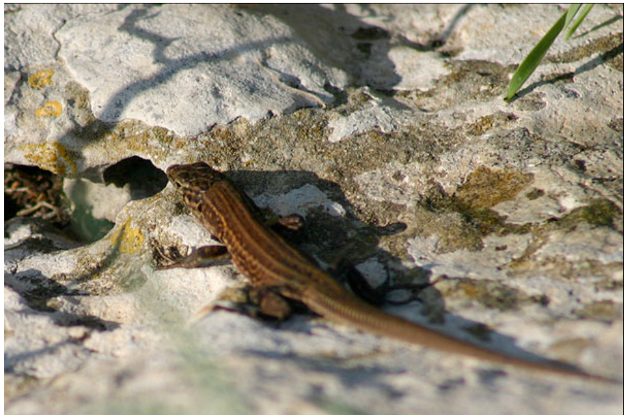
Juvenile Podarcis lilfordi codrellensis (Escull de Binicodrell Petit 24-10-2008)