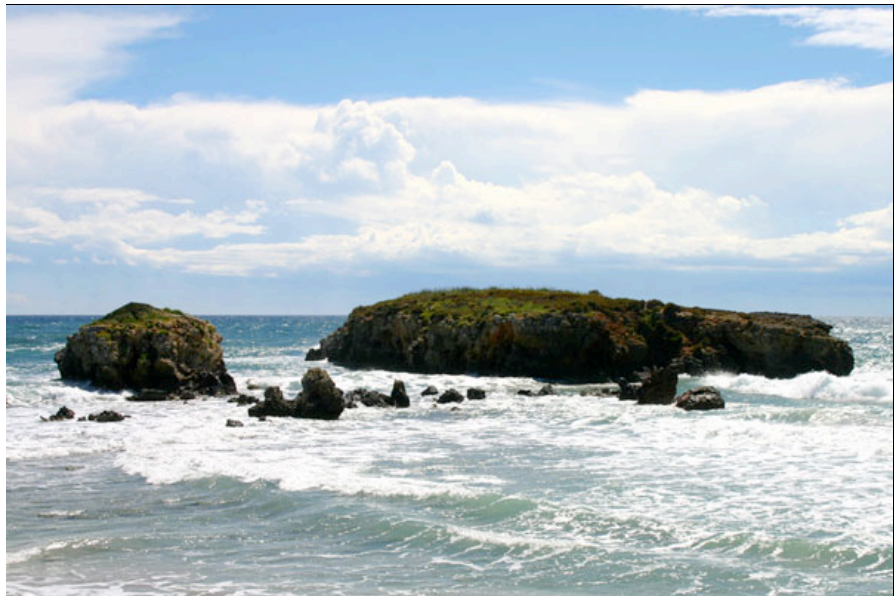
Escull de Binicodrell Petit and Gros (21-04-2008)