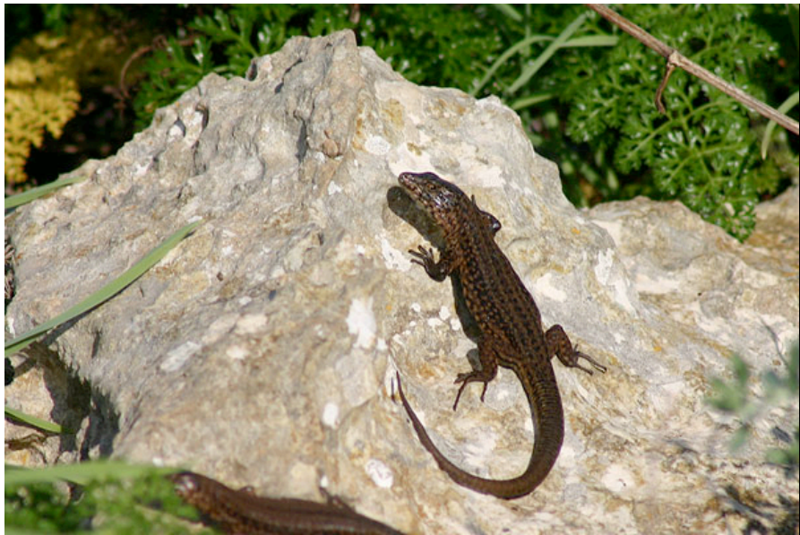
Male Podarcis lilfordi codrellensis (Escull de Binicodrell Gros 24-10-2008)