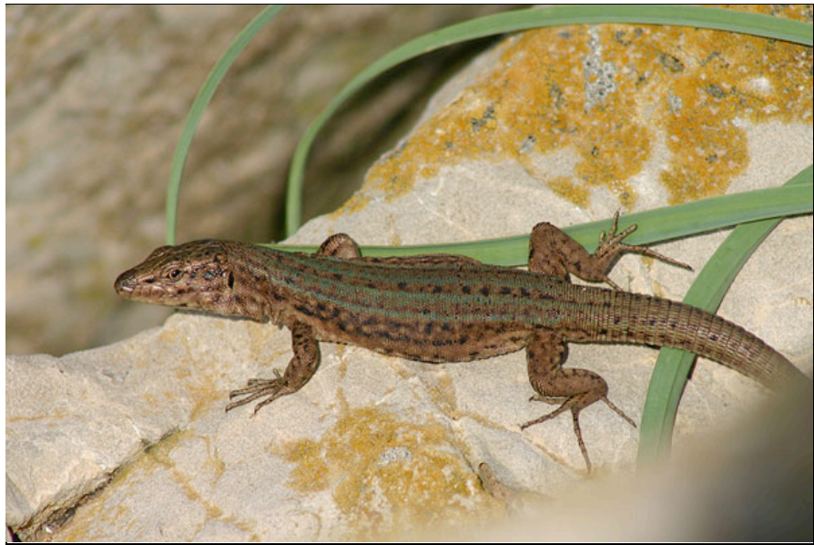
Female Podarcis lilfordi porrosicola (Illot des Porros 21-10-2008)