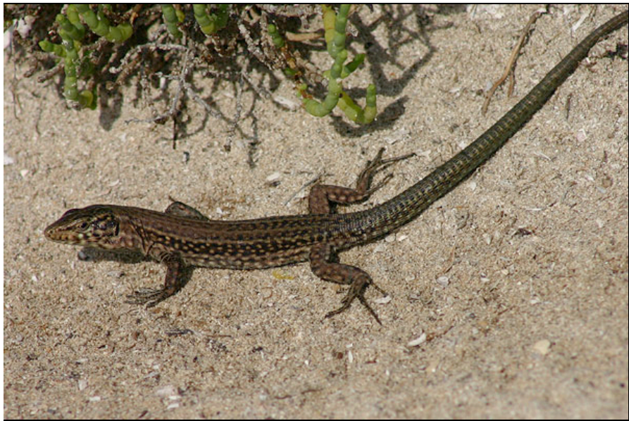
Female Podarcis lilfordi codrellensis (Escull de Binicodrell Gros 24-10-2008)