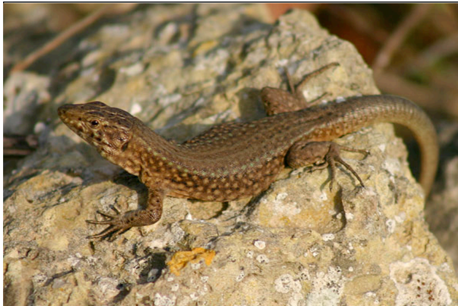
Male Podarcis lilfordi balearicus (Illa del Rei 19-10-2008)