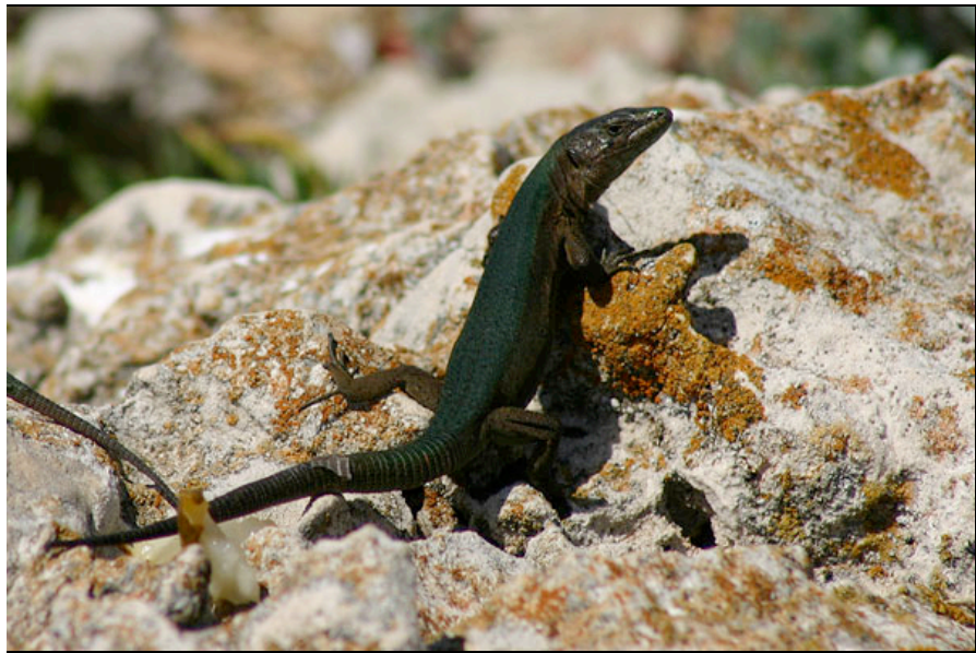
Adult Podarcis lilfordi fenni (Illa des Porros 25-04-2008)