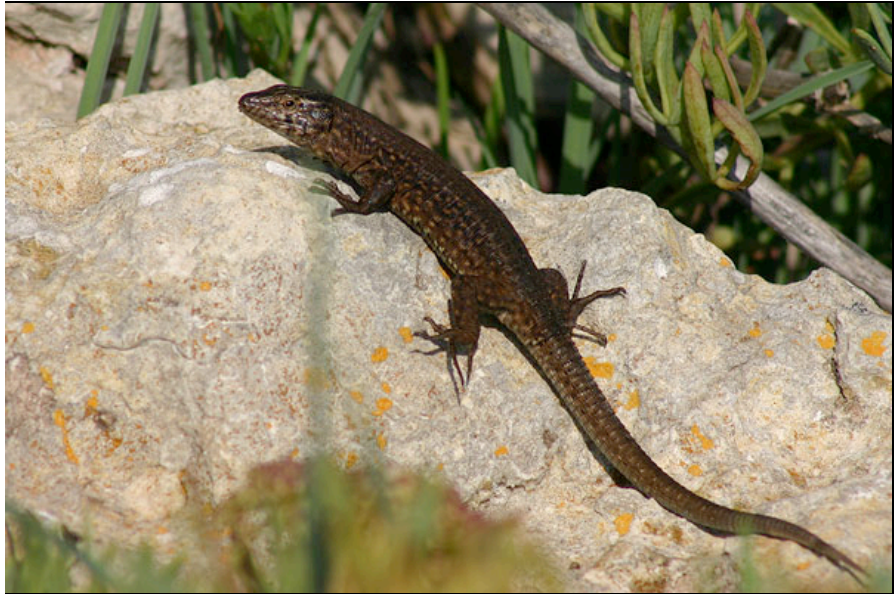
Male Podarcis lilfordi codrellensis (Escull de Binicodrell Petit 24-10-2008)