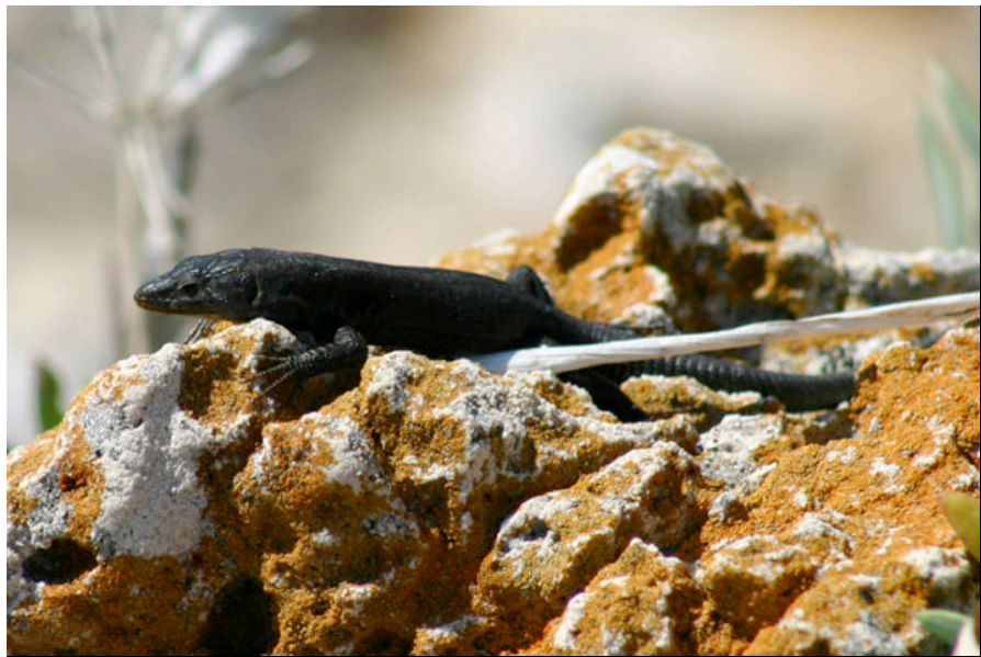
Melanistic Podarcis lilfordi carbonerae (Illot d'en Carbó 24-04-2008)