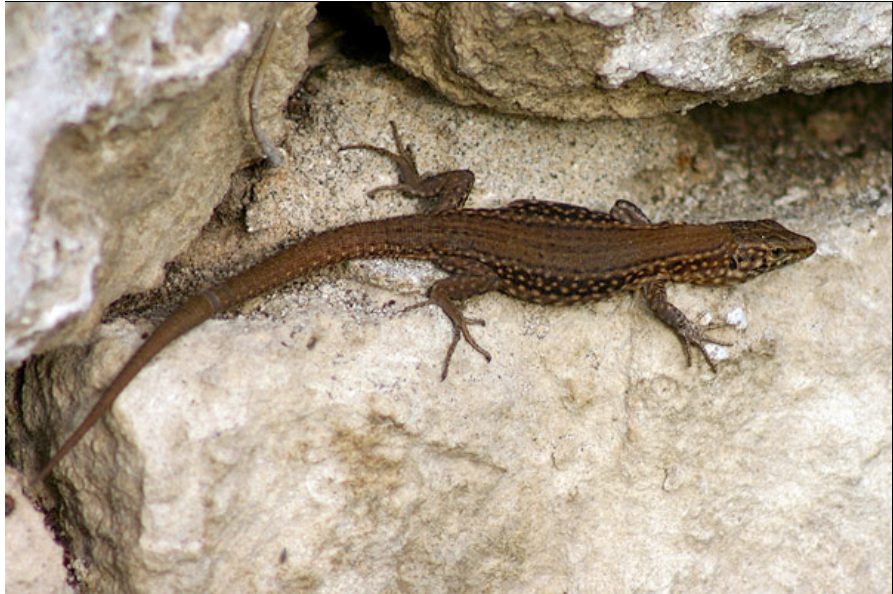
Female Podarcis lilfordi balearicus (Illa del Rei 19-10-2008)