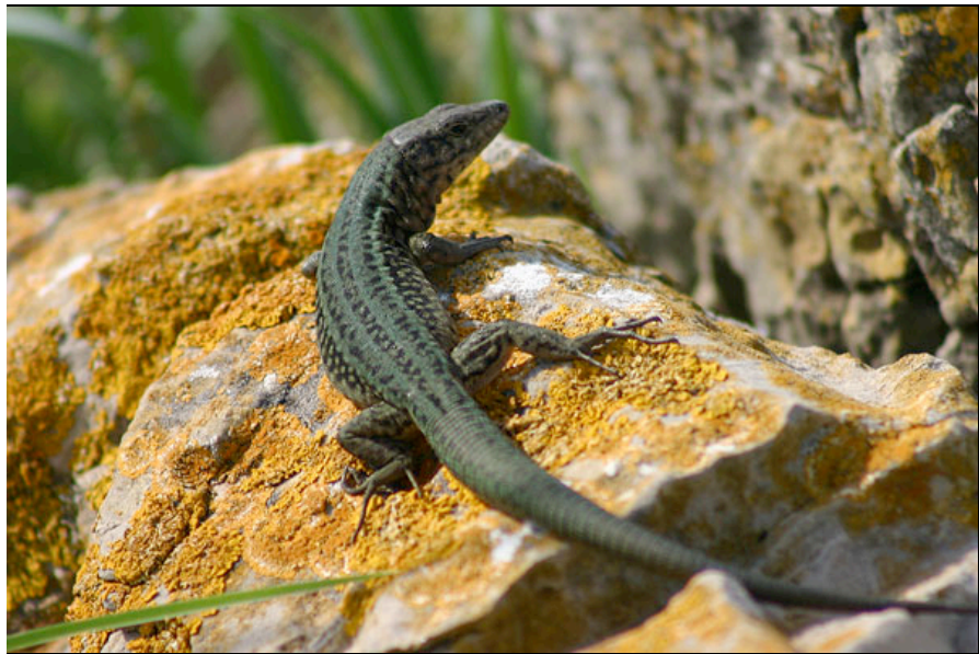
Male Podarcis lilfordi porrosicola (Illot des Porros 21-10-2008)