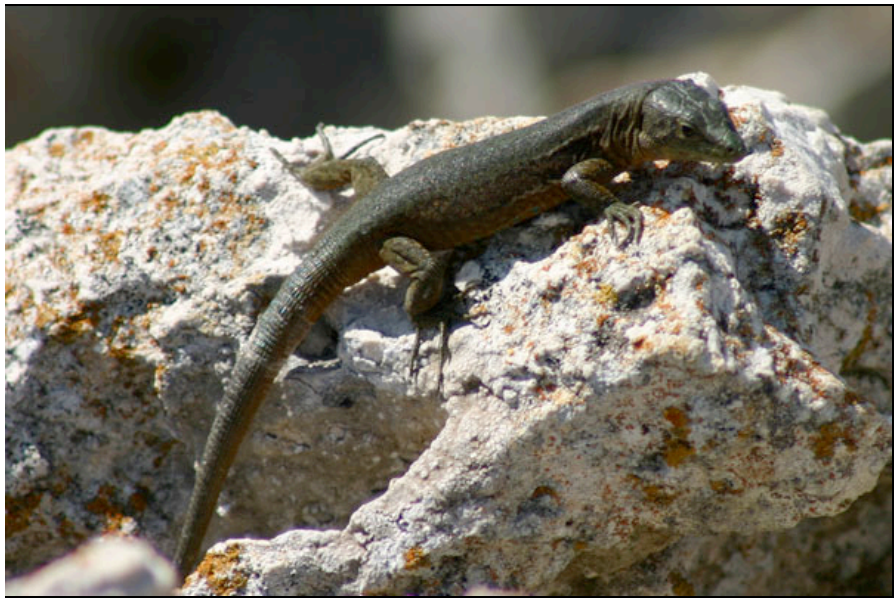
Adult Podarcis lilfordi fenni (Illa des Porros 25-04-2008)