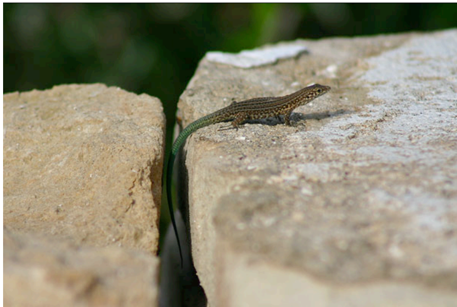
Juvenile Podarcis lilfordi balearicus (Illa del Rei 19-10-2008)