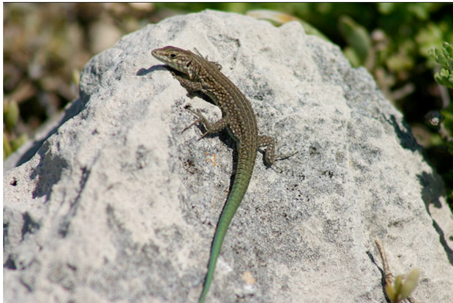
Juvenile Podarcis lilfordi addayae (Illa Petita d'Addaia 24-04-2008)