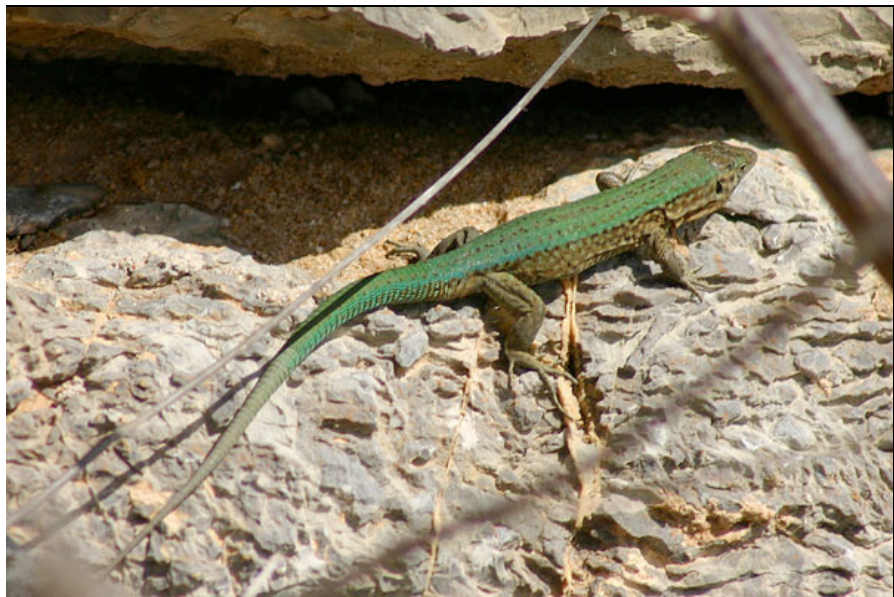
Male Podarcis lilfordi sargantanae (Illa Sargantana 22-04-2008)