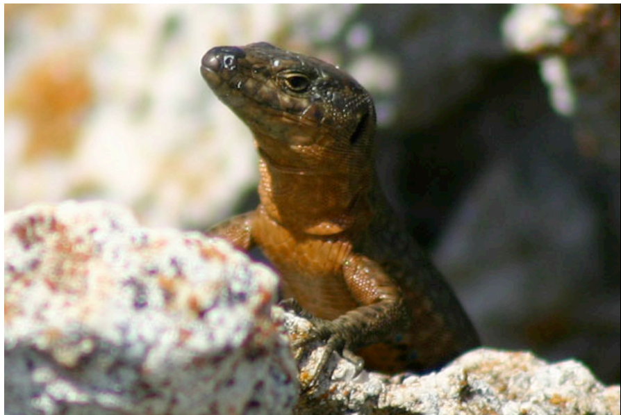
Adult Podarcis lilfordi fenni (Illa des Porros 25-04-2008)