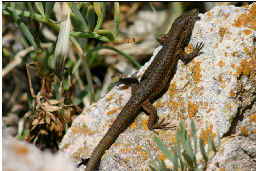
Adult Podarcis lilfordi fenni (Illa des Porros 25-04-2008)