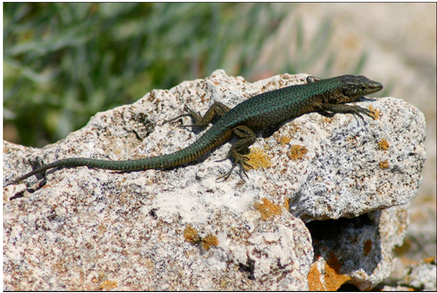
Adult Podarcis lilfordi fenni (Illa des Porros 25-04-2008)