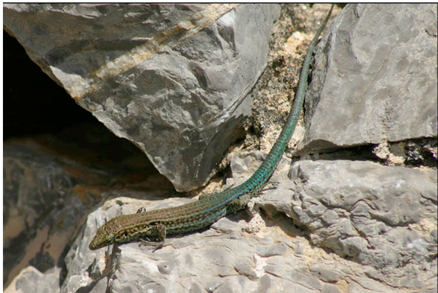
Female Podarcis lilfordi sargentanae (Illa Sargantana 22-04-2008)