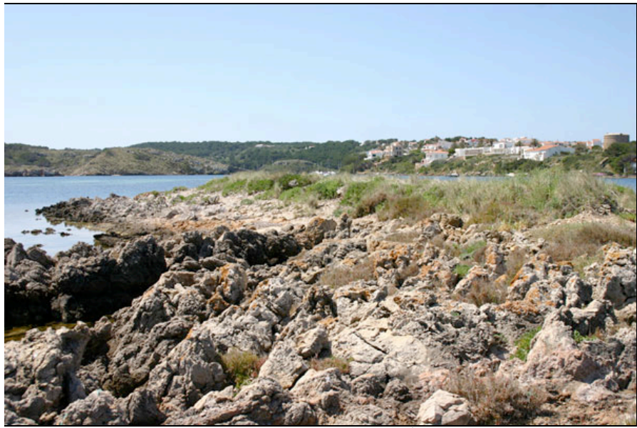
Habitat and most of the island of illot d'en Carbó (24-04-2008)