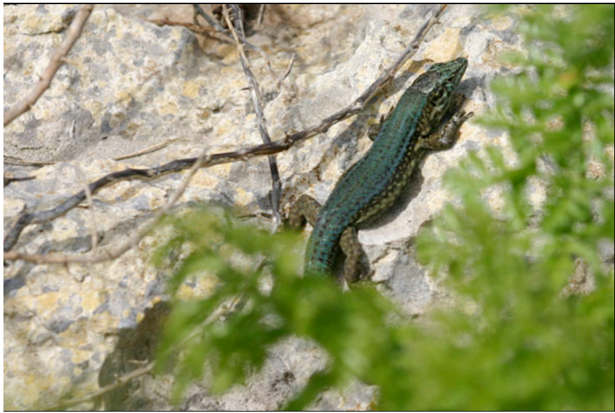
Male Podarcis lilfordi codrellensis (Escull de Binicodrell Gros 21-04-2008)