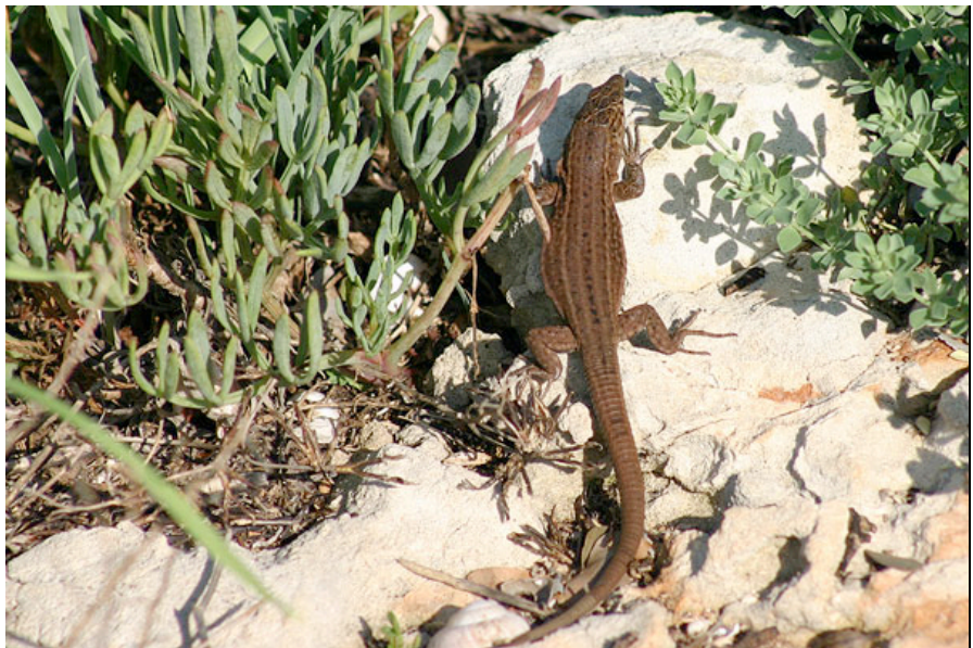
Female Podarcis lilfordi codrellensis (Escull de Binicodrell Petit 24-10-2008)