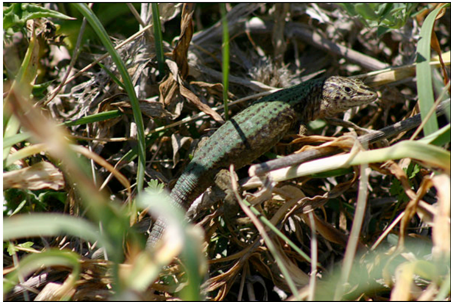
Male Podarcis lilfordi addayae (Illa Gran d'Addaia 24-04-2008)