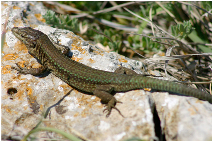
Female Podarcis lilfordi addayae (Illa Gran d'Addaia 24-04-2008)