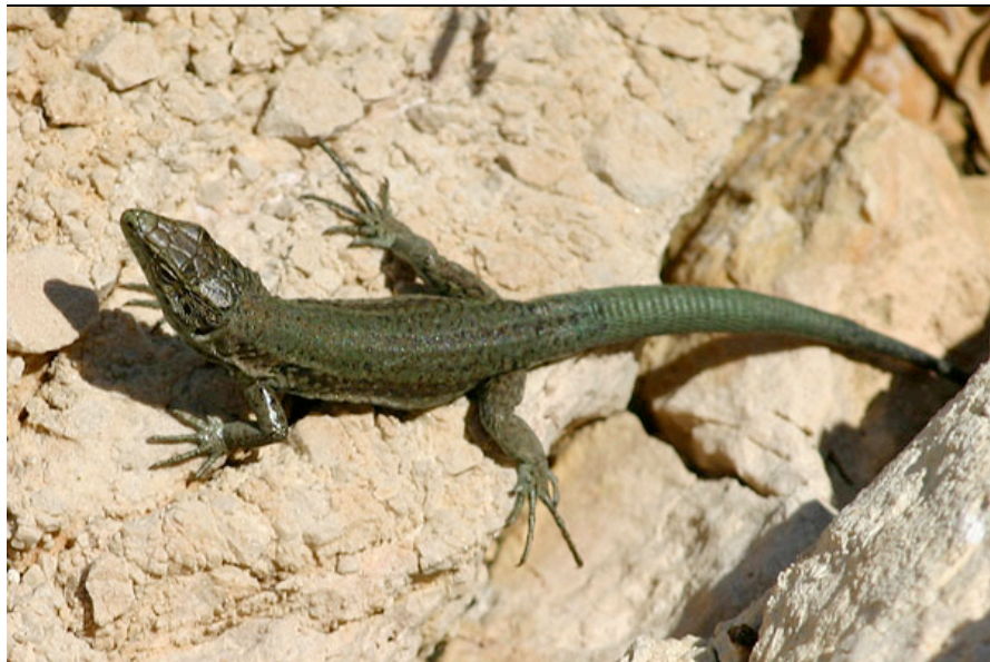
Female Podarcis lilfordi addayae (Illa Petita d'Addaia 24-04-2008)

The distribution of Podarcis lilfordi addayae also extends to the small rock of illiot de Ses Àligues, but it is uncertain if this population is still present.