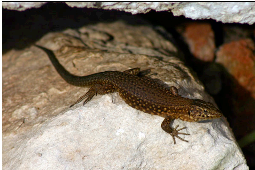
Male Podarcis lilfordi balearicus (Illa del Rei 19-10-2008)