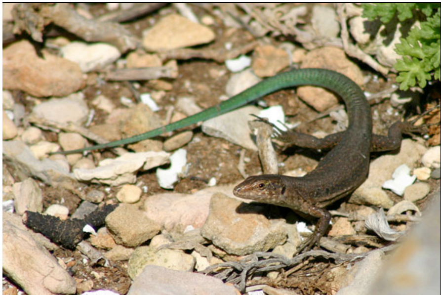
Female Podarcis lilfordi addayae (Illa Petita d'Addaia 24-04-2008)