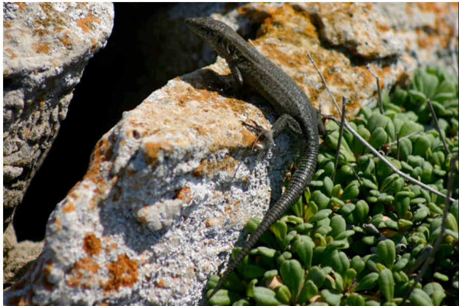
Adult Podarcis lilfordi carbonerae (Illot d'en Carbó 24-04-2008)