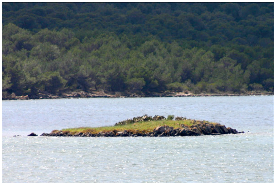
Illot des Porros (22-04-2008)

One of the islands with probably the youngest disconnection from mainland Menorca is illot des Porros (together with the later mentioned Escull de Binicodrell).