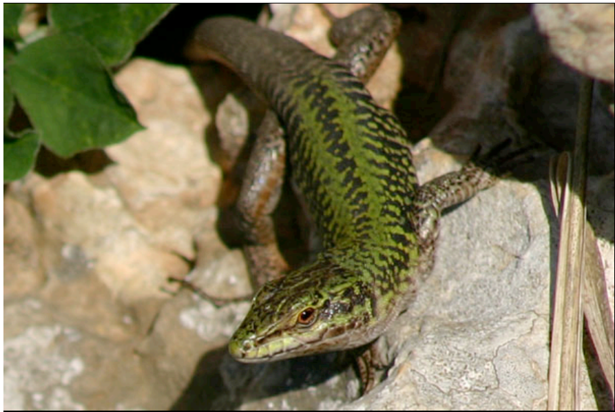
Podarcis siculus – the new Podarcis in town (all over Menorca and three islands)