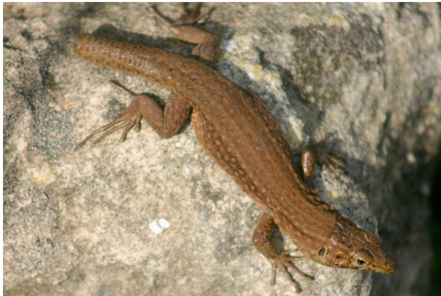
Female Podarcis lilfordi balearicus (Illa del Rei 19-10-2008)