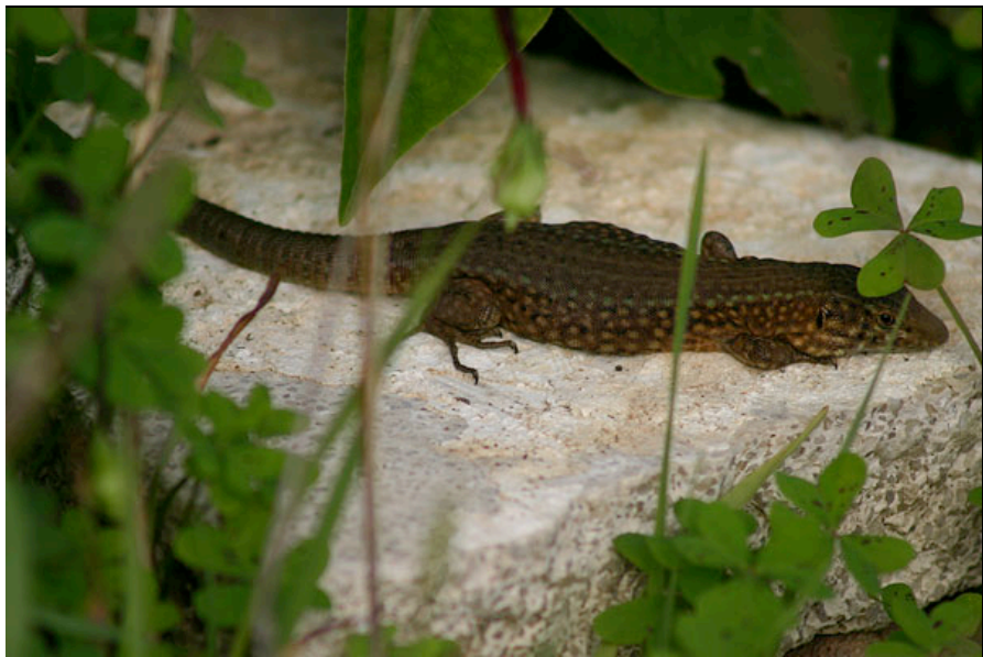
Male Podarcis lilfordi balearicus (Illa del Rei 19-10-2008)