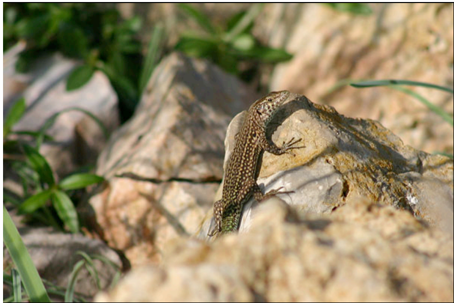
Female Podarcis lilfordi sargantanae (Illa des Ravells 21-10-2008)

Podarcis lilfordi sargantanae populations are also found on two other northern islands, illa de ses Bledes and illot d'en Tosqueta, which still have to be visited by me.