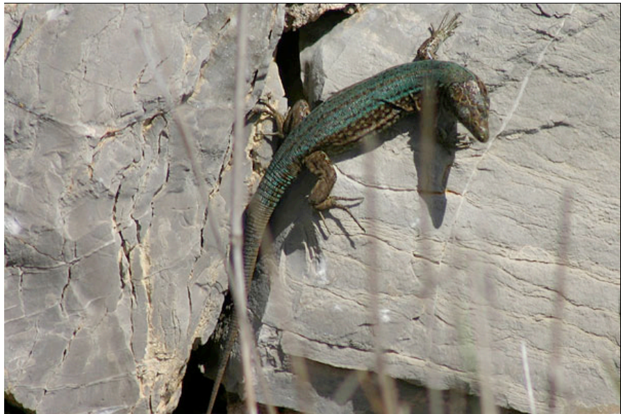
Male Podarcis lilfordi sargentanae (Illa Sargantana 22-04-2008)