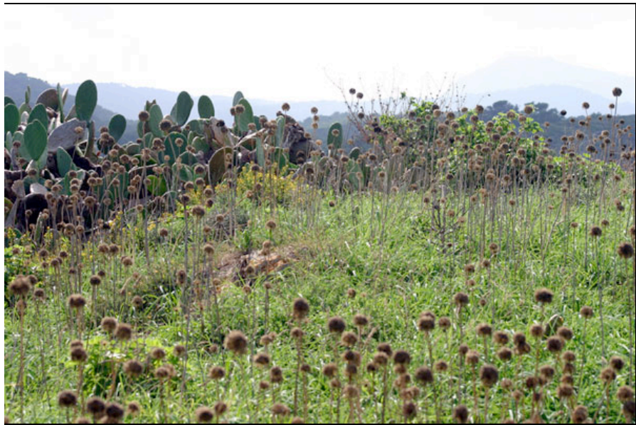
Habitat illot des Porros (21-10-2008)