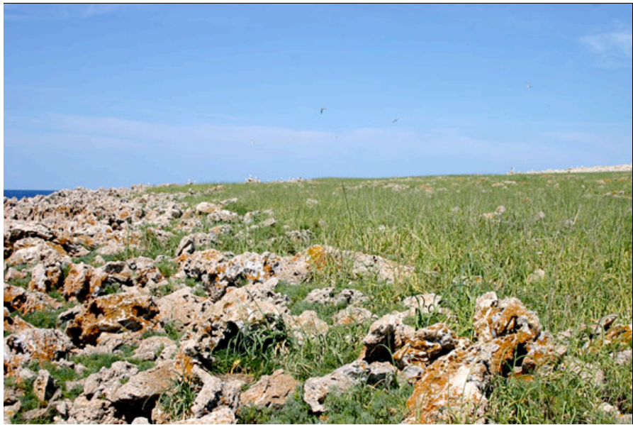
Habitat illa des Porros (25-04-2008)