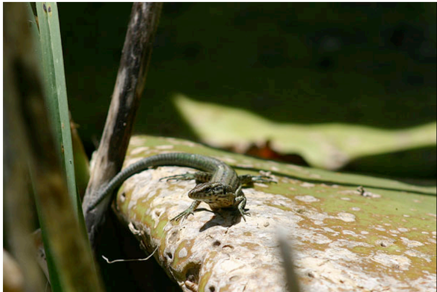
Female Podarcis lilfordi porrosicola (Illot des Porros 22-04-2008)