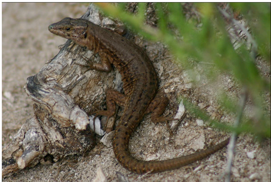
Male Podarcis lilfordi codrellensis (Escull de Binicodrell Gros 24-10-2008)