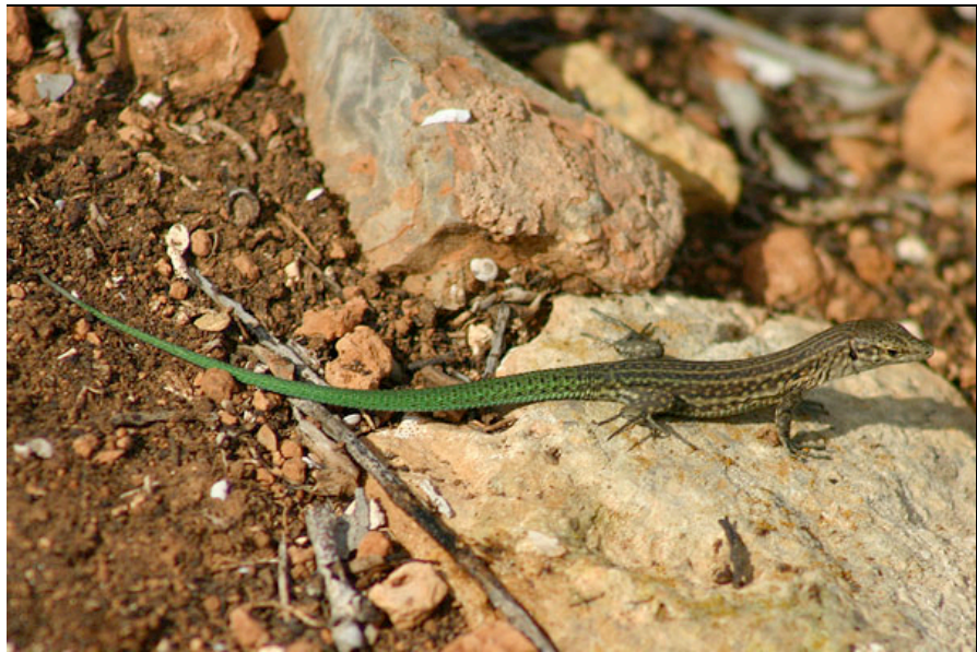
Juvenile Podarcis lilfordi sargentanae (Illa des Ravells 21-10-2008)