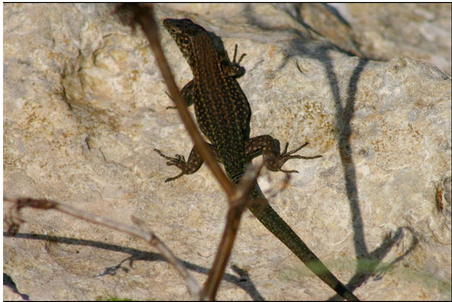
Female Podarcis lilfordi codrellensis (Escull de Binicodrell Gros 24-10-2008)