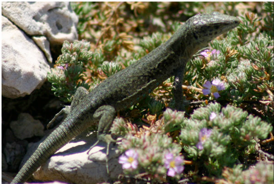
Male Podarcis lilfordi addayae (Illa Petita d'Addaia 24-04-2008)