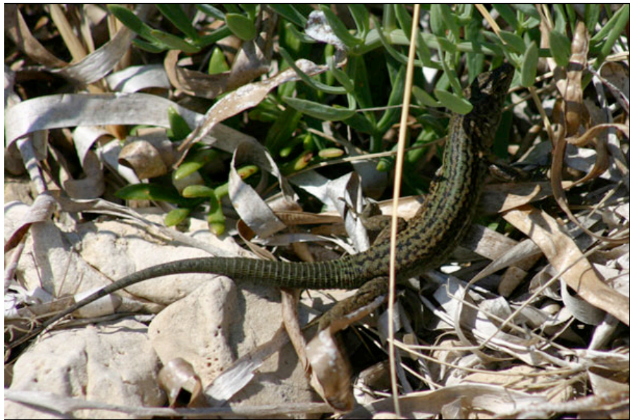
Adult Podarcis lilfordi carbonerae (Illot d'en Carbó 24-04-2008)