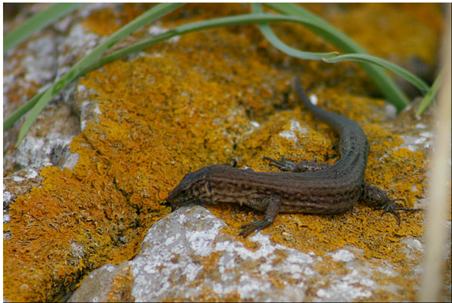
Female Podarcis lilfordi porrosicola (Illot des Porros 21-10-2008)