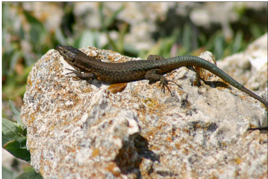
Adult Podarcis lilfordi fenni (Illa des Porros 25-04-2008)