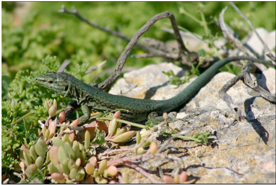
Male Podarcis lilfordi addayae (Illa Petita d'Addaia 24-04-2008)