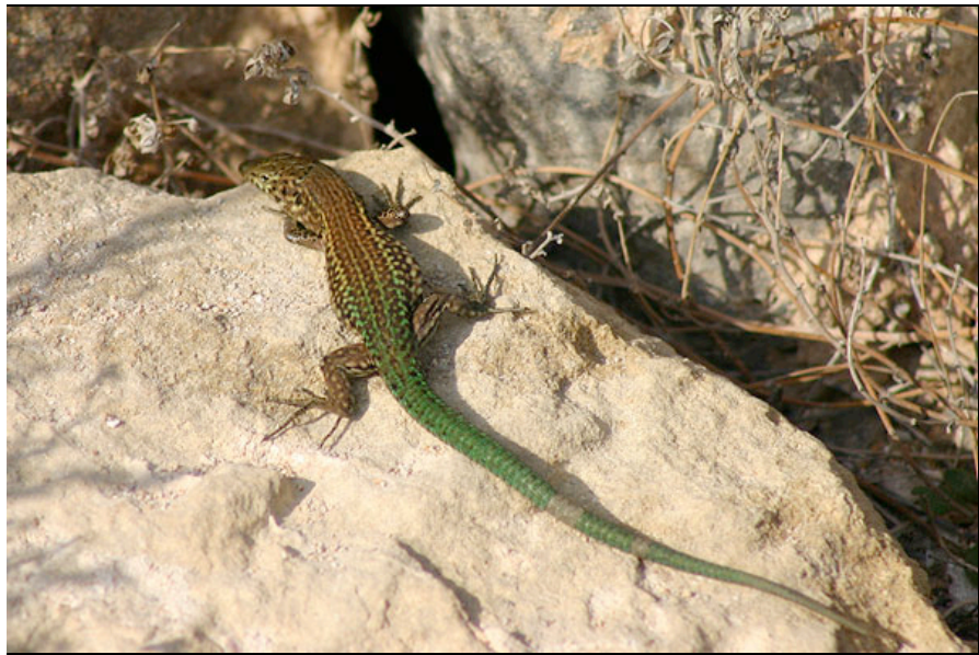
Female Podarcis liifordi sargantanae (Illa Sargantana 21-10-2008)