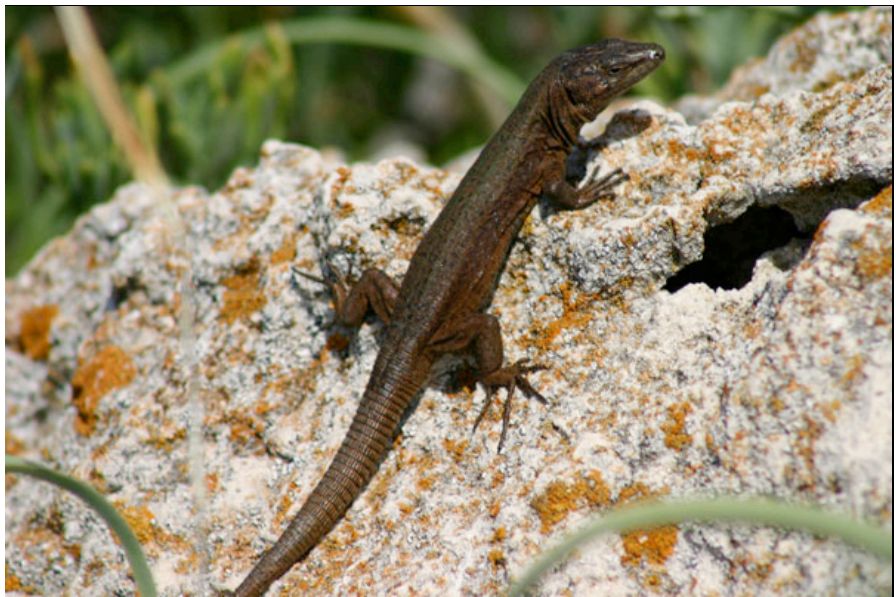
Adult Podarcis lilfordi fenni (Illa des Porros 25-04-2008)