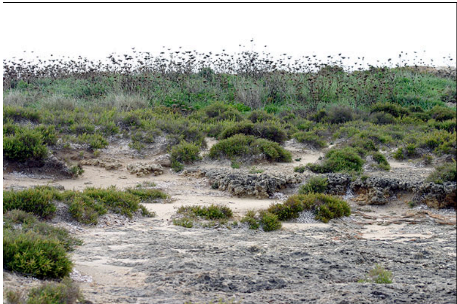
Habitat Escull de Binicodrell Gros (24-10-2008)