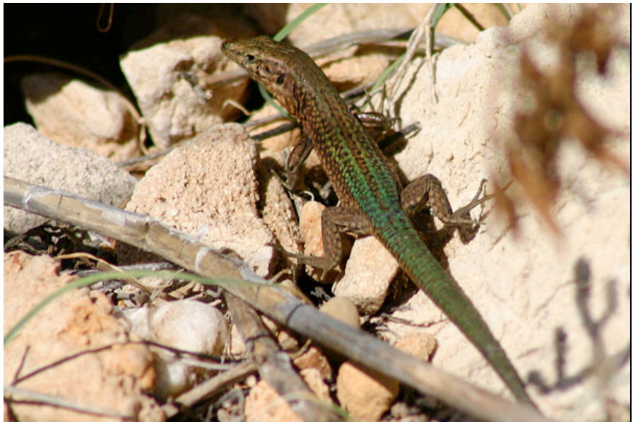
Adult Podarcis lilfordi fenni (Illa des Porros 25-04-2008)