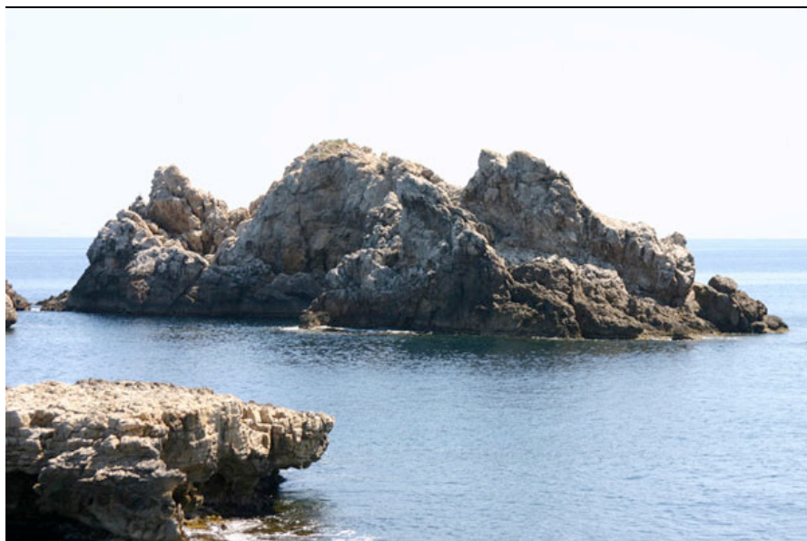
Illot de Ses Àligues (24-04-2008)

The distribution of Podarcis lilfordi addayae also extends to the small rock of illiot de Ses Àligues, but it is uncertain if this population is still present.