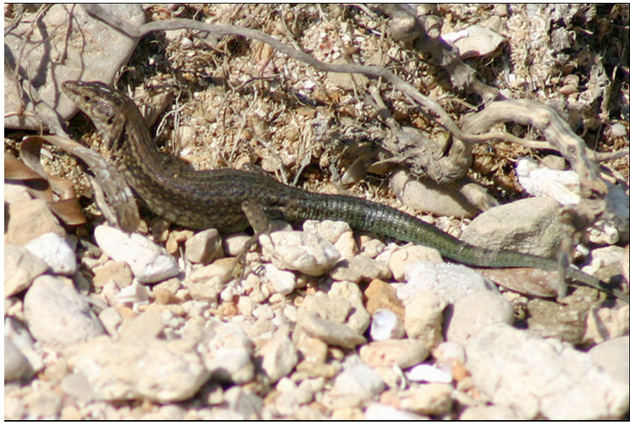
Adult Podarcis lilfordi carbonerae (Illot d'en Carbó 24-04-2008)