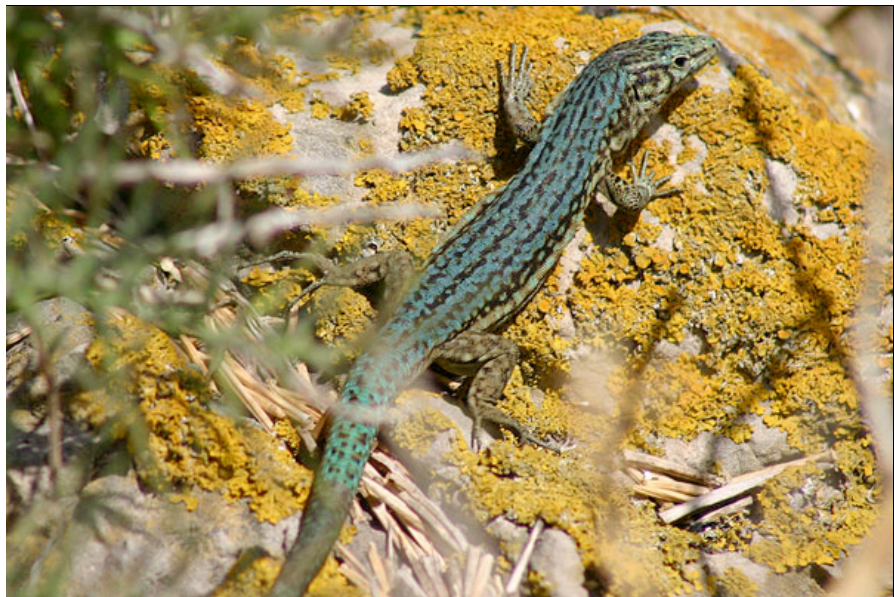
Male Podarcis lilfordi porrosicola (Illot des Porros 22-04-2008)