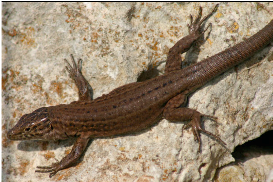
Male Podarcis liifordi codrellensis (Escull de Biniodrell Petit 24-10-2008)