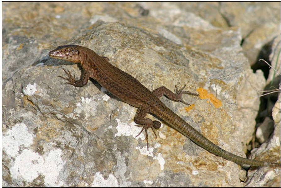
Female Podarcis lilfordi sargantanae (Illa des Ravells 21-10-2008)