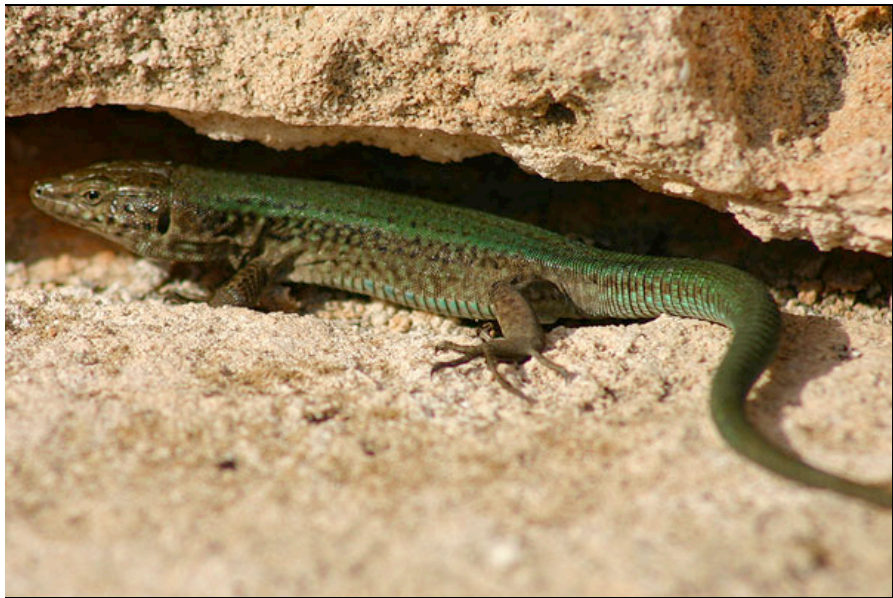
Male Podarcis lilfordi sargentanae (Illa Sargantana 21-10-2008)