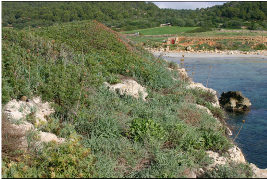
Habitat Escull de Biniodrell Petit (24-10-2008)