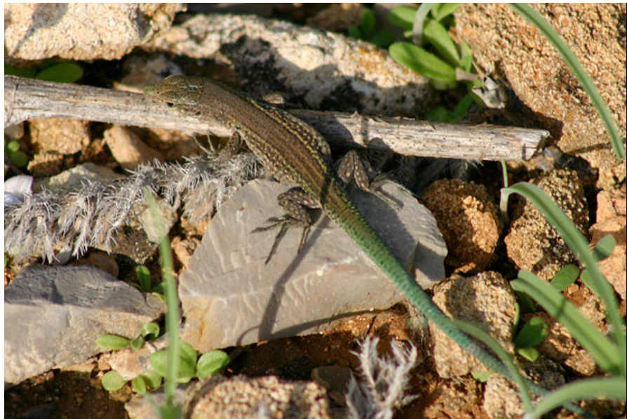
Juvenile Podarcis liifordi sargantanae (Illa Sargantana 21-10-2008)