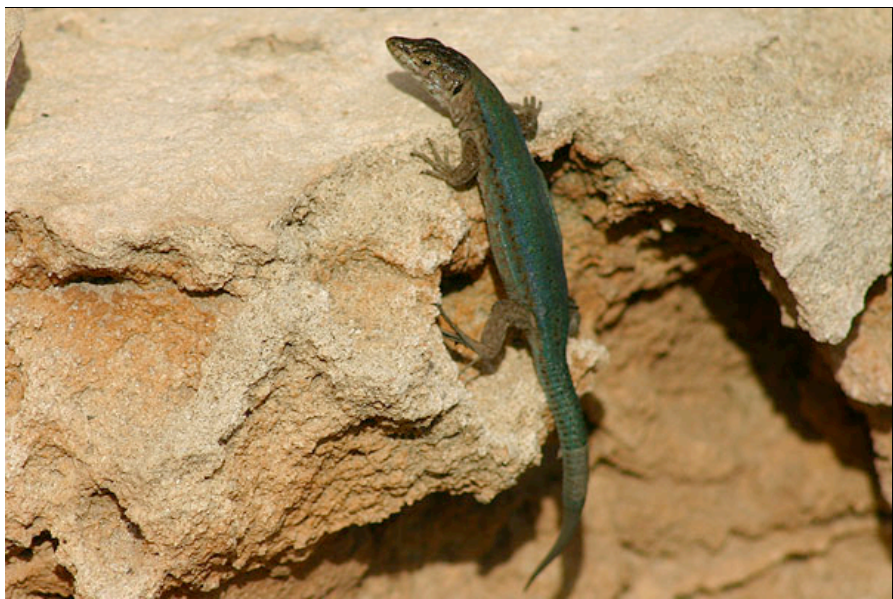
Male Podarcis lilfordi sargentanae (Illa Sargantana 21-10-2008)