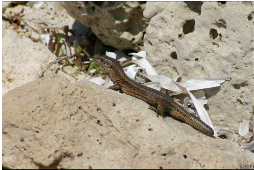
Adult Podarcis lilfordi carbonerae (Illot d'en Carbó 24-04-2008)