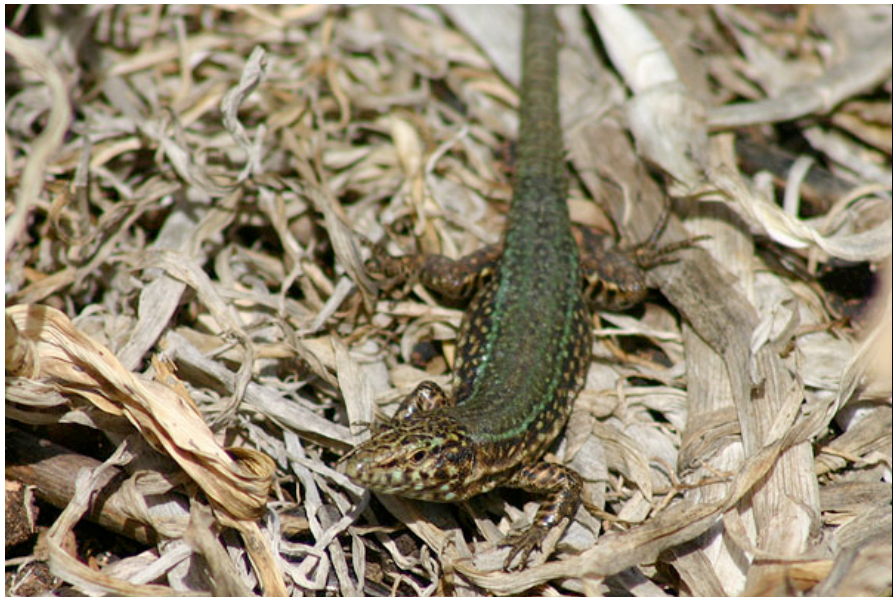
Male Podarcis lilfordi codrellensis (Escull de Binicodrell Gros 21-04-2008)