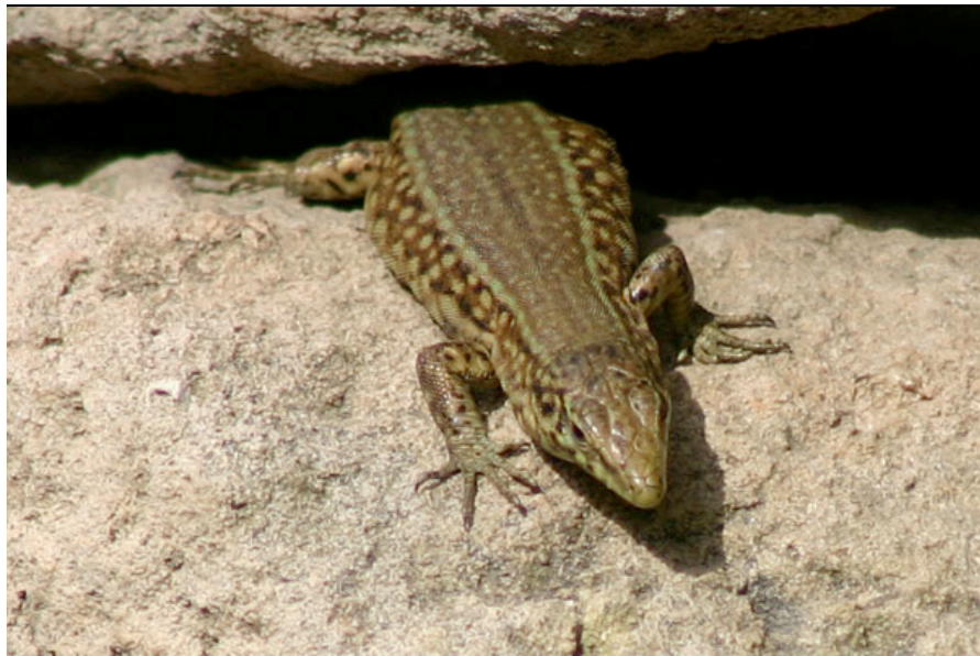
Female Podarcis lilfordi balearicus (Illa del Rei 20-04-2008)