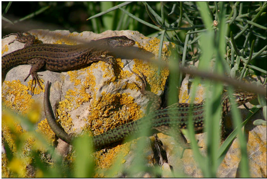
Pair Podarcis lilfordi porrosicola (Illot des Porros 21-10-2008)