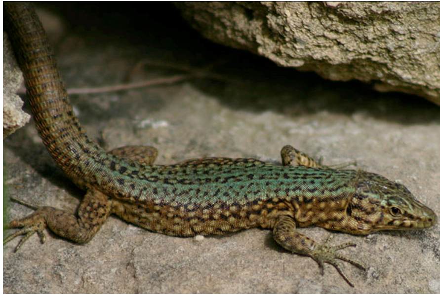
Male Podarcis lilfordi balearicus (Illa del Rei 20-04-2008)