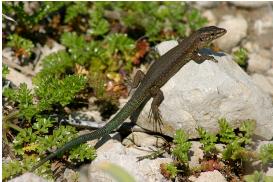
Female Podarcis lilfordi addayae (Illa Gran d'Addaia 24-04-2008)