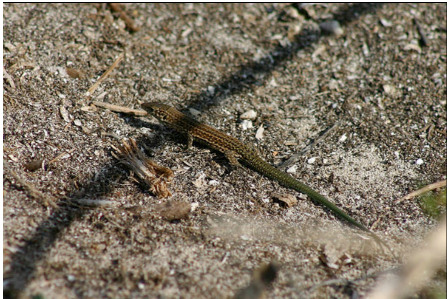
Juvenile Podarcis lilfordi codrellensis (Escull de Binicodrell Gros 24-10-2008)