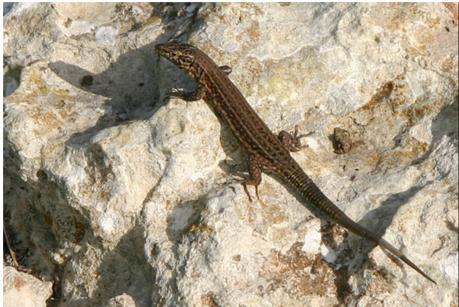
Female Podarcis lilfordi codrellensis (Escull de Binicodrell Petit 24-10-2008)