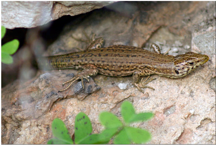
Female Podarcis lilfordi balearicus (Illa del Rei 19-10-2008)