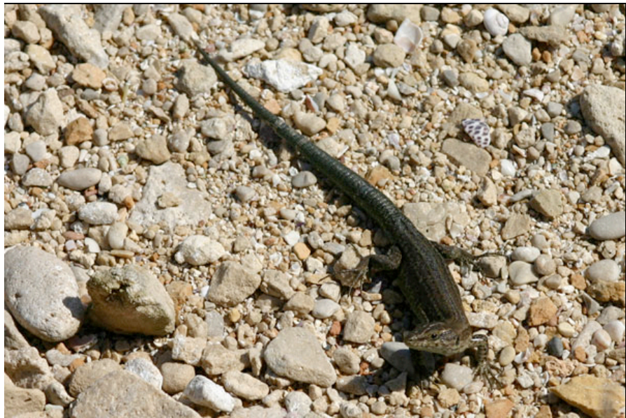
Adult Podarcis lilfordi carbonerae (Illot d'en Carbó 24-04-2008)