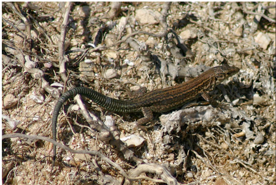
Adult Podarcis lilfordi carbonerae (Illot d'en Carbó 24-04-2008)