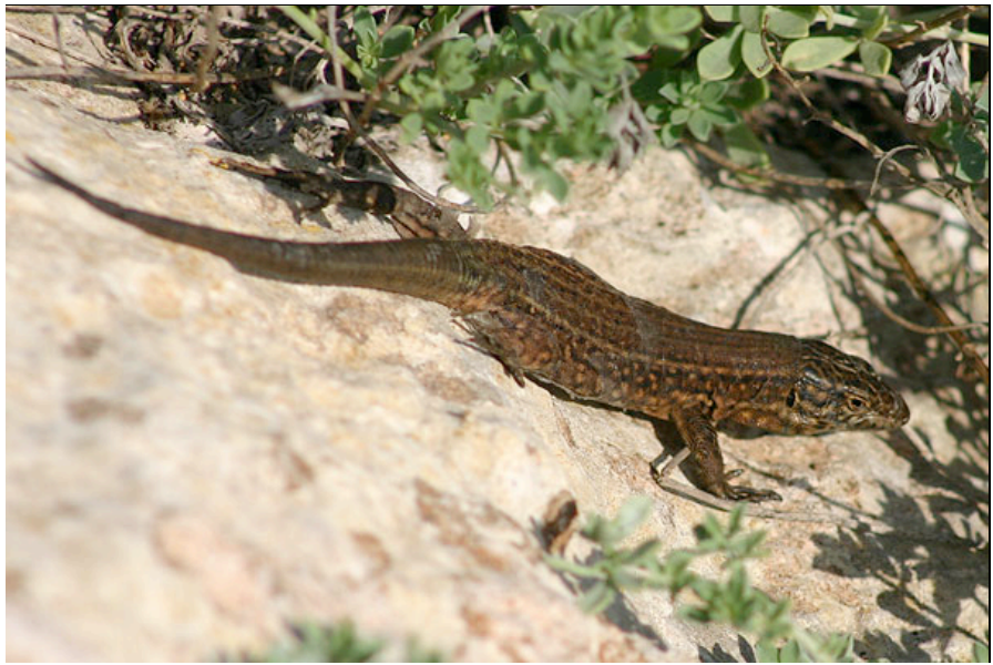
Male Podarcis lilfordi codrellensis (Escull de Binicodrell Petit 24-10-2008)