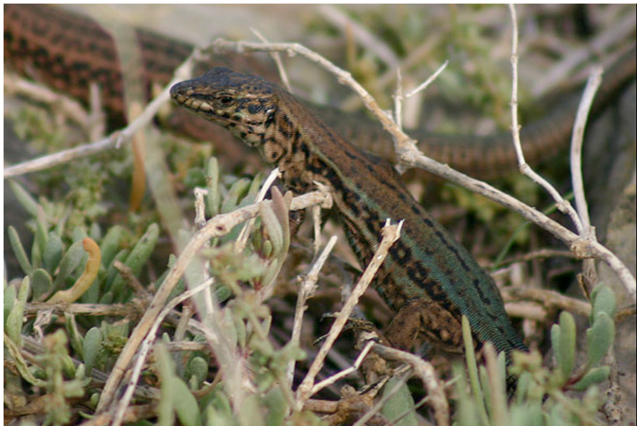
Female Podarcis lilfordi porrosicola (Illot des Porros 21-10-2008)