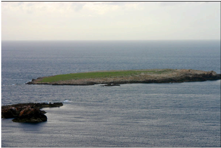
Illa des Porros or illa Sanitja (20-04-2008)