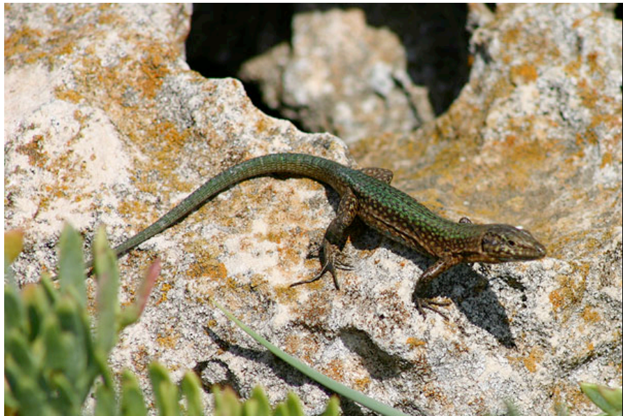
Adult Podarcis lilfordi fenni (Illa des Porros 25-04-2008)