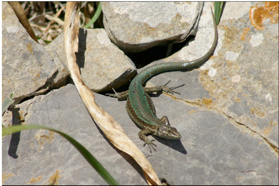
Female Podarcis lilfordi sargentanae (Illa des Ravells 22-04-2008)