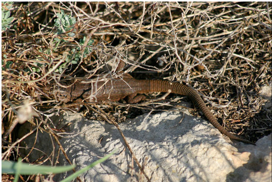
Male Podarcis liifordi codrellensis (Escull de Biniodrell Petit 24-10-2008)