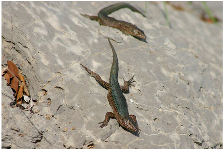
Pair Podarcis lilfordi sargentanae (Illa des Ravells 21-10-2008)