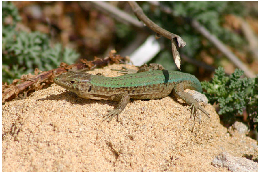
Male Podarcis lilfordi sargantanae (Illa Sargantana 22-04-2008)