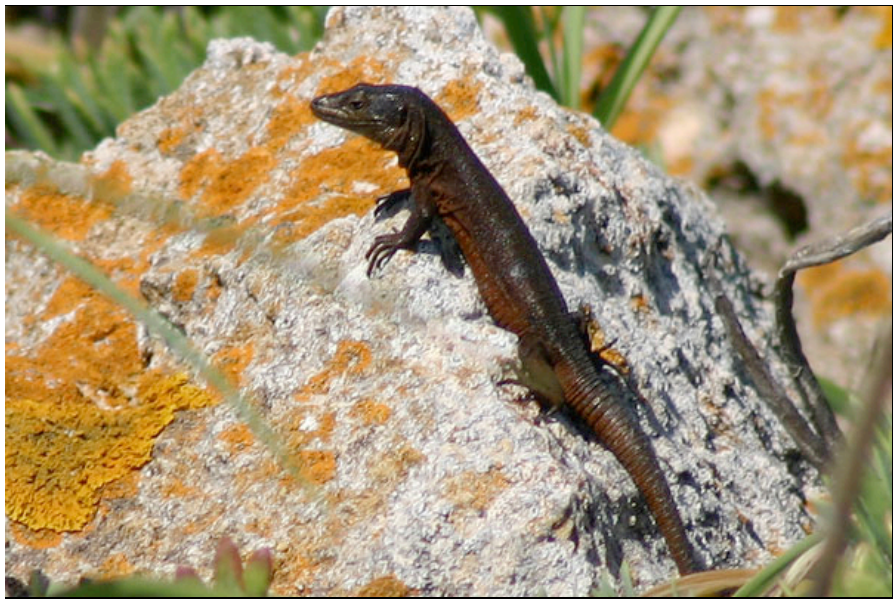
Adult Podarcis lilfordi fenni (Illa des Porros 25-04-2008)