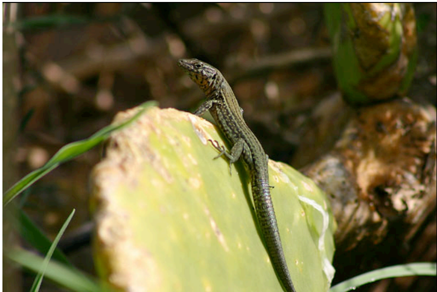
Male Podarcis lilfordi porrosicola (Illot des Porros 21-10-2008)