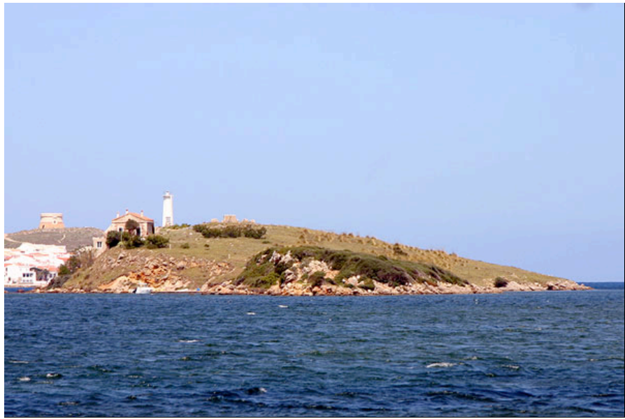
Illa Sargantana and Illa des Ravells (in front) (Fornells bay 22-04-2008)