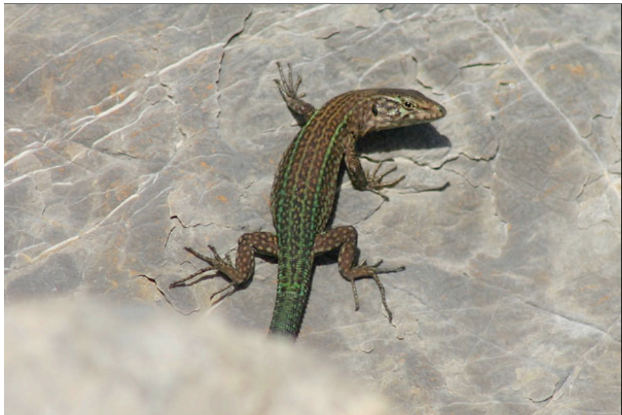
Female Podarcis liifordi sargantanae (Illa des Ravells 22-04-2008)