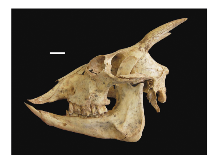
Fig. 2. M. balearicus skull (MNIB 81723) from Cova des Tancats (Menorca) in lateral view. The presence of a single evergrowing incisor, reduction of number of premolars and frontalization of eye orbits are some of the most important derived features in the skull of the species. Scale bar 2 cm.

The phylogenetic relationships of Myotragus are still not clearly understood. Initially (Andrews, 1915; Gliozzi and Malatesta, 1980; Palombo et al., 2006) it was related to Nemorhaedus Smith 1827 and Capricornis Ogilby 1837. These genera were traditionally related to Rupicapra de Blainville 1816 and Oreannos Rafinesque 1817 and