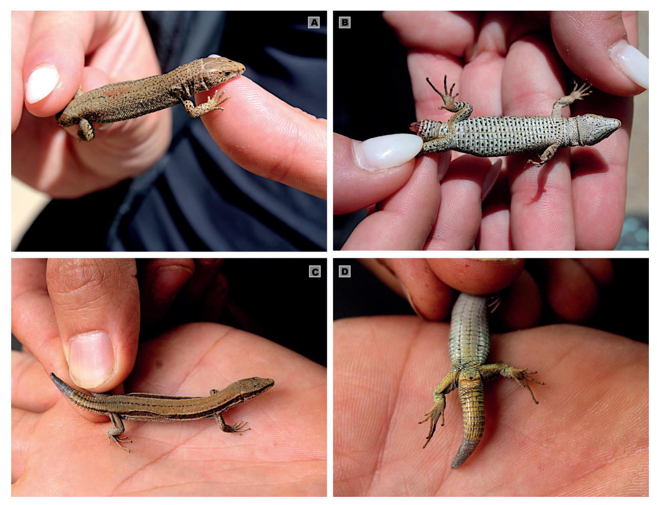
Figure 3. Male specimens of Atlantolacerta andreanskyi sampled in Toumliline (A, B) and Jbel Awlime (C, D).