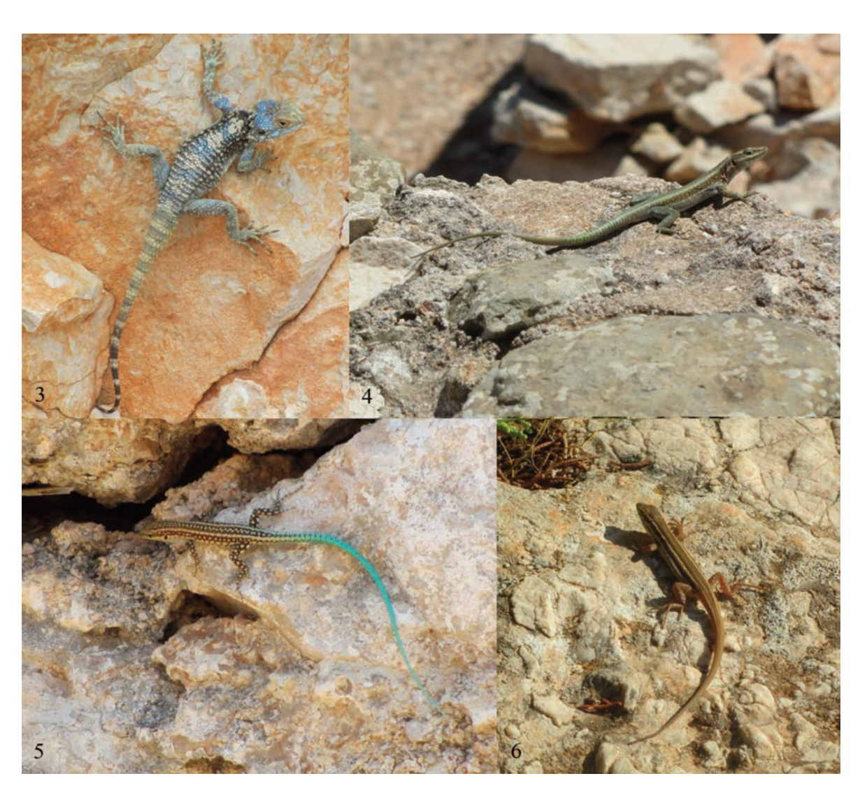
Figures 3–6. Reptiles from Alimia Island. Figure 3. Stellagama stellio daani . Figure 4. Anatololacerta oertzeni pelasgiana (adult). Figure 5. A. oertzeni pelasgiana (young). Figure 6. Ophisops elegans .

Mus musculus commonly called house mouse, is an anthropocore and highly invasive regarded species. This species native of Asia, is present in all continents, except Antarctica (Masseti, 2012).