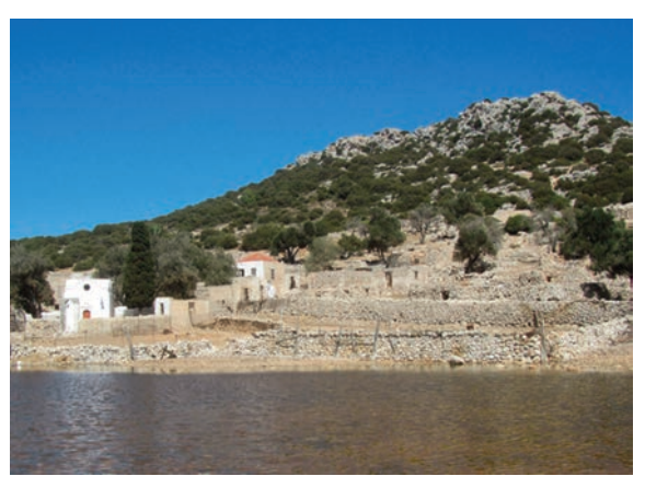
Figure 2. Ag. Georgios village, Alimia Island.

Anatololacerta oertzeni (Werner, 1904) is a lizard with a Mediterranean chorotype (Sindaco & Jeremčenko, 2008). It consists of six subspecies. At Rhodes and in the adjacent islands there's the subspecies A. oertzeni pelasgiana (Fig. 4). Like most Mediterranean reptiles, this lizard is particularly active in springtime, while in summer exposes oneself less frequently. However the young, very typical for the blue color of the tail (Fig. 5), are also