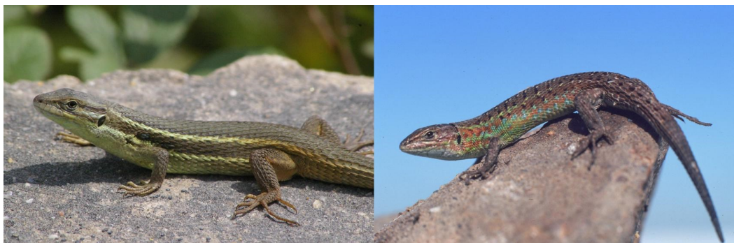
Figure 1: Psammodromus algirus , Cádiz, vicinity of Facinas (note tick scar, axil area), (left); P. occidentalis (CM 54808), Cádiz; Facinas, 7.3 km (airline) NE (N36.14809 W5.62074, 174m), (right).