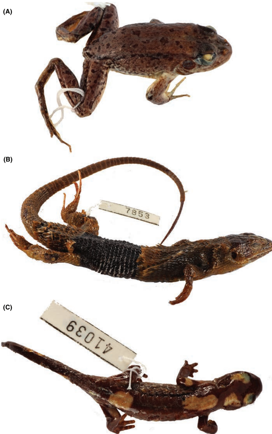
Fig. 1.— Type specimens of Rana ridibunda riodeoroi (Holotype) (A), Psammodromus algirus ketamensis (Holotype) (B) and Salamandra algira tingitana (Paratype) (C).