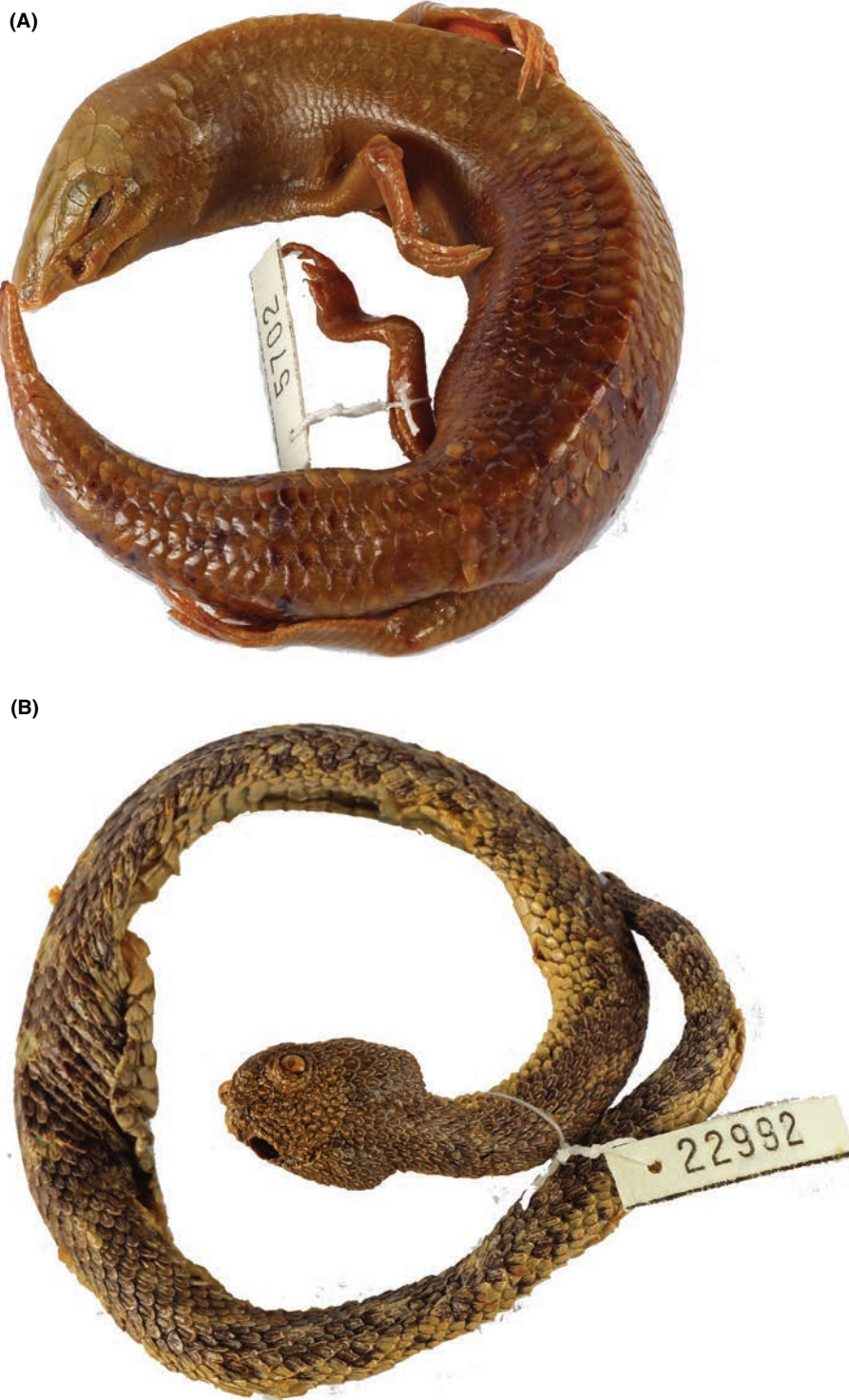
Fig. 4.— First known specimens from Morocco of the species Scincus albifasciatus (A) and Cerastes vipera (B), both collected from Cabo Juby, Tarfaya, during Comisión Permanente para el Estudio del Norte de África.