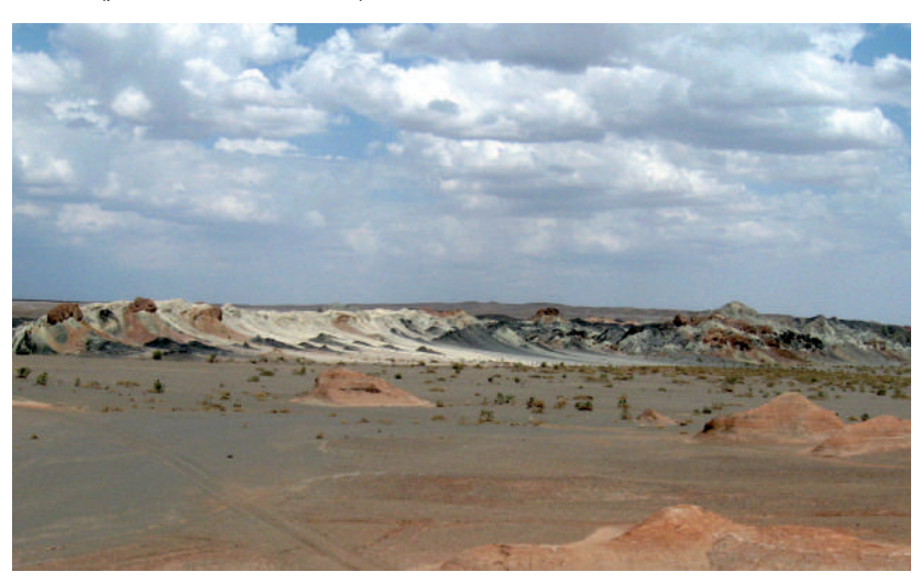
Fig. 6: General view of the valley of Nogoon-tsav, Trans-Altai Gobi 210