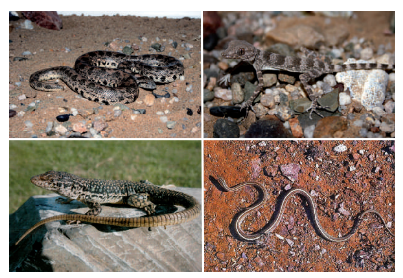
Fig. 4: Govi naked-toad gecko ( Cyrtopodion elongates ) (above right), Tatary sand boa ( Eryx tataricus ) in the valley Nogoon-tsav (above right), Slender racer ( Coluber spinalis ) in Uuliin Hudag, Middle Govi province, Multiocellated racerunner ( Eremias multiocellata tsaganbogdensis ); photos: Kh. MUNKHBAYAR.

Four species of amphibians and five species of reptiles are included into the Mongolian Red Book (1988, 1997). Also, the Mongolian Red List for amphibians and reptiles and the Summary Conservation Action Plans for Mongolian reptiles and amphibians (2006) are published by the Zoological Society of London. 66 % of Mongolian amphibians are evaluated as vulnerable by regional evaluation according to IUCN categories.