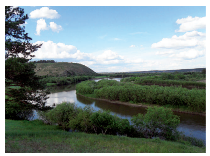
Fig. 5: Buureg Tolgoi, downstream of the river Orkhon, near Shaamar soum.