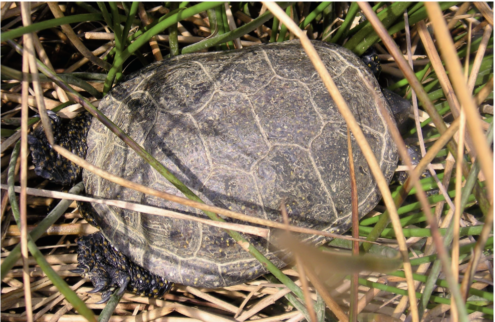
Fig. 5 - Emys orbicularis , adult, Bărbătești ponds.