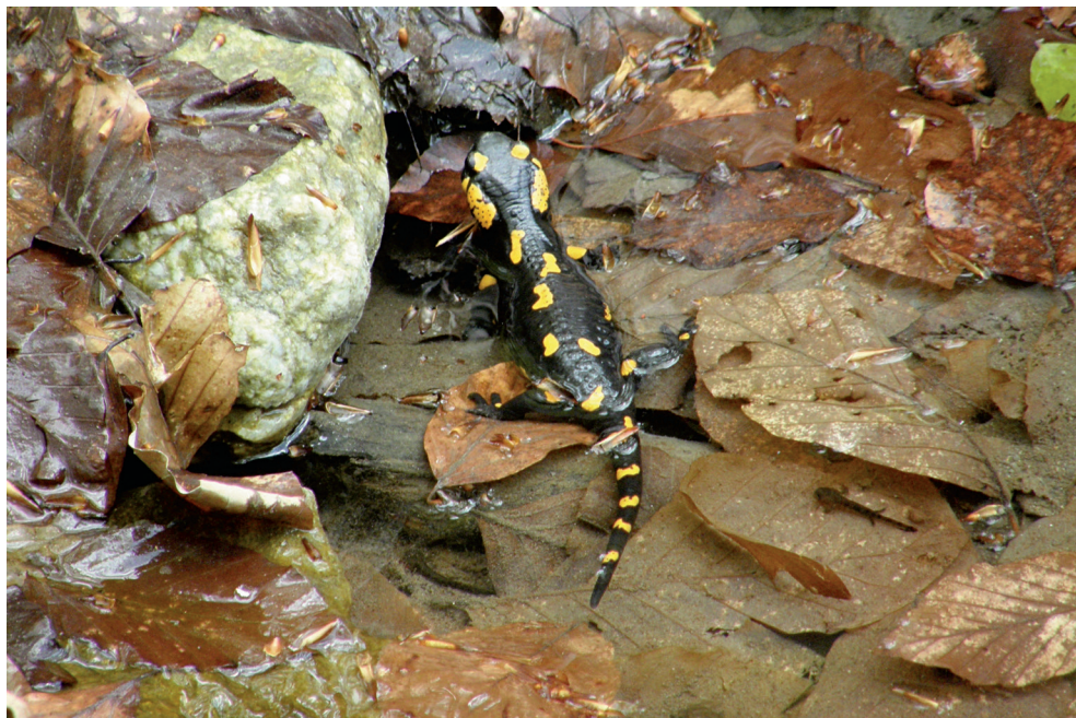
Fig. 2 - Salamandra salamandra , adult female depositing larvae, upper Otăsău valley.