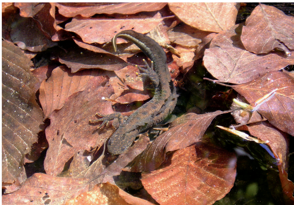
Fig. 3 - Triturus cristatus , adult male, Olănești valley.