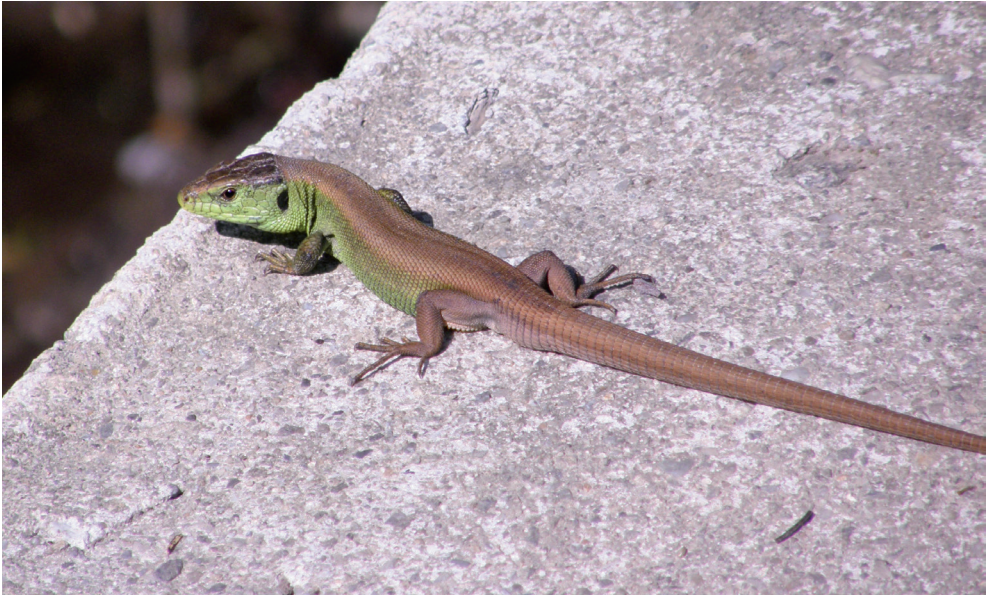
Fig. 6 - Lacerta agilis , adult male, with erythronotus and immaculata coloration, Lupului valley.