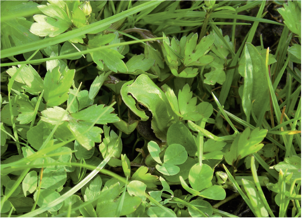
Fig. 4 - Hyla arborea , adult, Bărbătești ponds (Photo O. Iftime).