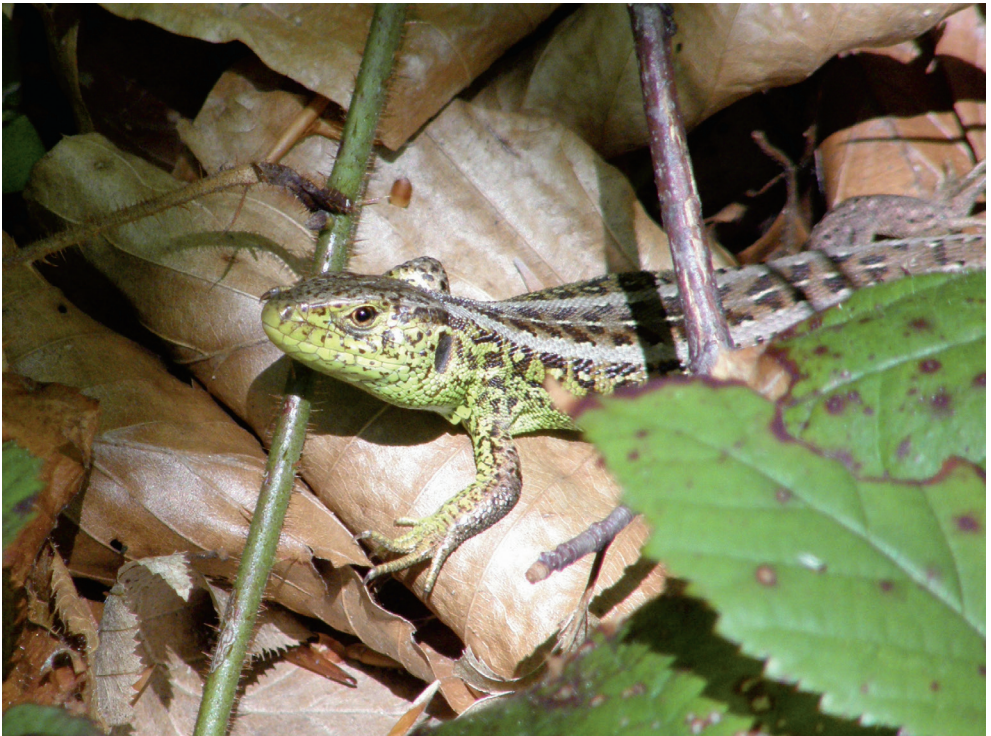
Fig. 7 - Lacerta agilis , adult male, with chersonensis -like single postnasal, Lupului valley.