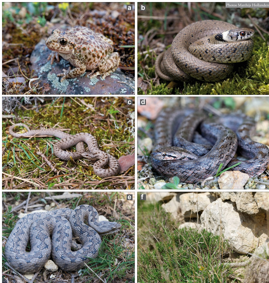
Figure 2: Images of selected new herpetological records. a) Alytes obstetricans pertinax , b) Natrix astreptophora , c) Coronella austriaca , d) Coronella girondica , e) Vipera latastei , f) Vipera latastei emerging from a stonewall.

Figura 2: Imágenes seleccionadas de nuevos registros herpetológicos. a) Alytes obstetricans pertinax , b) Natrix astreptophora , c) Coronella austriaca , d) Coronella girondica , e) Vipera latastei , f) Vipera latastei emergiendo de un muro de piedra.