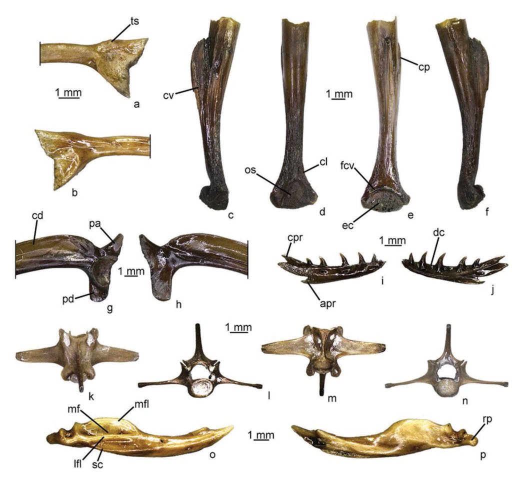
Figure 4. Amphibians and reptiles from the II filling. Bombina sp.: left ilium (MSNVE-23374/3) in lateral (a) and medial (b) views. Bufo bufo: right humerus (MSNVE-23375/4) in medial (c), dorsal (d), ventral (e) and lateral (f) views. Rana dalmatina vel R. latastei: right ilium (MSNVE-23376/22) in lateral (g) and medial (h) views. Anguis gr. A. fragilis: right dentary (MSNVE-23379/6) in lateral (i) and medial (j) views. Lacerta gr. L. viridis: caudal vertebra (MSNVE-23378/1) in dorsal (k), anterior (l), ventral (m) and posterior (n) views. Hierophis viridiflavus: right compound bone (MSNVE-23380) in lateral (o) and medial (p) views. apr, angular process; cd, crista dorsalis; cl, crista lateralis; cp, crista paraventralis; cpr, coronoid process; cv, crista ventralis; dc, dorsal crest; ec, eminentia capitata; fcv, fossa cubitalis ventralis; lfl, lateral flange; mf, mandibular fossa; mfl, medial flange; os, olecranon scar; pa, pars ascendens; pd, pars descendens; rp, retroarticular process; sc, supraangular crest; ts, tuber superior.

prezygapophyses and the anterior margin of their neurapophysis can be vertical (Ratnikov and Litvinchuk 2007); moreover, the largest vertebrae herein described are much smaller than the maximum size reached by trunk vertebrae of those two genera: CL: 3.1 mm and PR-PO: 3.6 mm for Ichthyosaura and CL: 4.4 mm and PR-PO: 5.0 mm for Ommatotriton (Ratnikov and Litvinchuk 2007). The maximum size of the vertebrae from Tenuta Zuccarello is also smaller than that of L. montandoni (CL: 3.4 mm and PR-PO: 3.8 mm) and comparable with that of L. vulgaris (CL: 2.5 mm and PR-PO: 2.9 mm) as reported by Ratnikov and Litvinchuk (2007), but since trunk vertebrae of such species are strongly similar, we simply referred MSNVE-23360/1 and 2 to the species complex Lissotriton gr. L. vulgaris. We include at least L. vulgaris and L. italicus in this complex, but the comparative osteology of Lissotriton species in general is poorly known and therefore other species cannot be excluded a priori. MSNVE-23360/3 and 4 have been assigned to the same species complex because of the small size and the thin shaft, but also because of the strongly inclined crista ventralis of the humerus, the elongated area between caput femoris and trochanter and the slightly convex distal margin of the femur (Holman 1998).