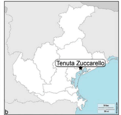
Figure 1. Maps. Map of Northern Italy (a) showing the position of the Venetian Lagoon (black rectangle) and map of Veneto (b) showing the position of Tenuta Zuccarello.

The faunal remains are very well preserved and have been radiocarbon dated at 2000 ± 40 years BP (Bon et al. 2010). Bon et al. (2010) considered the assemblage to be originated because of the well acting as a trap, based on the good preservation of the remains, the absence of signs of transport, digestion and predatory activities, and the dominance of wild species. However, the alternative possibility of remains of animals that died in the nearby and were later washed into the well should also be taken into account, considering that some kind of superficial water body was most likely in direct contact with the well (as suggested by the presence of some of the freshwater molluscs; Bon et al. 2010). This second explanation might better agree with the fact that some vertebrate taxa are represented only by few remains and not by a number of skeletal elements congruent with complete, or roughly complete, individuals as one would expect in case of animals falling into the well and then being subject to little or no disturbance.