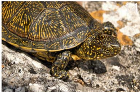
Figs. 9–14. The amphibians and reptiles in the localities where they were recorded in Albania. 9 – Triturus macedonicus (Karaman, 1922), male, Shelegurë. 10 – Bufo viridis complex (Laurenti, 1768) male, Ardenica. 11 – Pelophylax cf. epeiroticus (Schneider, Sofianidou & Kyriakopoulou-Sklavounou, 1984), juvenile, Butrint. 12 – Rana graeca Boulenger, 1891, Drenovë. 13 – Pelophylax cf. shqipericus (Hotz, Uzzell, Günther, Tunner & Heppich, 1987), male, Lake Skadar. 14 – Emys orbicularis (Linnaeus, 1758), female, Butrint.