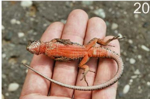
Figs. 15–20. The reptiles in the localities where they were recorded in Albania. 15 – Mauremys rivulata (Valenciennes, 1833), Butrint. 16 – Lacerta viridis complex, female, Llogarë. 17 – Lacerta viridis complex, male, Drenovë. 18 – Lacerta trilineata Bedriaga, 1886, female, Himarë. 19 – Podarcis erhardtii (Bedriaga, 1882), male, Drenovë. 20 – Podarcis muralis (Laurenti, 1768), Shelegurë.