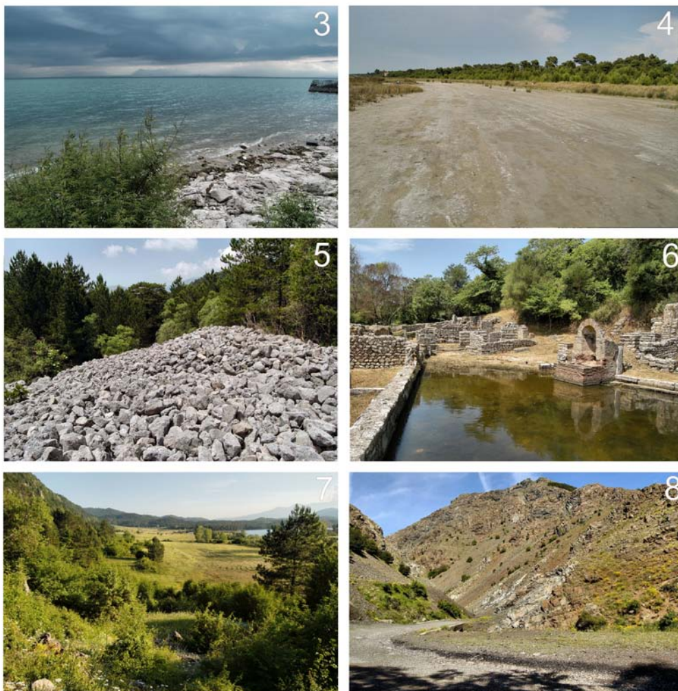
Figs. 3–8. The localities and habitats in Albania that were investigated. 3 – Littoral of the Lake Skadar (locality No. 1). 4 – Diviakë in Karavastasë (No. 4). 5 – Llogarë (No. 7b) where Anguis graeca , Algyroides nigropunctatus , Podarcis muralis and Vipera ammodytes were found. 6 – Habitat at Butrint (No. 10a) where Emys orbicularis and Mauremys rivulata were found. 7 – A general view of the biotope Shelegurë, 1032 m a. s. l. (No. 15). 8 – A view of the locality Drenovë, 1143 m a. s. l. (No. 17).

RECORDS. Ardenica cloister, 43 m a. s. l.: 3 adult specimens (Fig. 10); Butrint Lake, 1 m a. s. l.: 2 juvenile individuals. OCCURRENCE. Common Albanian species occurring mainly in lowland areas in the Western Depression and also high in the mountains (Haxhiu 1994). Sensu Stöck et al. 2009 in Albania occurs Bufo variabilis (Pallas, 1769). DISTRIBUTION. It is a species complex (Stöck et al. 2006) distributed from North Africa, across the Mediterranean, central and south Europe to west Asia and Mongolia. COMMENTS. The surroundings of the localities were sandy and dry.