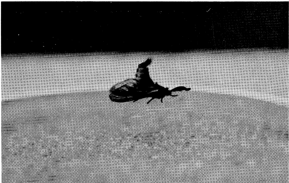
Fig. 1. Adult male Pryeria sinica exhibiting the "abdomen-elevation" behavior.

The experiment was conducted as previously described (Johki and Hidaka, 1979) but mealworms were chosen as the palatable control insects this time. One experimental