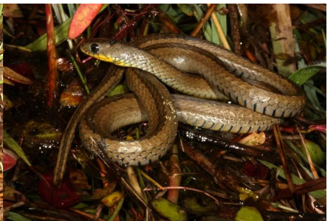
Olive Marsh Snake ( Natriciteres olivacea )