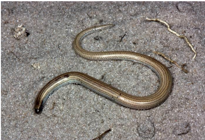
Kalahari Burrowing Skink ( Typhlacontias rohani )