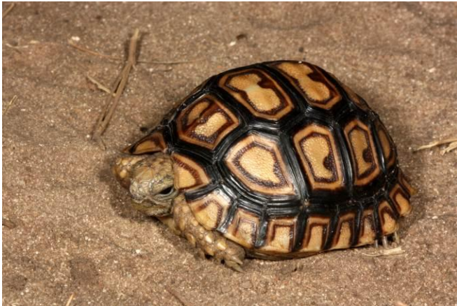
Leopard Tortoise ( Stigmochelys pardalis )