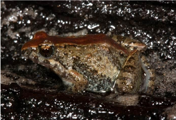
Unidentified Puddle Frog ( Phrynobatrachus sp.)