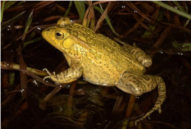
Lemaire's Toad ( Amietophrynus lemairii )