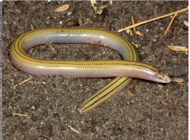
Striped Blind Legless Skink ( Acontias kgalagadi )