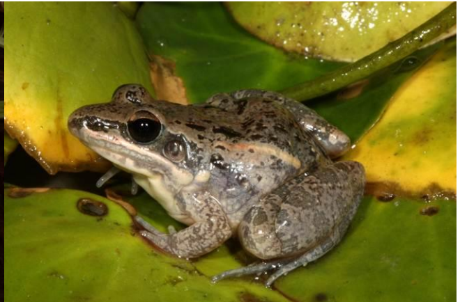
Unidentified Grass Frog ( Ptychadena sp.)