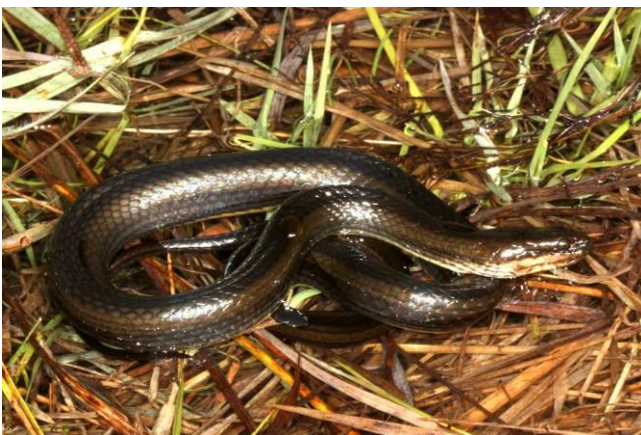
Striped Swamp Snake ( Limnophis bangweolicus )