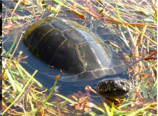
Okavango Mud Terrapin ( Pelusios bechuanicus )