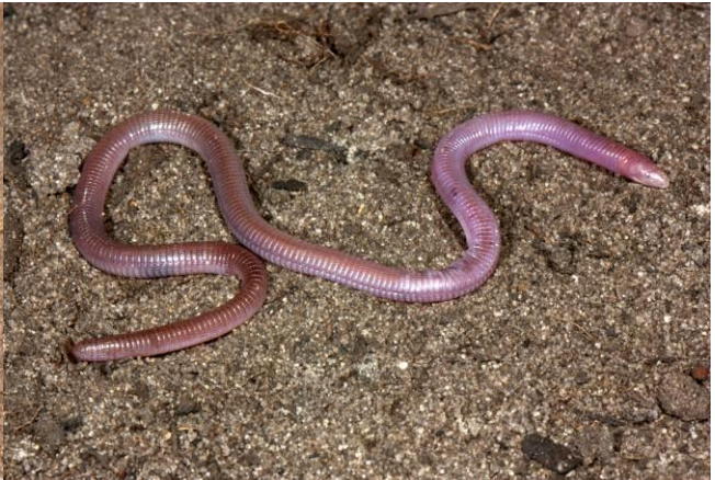
Kalahari Round-headed Worm Lizard ( Zygaspis quadrifrons )