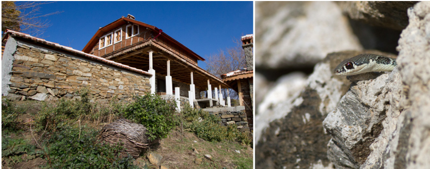
Figure 4. The new build dry stone walls of Vila Fauna became a suitable reptile habitat, for example for Platyceps najadum .

2. Construction of dry stone walls was identified as an effective measure in support of amphibians and reptiles. The walls were deliberately made without using cement, in order to preserve the suitable spaces between the stones (Langton and Burton, 1998). During the research five species were observed in the new build walls of NCCVF ( Salamandra salamandra , Lacerta viridis , Podarcis erhardii , Dolichophis caspius , Platyceps najadum ), where suitable shelters and basking places were provided (Figure 3).