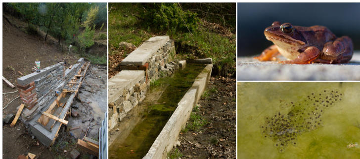
Figure 3. Construction of water source with pool for cattle, inhabited by Rana dalmatina within the same season.