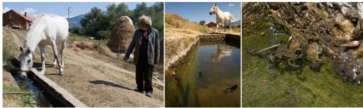
Figure 2. Water source used by the domestic animals and inhabited by amphibians, including over 200 ind. of Bombina variegata .

1. Building of artificial water bodies was recognized as the most effective measure for the support of the populations of Bombina variegata , Rana dalmatina , Rana graeca , Pelophylax ridibundus and partially Natrix natrix (Figure 2). These species were observed in the cattle water tanks, including the new build by FWFF, where the process of inhabiting was short - within the same active season (Figure 2). As some of the streams in the area are drying during summer, the establishment of larger pools along them is an effective way to provide the amphibians with more places suitable for reproduction. After the building of such pool in the early spring of 2014, a Greek stream frog was observed there for the first time in the area within the same active season.